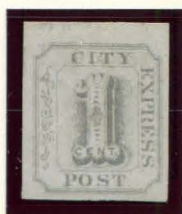
REPRINT 1¢ GRAYISH GREEN ON OFF-WHITE (2L3)