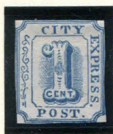
FORGERY B 1¢ BLUE ON WHITE (2L3)