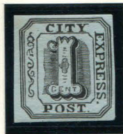
FORGERY C TAYLOR - FORM 1 1c BLACK ON BLuish (2L3)