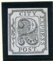
FORGERY AA 2¢ BLACK ON WHITE V LAID (2L4)