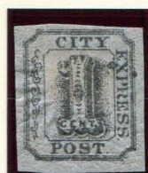
FORGERY D 1¢ BLACK ON WHITE (2L3)