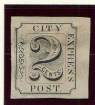
REPRINT 2¢ BLACK ON BUFF (2L4)