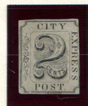
REPRINT 2¢ BLACK ON GRAYISH (2L4)