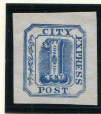
FORGERY A 1¢ BLUE ON WHITE (2L3)