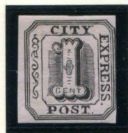
FORGERY C TAYLOR - FORM 1 1c BLACK ON PALE PINK H LAID (2L3)