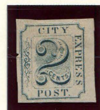
REPRINT 2¢ BLUE (SHADE) ON BUFF (2L5)