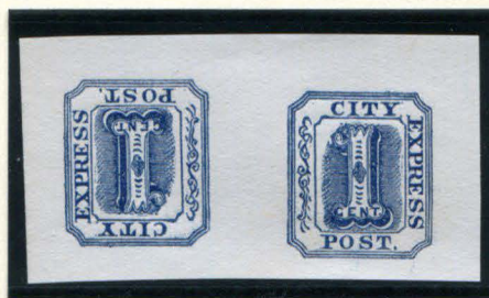
FORGERY A 1¢ BLUE ON WHITE V LAID TÊTE-BÊCHE PAIR (2L3)