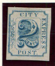
REPRINT 2¢ BLUE (SHADE) ON OFF-WHITE (2L5)