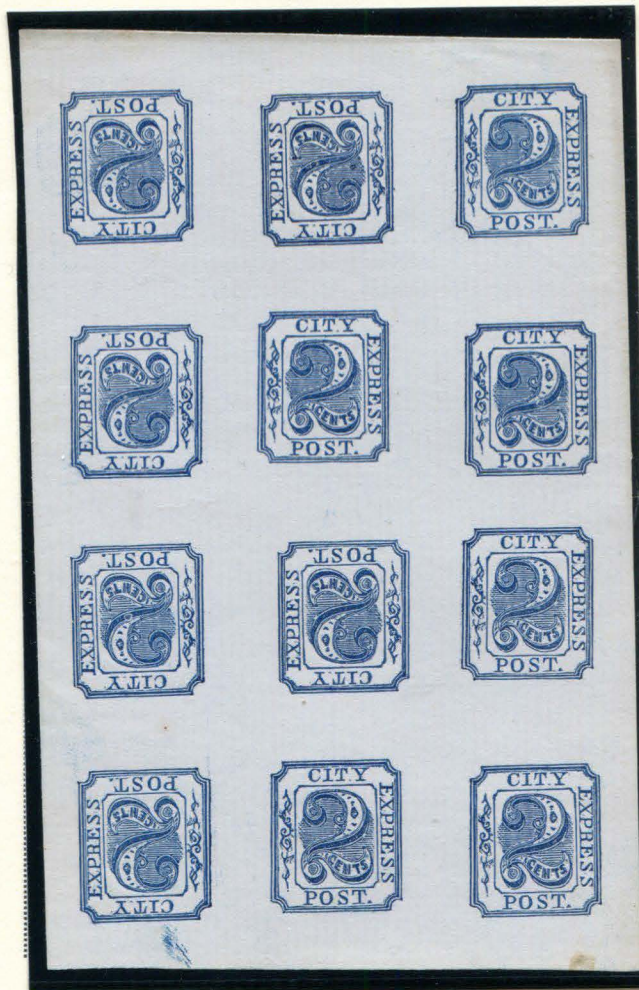
FORGERY AA 2¢ BLUE ON WHITE V LAID TÊTE-BÊCHE BLOCK OF TWELVE (2L4)