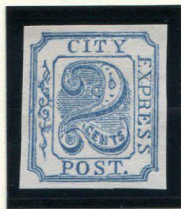
FORGERY AA 2¢ BLUE (SHADE) ON WHITE (2L4)