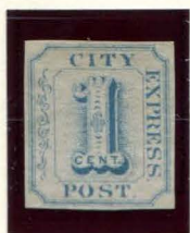
REPRINT 1¢ BLUE (SHADE) ON BUFF (2L3)