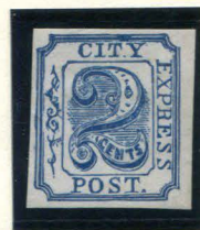
FORGERY AA 2¢ BLUE (SHADE) ON WHITE WOVE (2L4)