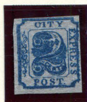
FORGERY DD 2¢ BLUE (SHADE) ON WHITE PELURE (2L4)