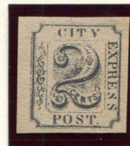
FORGERY MODERN 2¢ BLACK ON BUFF (2L4)