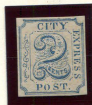
FORGERY BB 2¢ BLUE ON BUFF (2L4)