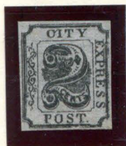
FORGERY DD 2¢ BLACK ON WHITE PELURE (2L4)