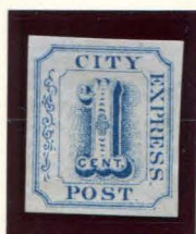
REPRINT 1¢ BLUE (SHADE) ON WHITE (2L3)