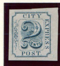
REPRINT 2¢ BLUE (SHADE) ON WHITE (2L5)