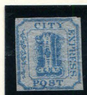
FORGERY D 1¢ BLUE ON WHITE (2L3)