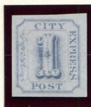
REPRINT 1¢ GRAYISH BLUE ON WHITE (2L3)