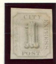
REPRINT 1¢ GRAYISH GREEN ON BUFF (2L3)