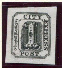
FORGERY A 1¢ BLACK ON WHITE V LAID (2L3)