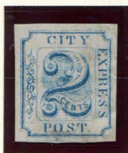
REPRINT 2¢ BLUE (SHADE) ON OFF-WHITE (2L5)