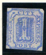
FORGERY F MOENS - 1883 1¢ BLUE ON WHITE (2L3)