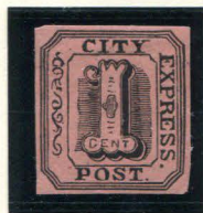
FORGERY C TAYLOR - FORM 1 1c BLACK ON SALMON (2L3)

S. Allan Taylor's forgery of 2L3 is known in a variety of colors.