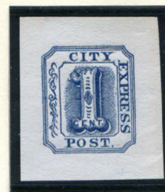
FORGERY A 1¢ BLUE ON WHITE V LAID (2L3)