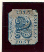
REPRINT 2¢ BLUE (SHADE) ON OFF-WHITE (2L5)