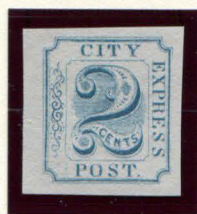
REPRINT 2¢ BLUE (SHADE) ON WHITE (2L5)