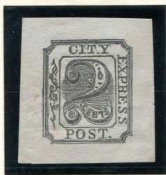
FORGERY AA 2¢ BLACK ON WHITE (2L4)