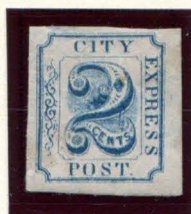
REPRINT 2¢ BLUE (SHADE) ON WHITE (2L5)