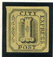
FORGERY C TAYLOR - FORM AA8 1c BLACK ON DULL YELLOW (2L3)