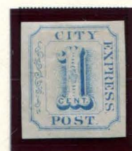
REPRINT 1¢ BLUE (SHADE) ON OFF-WHITE (2L3)