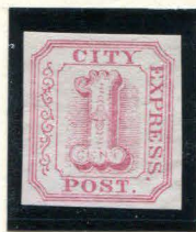
FORGERY E MOENS 1¢ RED ON WHITE (2L3)