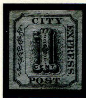
2L3 GENUINE 1c BLACK ON GRAY

Once released, the brothers continued with their scam, this time dropping the name "Adams" and working under "City Express". They produced a new series of stamps, replacing the word "ADAMS" on the left side with scrollwork.