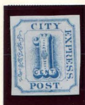
REPRINT 1¢ BLUE (SHADE) ON WHITE (2L3)