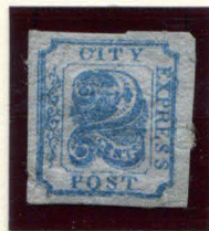
FORGERY DD 2¢ BLUE (SHADE) ON WHITE PELURE (2L4)