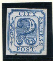
FORGERY AA 2¢ BLUE ON WHITE V LAID (2L4)