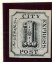
REPRINT 1¢ BLACK ON OFF-WHITE (2L3)