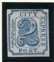
FORGERY BB 2¢ DULL BLUE ON WHITE (2L4)