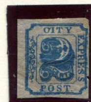
FORGERY DD 2¢ BLUE (SHADE) ON WHITE PELURE (2L4)