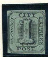
FORGERY C TAYLOR - FORM AA8 1c BLACK ON DULL GREEN (2L3)