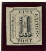
REPRINT 1¢ BLACK ON BUFF (2L3)