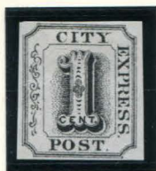
REPRINT 1¢ BLACK ON WHITE (2L3)

The reprints of the 1¢ stamps were printed in black and in shades of blue. The blue ink can sometimes change into a grayish green over time. Full sheets exist out of twenty-five stamps, arranged five by five.