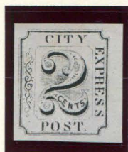
REPRINT 2¢ BLACK ON WHITE (2L4)

The 2¢ stamps reprints were also printed in black and in shades of blue. The full sheets are made of fifty stamps, consisting out of five groupings of ten stamps each, arranged two by five. Three groupings are side by side on the top part of the sheet, followed by two groupings sideways underneath them.