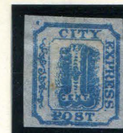
FORGERY D1 1¢ BLUE ON WHITE (2L3)