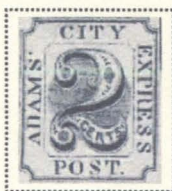
EXAMPLE OF ORIGINAL ADAMS' CITY EXPRESS 2¢ STAMP (2L2) FROM SIEGEL SALE 925

Although the Fullers used their business as a means of robbing customers, the post was probably at least semi-legitimate. The brothers set up at least fifty post boxes and produced stamps for their patrons.