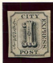
REPRINT 1¢ BLACK ON CREAM (2L3)