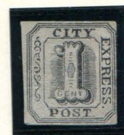
FORGERY C TAYLOR 1c BLACK ON GRAY (2L3)