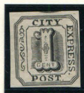
FORGERY C TAYLOR - (FORM 1) 1c BLACK ON CREAM H LAID (2L3)