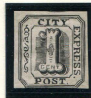
FORGERY C TAYLOR - FORM 1 1c BLACK ON WHITE WATERMARKED (2L3)