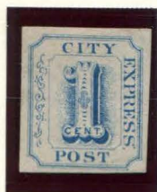
REPRINT 1¢ BLUE (SHADE) ON BUFF (2L3)