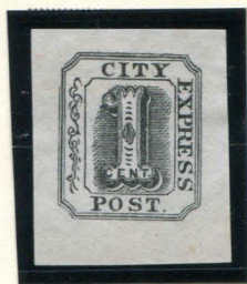
FORGERY A 1¢ BLACK ON WHITE (2L3)