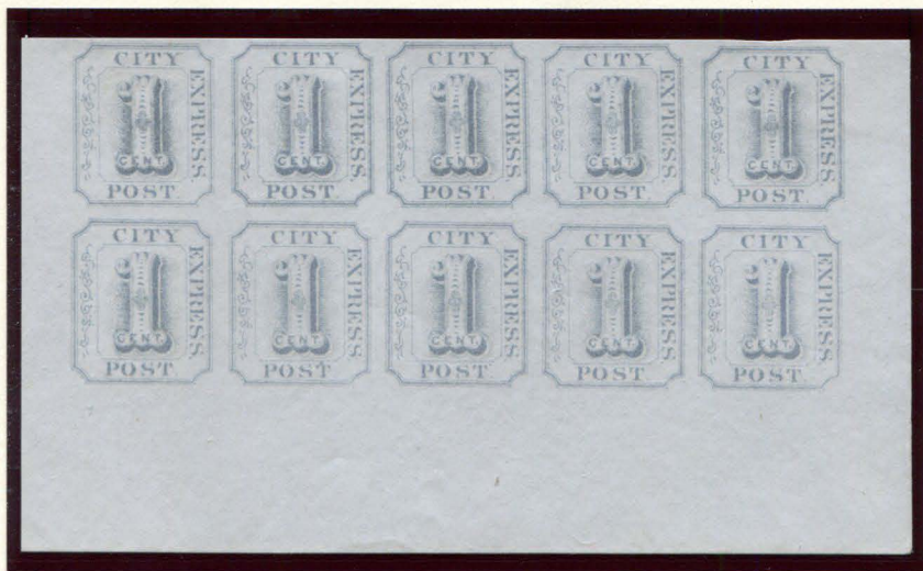
REPRINT 1¢ GRAYISH BLUE ON WHITE BLOCK OF TEN (2L3)