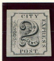
REPRINT 2¢ BLACK ON OFF-WHITE (2L4)