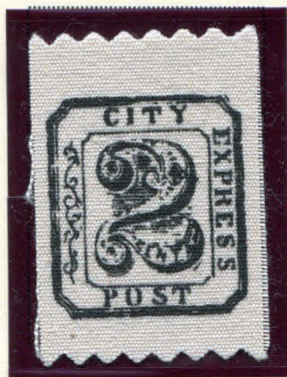
FORGERY MODERN (MICHEALS STORE) 2¢ BLACK ON CANVAS (2L4)