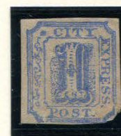
FORGERY F MOENS - 1883 1¢ BLUE ON BUFF (2L3)