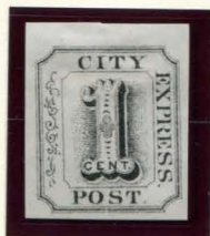
REPRINT 1¢ BLACK ON WHITE (2L3)