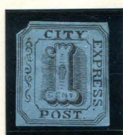
FORGERY C TAYLOR - FORM AA8 1c BLACK ON DULL BLUE (2L3)