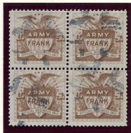
BOGUS - BROWN BLOCK OF FOUR CANCELLED FOUR CORNERED CORK CANCEL