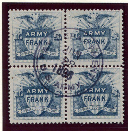
BOGUS - BLUE BLOCK OF FOUR CANCELLED US ARMY CDS JUNE 28, 1898

These were most likely favor cancels. It is also possible that the stamps were cancelled by postal agents when affixed to covers that were mailed prepaid by other methods.