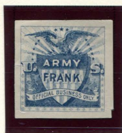
BOGUS BLUE IMPERFORATE

The Army Frank stamps are known in rose, blue, and brown colors. The colors do not appear to have any significance regarding supposed value or usage. Most examples are perforated, but imperforate and mixed perforation stamps also exist.