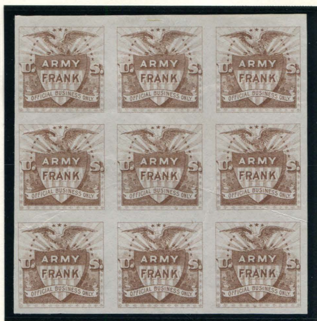
BOGUS - BROWN BLOCK OF NINE IMPERFORATE