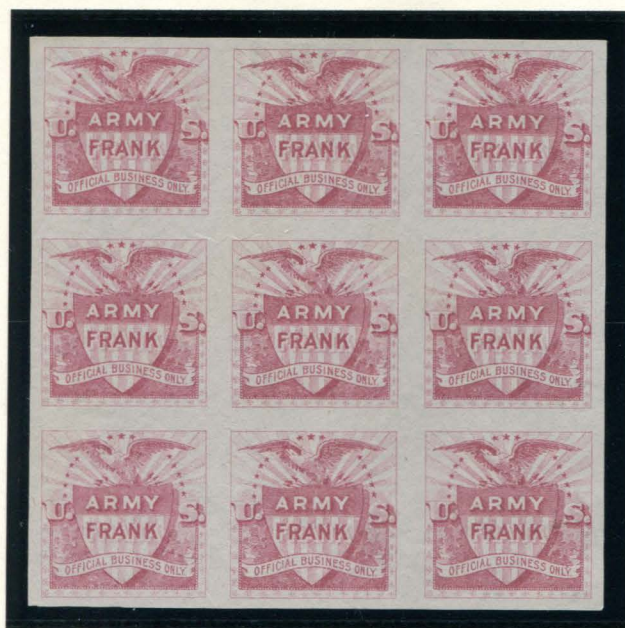
BOGUS - ROSE BLOCK OF NINE IMPERFORATE