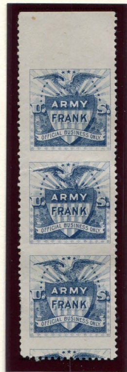
BOGUS - BLUE VERTICAL STRIP OF THREE IMPERFORATE BETWEEN - HORIZONTAL

Although the Army Franks were not legitimate payment for postage, some examples are cancelled. Many of the cancels are from US army post offices.