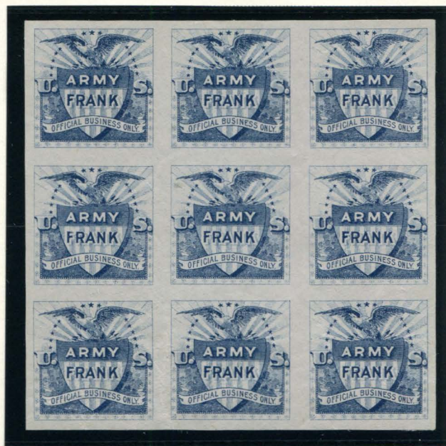
BOGUS - BLUE BLOCK OF NINE IMPERFORATE