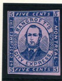
BOGUS 1A TAYLOR - FORM 11 5c BLUE ON PINK H LAID