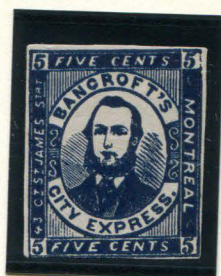
BOGUS 1A TAYLOR 5c DARK BLUE ON WHITE