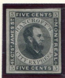
BOGUS 4 NUTTER 5¢ BLACK ON WHITE POSSIBLE PROOF