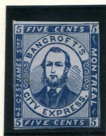
BOGUS 1 TAYLOR - FORM S18 5c BLUE ON BLUISH V LAID