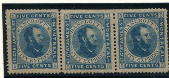
BOGUS 4 NUTTER 5¢ BLUE ON WHITE STRIP OF THREE PERFORATED 12 1/4