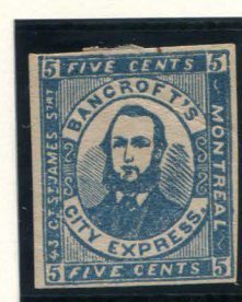
BOGUS 1A TAYLOR 5c GREENISH BLUE ON BUFF