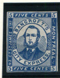
BOGUS 1 TAYLOR - FORM S18 5c BLUE ON WHITE