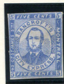
BOGUS 1A TAYLOR - FORM 15 5c ULTRAMARINE ON WHITE V LAID