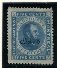
BOGUS 4 NUTTER 5c BLUE ON WHITE PERFORATED 12 1/4 CANCELLED WITH "E.I.B." INITIALS