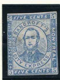
BOGUS 1A TAYLOR 5c PALE BLUE ON WHITE