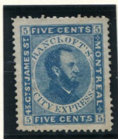
BOGUS 4 NUTTER 5¢ BLUE ON WHITE PERFORATED 12 1/4

Nutter continued to sell stamps of his second, copper engraved design, which are the more scarce of the two varieties. Although Nutter never produced another postage stamp, he did produce an advertising label with his own portrait in the center.