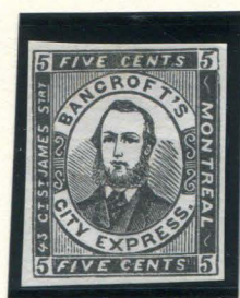
BOGUS 1A TAYLOR - FORM 15 5c BLACK ON WHITE H LAID