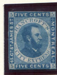
BOGUS 4 NUTTER 5¢ BLUE ON WHITE CUT CLOSE