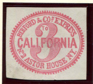
FORGERY B - 3¢ TAYLOR - FORM S6 BRIGHT PINK ON WHITE (11L1)