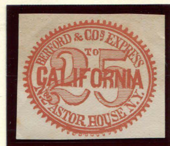
FORGERY C - 25¢ SCOTT ORANGE (SHADE) ON THICK WHITE (11L4)