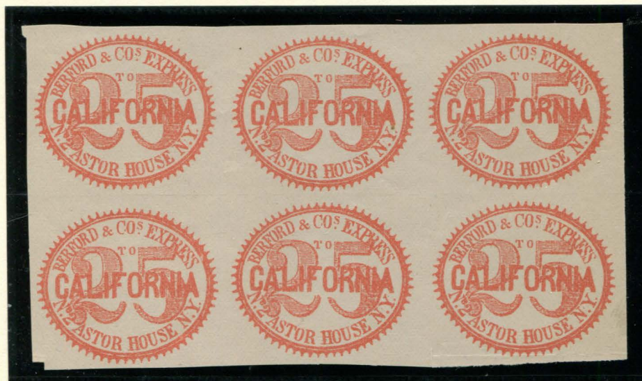
FORGERY A - 25¢ CASEY ORANGE RED ON WHITE BLOCK OF SIX (11L4)