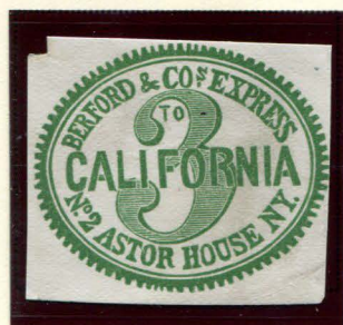
FORGERY B - 3¢ TAYLOR - FORM S5 GREEN ON WHITE (11L1)