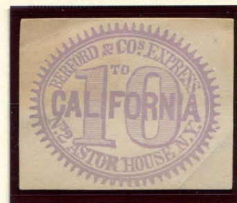
FORGERY C - 10¢ SCOTT LILAC (SHADE) ON THICK WHITE (11L3)