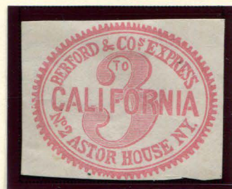
FORGERY B - 3¢ TAYLOR - FORM S6 PINK ON WHITE WMK (11L1)