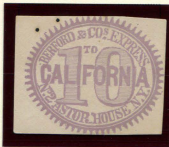
FORGERY C - 10¢ SCOTT LILAC (SHADE) ON THICK WHITE (11L3)