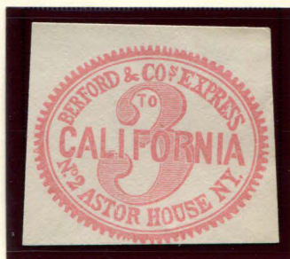
FORGERY B - 3¢ TAYLOR - FORM S6 PINK ON WHITE (11L1)