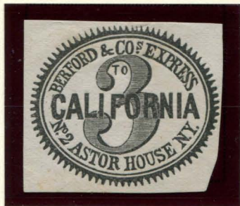
FORGERY C - 3¢ SCOTT BLACK ON THIN WHITE (11L1)