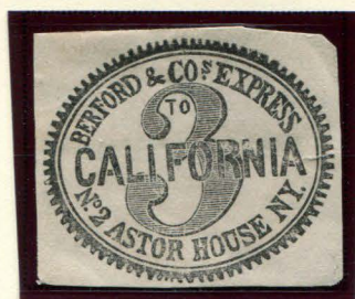
FORGERY B - 3¢ TAYLOR - FORM AB7 BLACK ON OFF-WHITE (11L1)