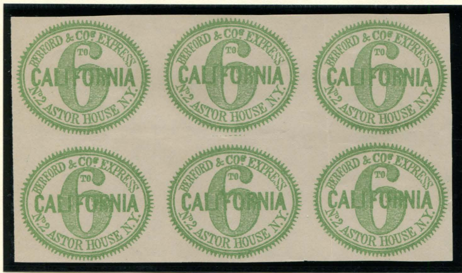
FORGERY A - 6¢ CASEY YELLOW GREEN ON WHITE BLOCK OF SIX (11L2)