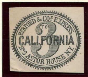
FORGERY C - 3¢ SCOTT BLACK ON THICK WHITE (11L1)