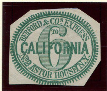
FORGERY C - 6¢ SCOTT GREEN ON THIN WHITE (11L2)