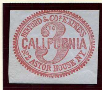
FORGERY B - 3¢ TAYLOR - FORM 12 RED ON GRAY (11L1)