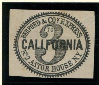
FORGERY A - 3¢ CASEY BLACK ON WHITE (11L1)