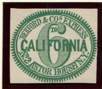
FORGERY C - 6¢ SCOTT GREEN ON THICK WHITE (11L2)