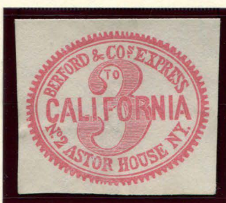
FORGERY B - 3¢ TAYLOR - FORM S6 BRIGHT PINK ON WHITE WMK (11L1)