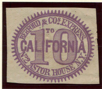
FORGERY C - 10¢ SCOTT VIOLET ON THIN WHITE (11L3)