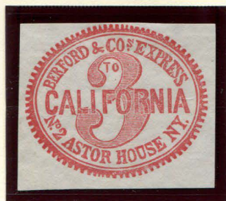
FORGERY B - 3¢ TAYLOR - FORM 12 RED ON WHITE (11L1)

The S. A. Taylor forgeries are listed as Forgery B. He only made forgeries of the 3¢ nL1 stamp, and unlike most of Taylor's forgeries, these appear in only a few colors. The stamps on forms S5 and S6 have an extra identifier: there is a break on the left side of the "O" of "ASTOR".