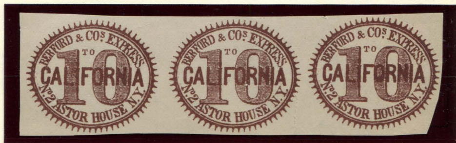
FORGERY A - 10¢ CASEY BROWN ON WHITE STRIP OF THREE (11L3)