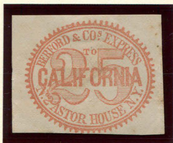
FORGERY C - 25¢ SCOTT ORANGE (SHADE) ON THIN WHITE (11L4)