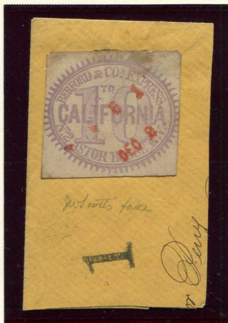
FORGERY C - 10¢ SCOTT LILAC ON WHITE (11L3) ON PIECE FAKE RED HANDSTAMP: **61 DEC 9