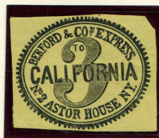
FORGERY B - 3¢ TAYLOR - FORM AB7 BLACK ON YELLOW (11L1)