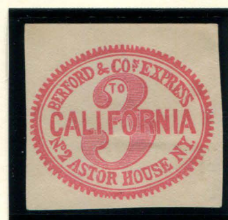
FORGERY B - 3¢ TAYLOR - FORM S6 BRIGHT PINK ON CREAM (11L1)