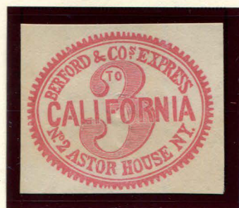
FORGERY B - 3¢ TAYLOR - FORM S6 BRIGHT PINK ON CREAM WMK (11L1)