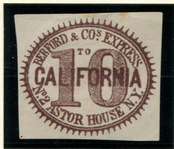
FORGERY A - 10¢ CASEY BROWN ON WHITE (11L3)