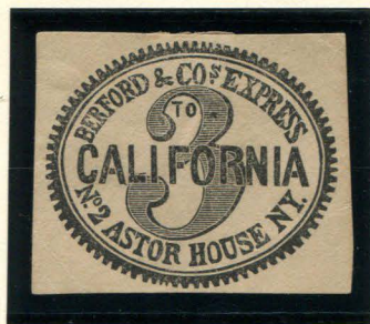
FORGERY B - 3¢ TAYLOR - FORM S6 BLACK ON BUFF (11L1)