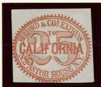
FORGERY C - 25¢ SCOTT ORANGE (SHADE) ON THICK WHITE (11L4)