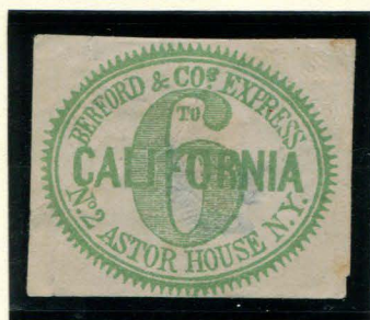
FORGERY A - 6¢ CASEY YELLOW GREEN ON WHITE (11L2)