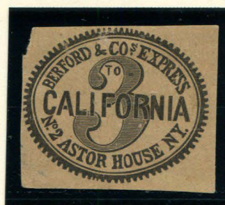
FORGERY B - 3¢ TAYLOR BLACK ON BUFF (11L1)