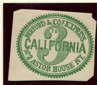
FORGERY B - 3¢ TAYLOR - FORM S5 GREEN ON CREAM H LAID (11L1)