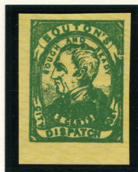
MODERN FORGERY 2¢ GREEN ON YELLOW WAVED (18L1)