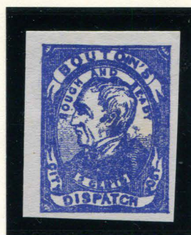
MODERN FORGERY 2¢ BLUE ON WHITE (18L1)