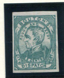
2 ND REPRINT TYPE I 2c DULL GREEN (18L1)