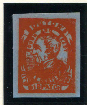
MODERN FORGERY 2¢ RED ON BLUE (18L1)