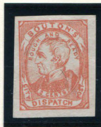
2 ND REPRINT TYPE I 2c RED (18L1)