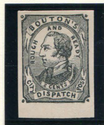
FORGERY D 2¢ BLACK ON YELLOWISH WHITE TYPE II (18L2)