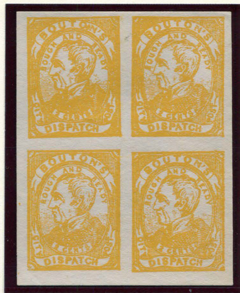
MODERN FORGERY 2¢ YELLOW ON WHITE BLOCK OF FOUR (18L1)