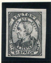
2 ND REPRINT TYPE I 2c BLACK - THICK PAPER (18L1)