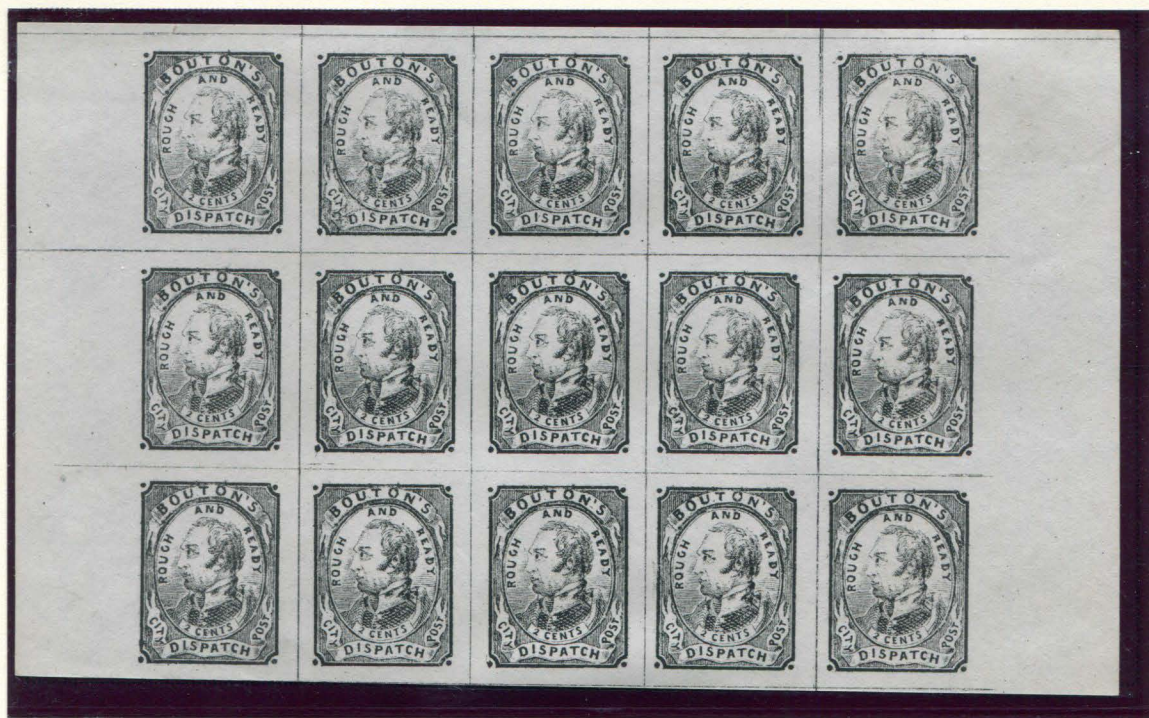
FORGERY B 2¢ BLACK ON YELLOWISH WHITE TYPE II (18L2)