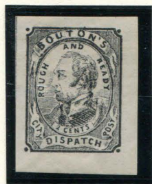
FORGERY B 2¢ BLACK ON YELLOWISH WHITE TYPE II (18L2)