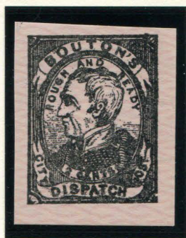
MODERN FORGERY 2¢ BLACK ON SALMON WAVED (18L1)