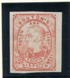
FORGERY A SCOTT 2¢ RED ON THICK CREAM TYPE II (18L2)