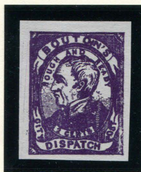
MODERN FORGERY 2¢ PURPLE ON WHITE (18L1)