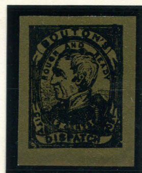
MODERN FORGERY 2¢ BLACK ON GOLD SC (18L1)