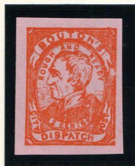
MODERN FORGERY 2¢ RED ON PINK (18L1)