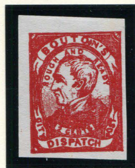
MODERN FORGERY 2¢ RED ON WHITE (18L1)