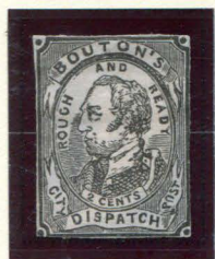
FORGERY C 2¢ BLACK ON THICKER WHITE TYPE II (18L2)