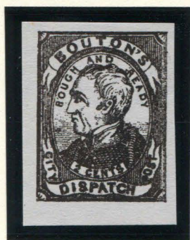
MODERN FORGERY 2¢ BLACK ON WHITE (18L1)

The following enlarged type 1 look-alikes are unlisted.