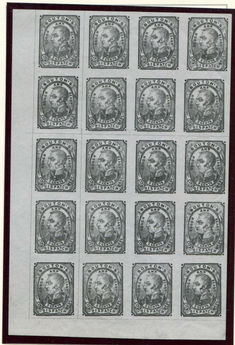
FORGERY A SCOTT 2¢ BLACK ON THIN WHITE TYPE II - (18L2) SHEET OF TWENTY