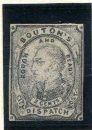
FORGERY A SCOTT 2¢ BLACK ON THICK CREAM TYPE II (18L2)