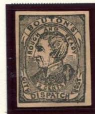
FORGERY B STIRLING 2c BLACK ON PEACH TYPE I (18L1)