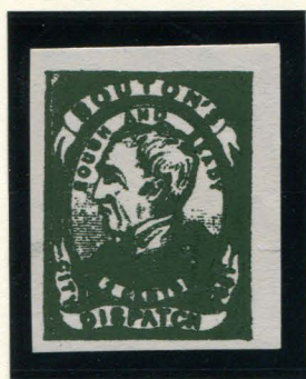
MODERN FORGERY 2¢ DARK GREEN ON WHITE (18L1)