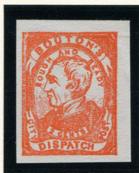
MODERN FORGERY 2¢ ORANGE ON WHITE (18L1)