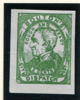
MODERN FORGERY 2¢ LIGHT GREEN ON WHITE (18L1)