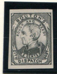
FIRST REPRINT HUSSEY 2c BLACK TYPE I (18L1) TRANSFER 7

A full sheet of eighty-four reprint stamps is included on the following page. Each row of twelve represents a different transfer type, starting with 1 at the top, and 7 at the bottom.