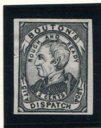
2 ND REPRINT TYPE I 2c BLACK - THIN PAPER (18L1)