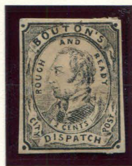
FORGERY B 2¢ BLACK ON BUFF TYPE II (18L2)