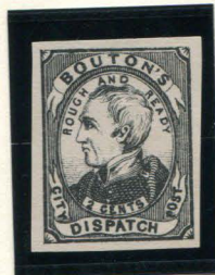
FIRST REPRINT HUSSEY 2c BLACK TYPE I (18L1) TRANSFER 2