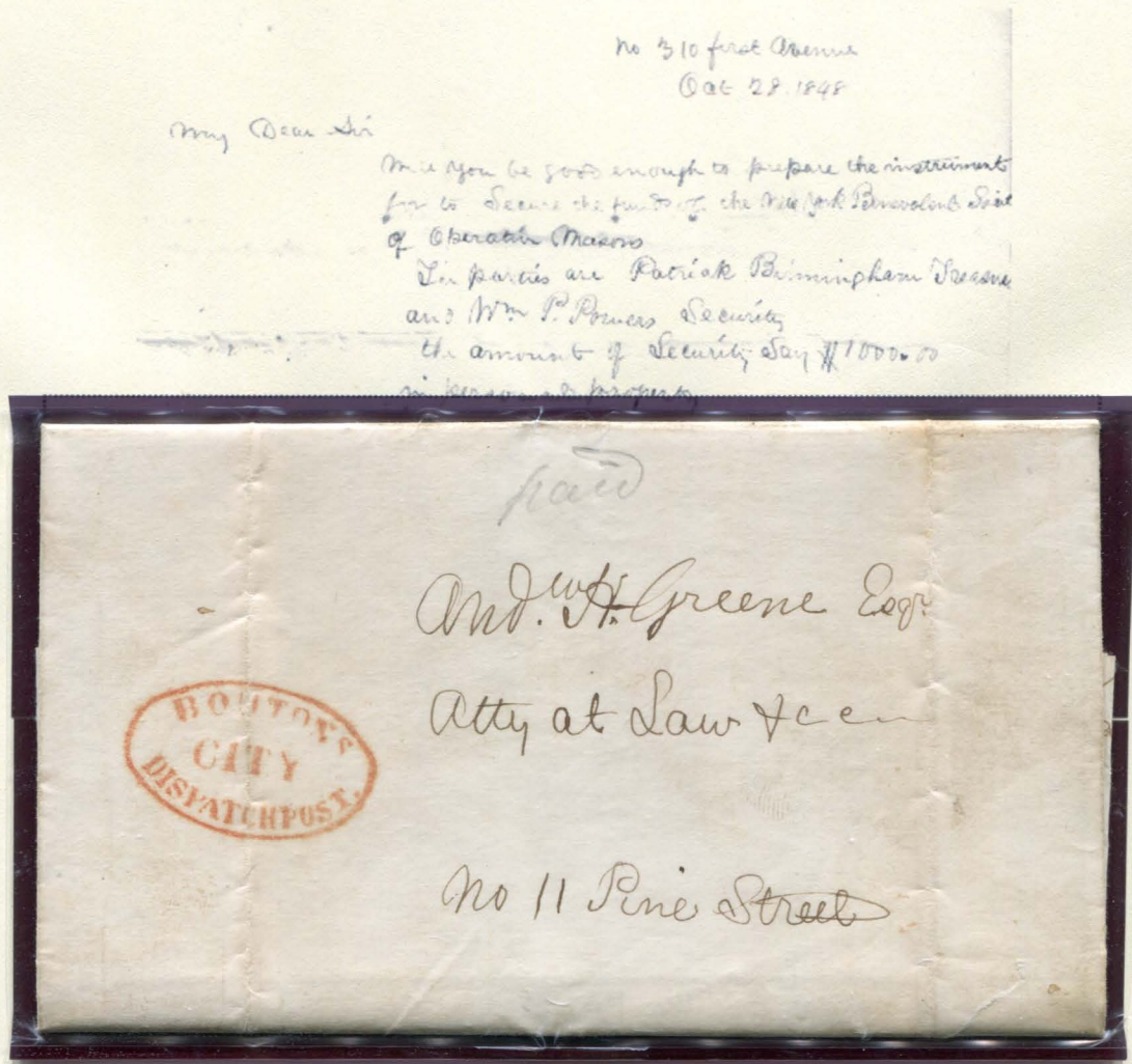
RED BOUTON'S CITY DISPATCH POST OVAL HANDSTAMP OCTOBER 28, 1848

The cover below was mailed in October of 1848. It is marked with a red Bouton's City Dispatch Post handstamp, and manuscript "paid".