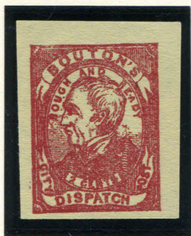
MODERN FORGERY 2¢ VIOLET RED ON YELLOW (18L1)