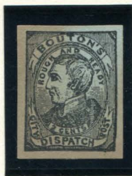
FORGERY B STIRLING 2c BLACK ON PALE BLUE GREEN TYPE I (18L1)