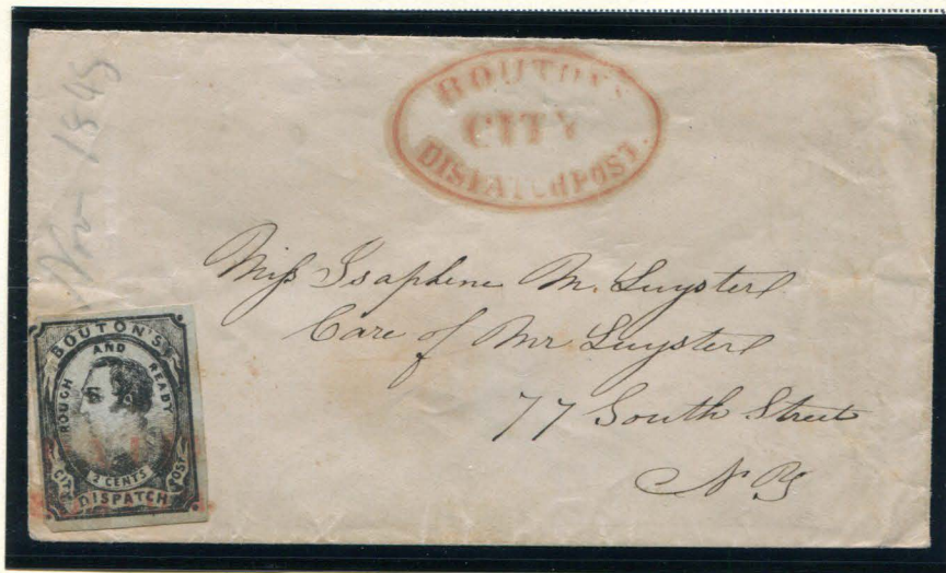
FORGERY B : TYPE II (18L2) 2¢ BLACK ON WHITE - RED "PAID BOUTON" CANCEL MAILED WITH RED "BOUTON'S CITY DISPATCH POST" OVAL HANDSTAMP

The red "Bouton's City Dispatch Post" oval handstamp appears to be genuine. Docketing on the cover dates it around November, 1848.