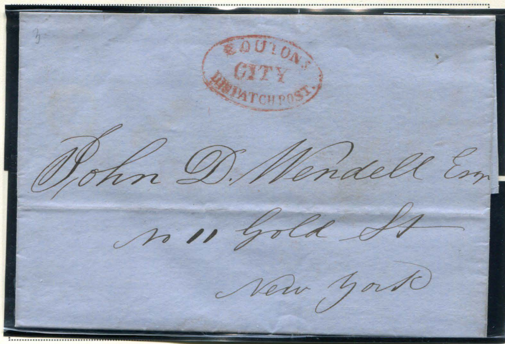
RED BOUTON'S CITY DISPATCH POST OVAL HANDSTAMP DECEMBER 14, 1847

In the fall of 1847, John R. Bouton began combining his New York local posts, Franklin City Despatch Post and Bouton's Manhattan Express, into a single service under the name Bouton's City Dispatch Post. The post of Dupuy & Schenck was also likely absorbed by Bouton around this time. Remaining stamps from these posts were used until early 1848. By spring of 1848, Bouton's City Dispatch had completely taken over all of Bouton's operations and issued its own stamps under the new name.