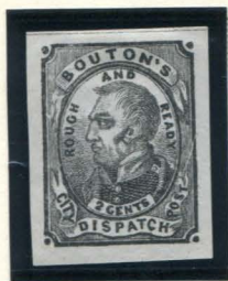
FORGERY A SCOTT 2¢ BLACK ON THIN WHITE TYPE II (18L2)