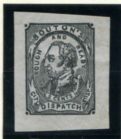
FORGERY C 2¢ BLACK ON THIN WHITE TYPE II (18L2)