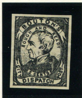
MODERN FORGERY 2¢ BLACK ON YELLOW (18L1)