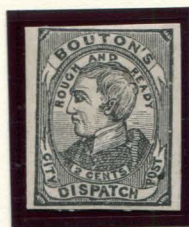
FORGERY A SCOTT 2c BLACK ON THICK WHITE TYPE I (18L1)