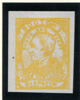
MODERN FORGERY 2¢ YELLOW ON WHITE (18L1)