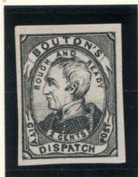
FIRST REPRINT HUSSEY 2c BLACK TYPE I (18L1) TRANSFER 1

Type I "Rough and Ready" stamps were reprinted twice as counterfeits. The first of these reprints, by George Hussey, can be identified by flaws in the seven transfer types.