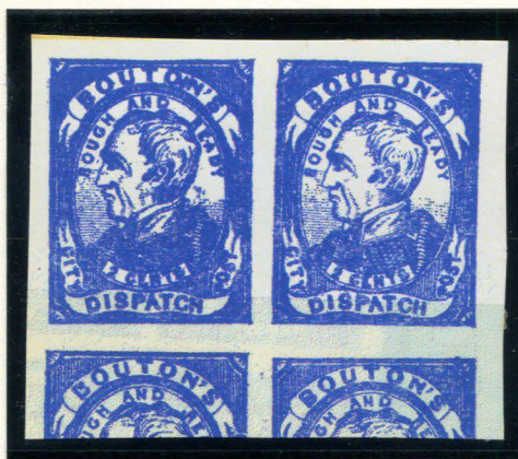
MODERN FORGERY 2¢ BLUE ON WHITE BLOCK OF TWO & TWO PARTIALS (18L1)