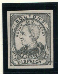
FIRST REPRINT HUSSEY 2c BLACK TYPE I (18L1) TRANSFER 3