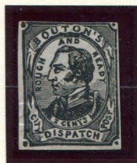
FORGERY E 2¢ INTENSE BLACK ON WHITE TYPE II (18L2)