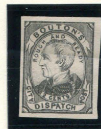
FIRST REPRINT HUSSEY 2c BLACK TYPE I (18L1) TRANSFER 4