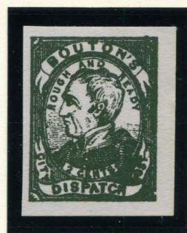
MODERN FORGERY 2¢ GREEN ON WHITE (18L1)