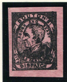
MODERN FORGERY 2¢ BLACK ON PINK MESH (18L1)