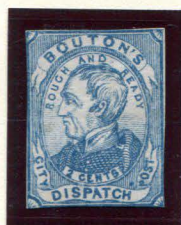
2 ND REPRINT TYPE I 2c BLUE (18L1)