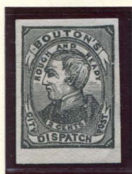
FORGERY A SCOTT 2c BLACK ON THIN WHITE TYPE I (18L1)