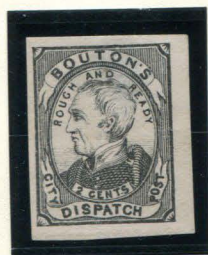
FIRST REPRINT HUSSEY 2c BLACK TYPE I (18L1) TRANSFER 5