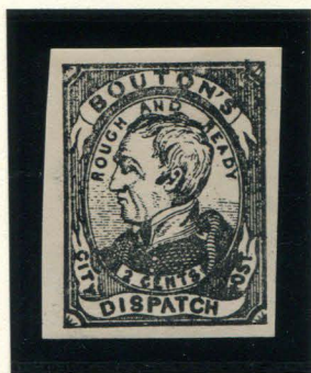
MODERN FORGERY 2¢ BLACK ON BUFF (18L1)