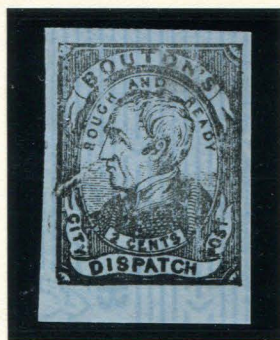
MODERN FORGERY 2¢ BLACK ON BLUE RULED (18L1)