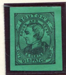
FORGERY A SCOTT 2c BLACK ON GREEN SC TYPE I (18L1)