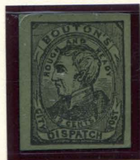
FORGERY B STIRLING 2c BLACK ON DARK GREEN TYPE I (18L1)