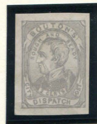
2 ND REPRINT TYPE I 2c GRAY (18L1)