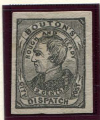
FORGERY A SCOTT 2c BLACK ON THIN CREAM TYPE I (18L1)