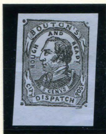
FORGERY E 2¢ BLACK ON PALE GRAY BLUE TYPE II (18L2)