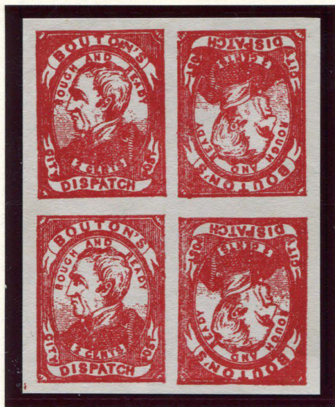
MODERN FORGERY 2¢ RED ON WHITE TETE-BECHE BLOCK OF FOUR (18L1)