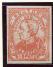
2 ND REPRINT TYPE I 2c RED - DOUBLE TRANSFER (18L1)