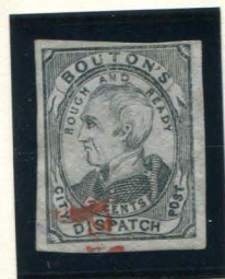
2 ND REPRINT TYPE I 2c BLACK ON WHITE FAKE "PAID" CANCEL (18L1)