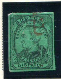
2 ND REPRINT TYPE I 2c BLACK ON GREEN FAKE "PAID" CANCEL (18L1)