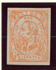
FORGERY F 2¢ ORANGE ON WHITE TYPE II (18L2)