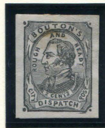
FORGERY E 2¢ GRAYISH BLACK ON WHITE TYPE II (18L2)