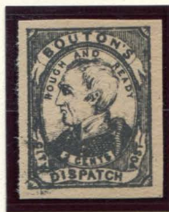
MODERN REPRINT TYPE I 2c BLACK (18L1)