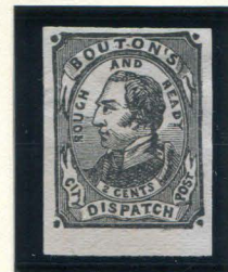
FORGERY D 2¢ BLACK ON WHITE TYPE II (18L2)