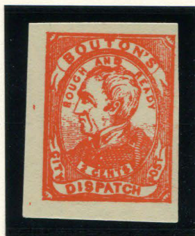
MODERN FORGERY 2¢ RED ON CREAM (18L1)