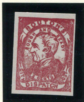
MODERN FORGERY 2¢ VIOLET RED ON WHITE (18L1)