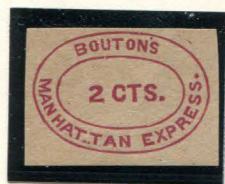
FORGERY B TAYLOR - FORM AB17 2¢ RED VIOLET ON TAN (17L1)