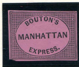
BOGUS 1 TAYLOR - FORM 9 BLACK ON PINK SC