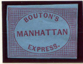
BOGUS 1 TAYLOR - FORM AB5 RED VIOLET ON GREENISH BLUE SC