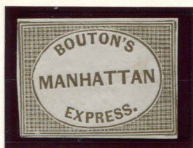
BOGUS 1 TAYLOR BRONZE ON WHITE