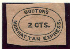
FORGERY B TAYLOR - FORM AB 1 2¢ BLACK ON PEACH (17L1)