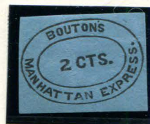
FORGERY B TAYLOR - FORM S1 2¢ BLACK ON GRAYISH BLUE (17L1)