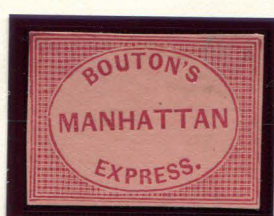
BOGUS 1 TAYLOR - FORM AA13 RED VIOLET ON SALMON