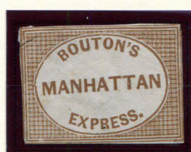
BOGUS 1 TAYLOR - FORM AA18 BROWN ON WHITE