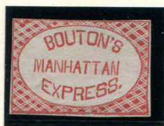
BOGUS 2 TAYLOR - FORM AA12 RED ON WHITE