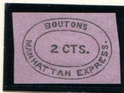
FORGERY B TAYLOR - FORM AB17 2¢ BLACK ON LILAC SC (17L1)