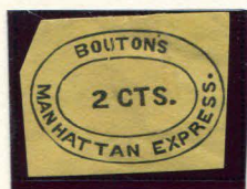
FORGERY B TAYLOR - FORM AB 1 2¢ BLACK ON GOLD YELLOW (17L1)