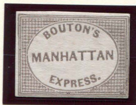
BOGUS 1 TAYLOR VIOLET BROWN ON WHITE