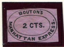
FORGERY A SCOTT 2¢ BLACK ON LAVENDER (17L1)