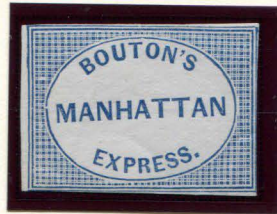
BOGUS 1 TAYLOR BLUE ON WHITE