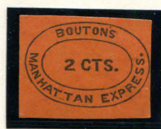
FORGERY B TAYLOR - FORM AB17 2¢ BLACK ON ORANGE SC (17L1)