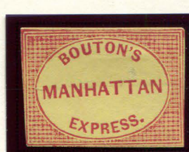
BOGUS 1 TAYLOR - FORM AA13 RED VIOLET ON YELLOW