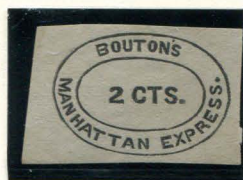
FORGERY B TAYLOR - FORM S1 2¢ BLACK ON GRAY BUFF (17L1)