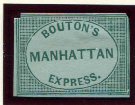
BOGUS 1 TAYLOR - FORM 20 GREEN ON PALE GREEN