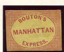
BOGUS 1 TAYLOR - FORM AA13 RED VIOLET ON YELLOW H LAID