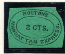
FORGERY B TAYLOR - FORM AB17 2¢ BLACK ON BRIGHT GREEN SC (17L1)