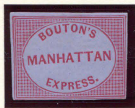
BOGUS 1 TAYLOR - FORM AB5 RED VIOLET ON LAVENDER SC