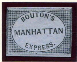
BOGUS 1 TAYLOR - FORM S19) BLACK ON GRAYISH BLUE SC