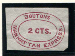
FORGERY B TAYLOR 2¢ RED VIOLET ON WHITE (17L1)