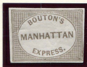
BOGUS 1 TAYLOR BROWN ON WHITE