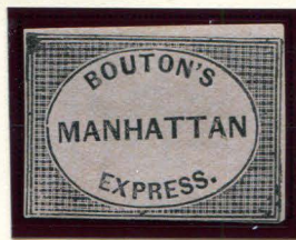
BOGUS 1 TAYLOR - FORM S19 BLACK ON PINKISH GRAY SC