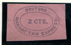
FORGERY B TAYLOR 2¢ GRAY ON PINK (17L1)