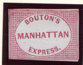
BOGUS 1 TAYLOR - FORM AA13 RED VIOLET ON WHITE