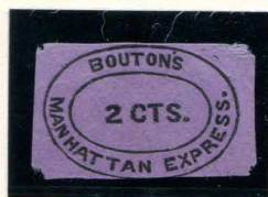
FORGERY B TAYLOR - FORM S1 2¢ BLACK ON VIOLET (17L1)