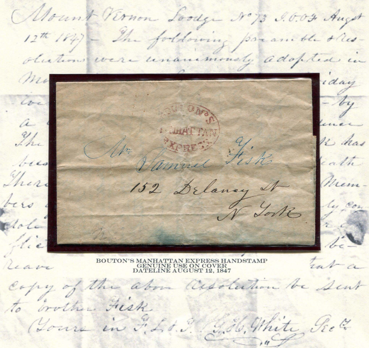
BOUTON'S MANHATTAN EXPRESS HANDSTAMP GENUINE USE ON COVER DATELINE AUGUST 12, 1847

Bouton produced one stamp for this post, a black double oval on pink.