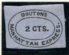
FORGERY B TAYLOR - FORM AB 1 2¢ BLACK ON GRAY (17L1)