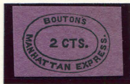
FORGERY A SCOTT 2¢ BLACK ON PURPLE (17L1)