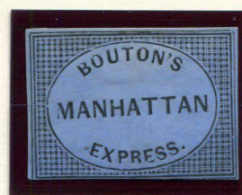
BOGUS 1 TAYLOR BLACK ON LIGHT BLUE SC