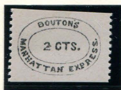
MODERN FORGERY 2¢ BLACK ON GRAYISH PERFORATED (17L1)