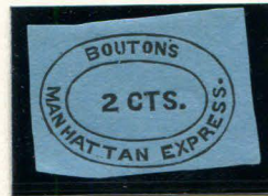
FORGERY B TAYLOR - FORM AB 1 2¢ BLACK ON GREEN (17L1)