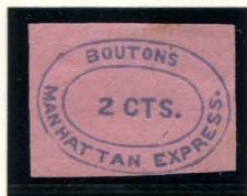
FORGERY B TAYLOR 2¢ GRAY BLUE ON PINK (17L1)