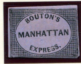
BOGUS 1 TAYLOR - FORM S19 BLACK ON PALE VIOLET SC