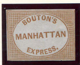
BOGUS 1 TAYLOR - FORM AA18 ORANGE BROWN ON WHITE