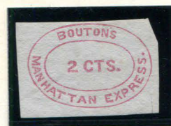
FORGERY B TAYLOR 2¢ PALE RED ON WHITE (17L1)