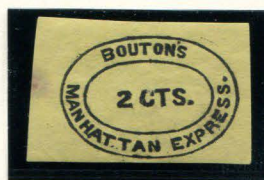
FORGERY B TAYLOR - FORM S1 2¢ BLACK ON YELLOW (17L1)