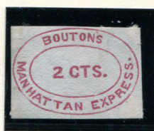
FORGERY B TAYLOR 2¢ RED ON WHITE (17L1)