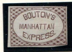
BOGUS 2 TAYLOR - FORM AA12 PURPLE BROWN ON WHITE