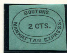
FORGERY B TAYLOR - FORM S1 2¢ BLACK ON BLUISH GREEN (17L1)