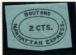
FORGERY B TAYLOR - FORM AB 1 2¢ BLACK ON BLUE (17L1)