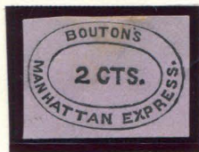
FORGERY A SCOTT 2¢ BLACK ON LILAC (17L1)