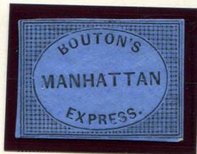
BOGUS 1 TAYLOR BLACK ON BLUE SC