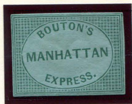
BOGUS 1 TAYLOR - FORM 20 GREEN ON GREENISH