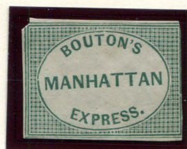
BOGUS 1 TAYLOR - FORM 20 GREEN ON PALE GRAY BROWN