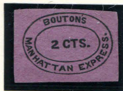
FORGERY B TAYLOR - FORM S1 2¢ BLACK ON PURPLE (17L1)