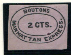
FORGERY B TAYLOR - FORM S1 2¢ BLACK ON PEACH (17L1)