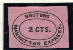
FORGERY B TAYLOR - FORM AB 1 2¢ BLACK ON PINK (17L1)