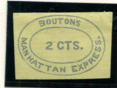
FORGERY B TAYLOR 2¢ GRAY BLUE ON PALE YELLOW H LAID (17L1)