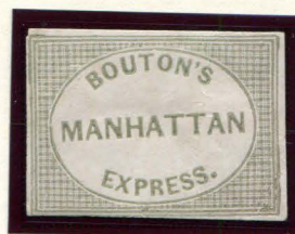
BOGUS 1 TAYLOR GREENISH BROWN ON WHITE