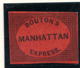
BOGUS 1 TAYLOR - FORM 9 BLACK ON SCARLET SC