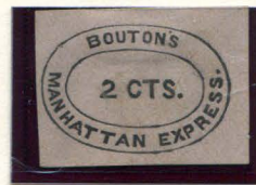
FORGERY A SCOTT 2¢ BLACK ON GRAY BUFF (17L1)