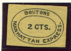
FORGERY B TAYLOR - FORM AB 1 2¢ BLACK ON YELLOW (17L1)

The Taylor stamps can be divided into variations based on the flaws they have. One of the flaws is a break through the top of the inner oval, which extends into the "U" of "BOUTON'S". This flaw appears on the stamps in forms AB 1 and AB 17 . Other possible flaws are an underscore between the "TT" of "MANHATTAN", and a curved line outside the top-right side of the outer border.