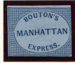
BOGUS 1 TAYLOR BLUE ON PALE BLUE SC