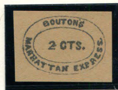
MODERN FORGERY 2¢ BLACK ON TAN (17L1)