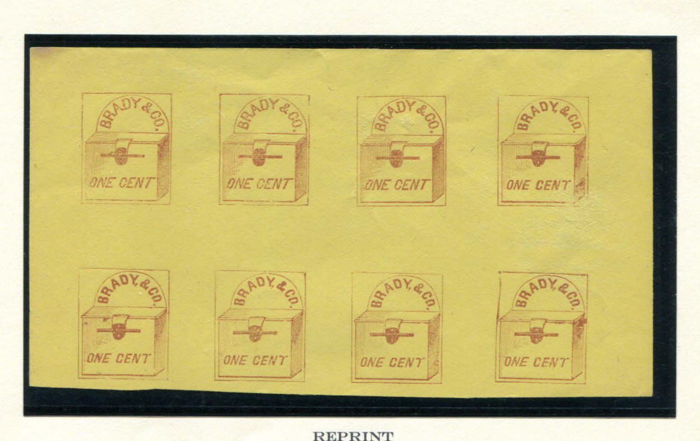
TYPE I: POSITIONS 1, 2, & 3 - TYPE II POSITIONS 4, 5, 6, 7, & 8

Reprints of the stamp were later made by for Hussey by his engraver, Thomas Wood, which can be identified by position.