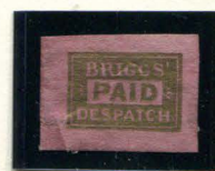
FORGERY A 2¢ GOLD ON DARK PINK (25L4)