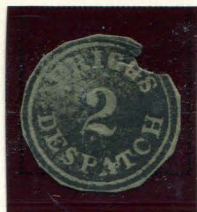
HANDSTAMP GENUINE 2¢ BLACK