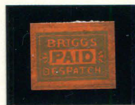
FORGERY C 2¢ GOLD ON VERMILION (25L4)