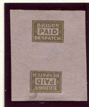
FORGERY A 2¢ GOLD ON LIGHT PINK TÊTE-BÊCHE PAIR (25L4)