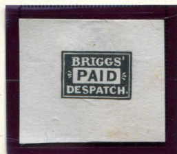
FORGERY A PROOF 2¢ BLACK ON INDIA PAPER (25L4)

The small Brigg's stamps appear to have been modeled on Blood's small stamps (15L12-15L17).