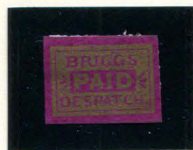
FORGERY C 2¢ GOLD ON PURPLE (25L4)