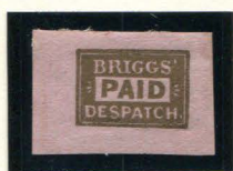
FORGERY A 2¢ GOLD ON LIGHT PINK (25L4)