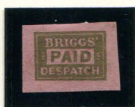
FORGERY A 2¢ GOLD ON PINK (25L4)