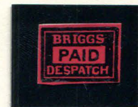
FORGERY F MODERN 2¢ BLACK ON RED (25L4)