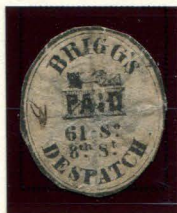
25L1 GENUINE 2¢ BLACK ON BUFF PSE CERT #25683