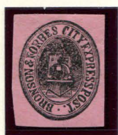
FORGERY B TAYLOR - FORM AB2 BLACK ON PINK (27L1)