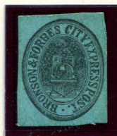
FORGERY B TAYLOR - FORM AA7 BLACK ON TEAL SC (27L1)