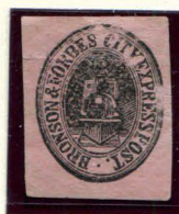
FORGERY B TAYLOR - FORM AB2 BLACK ON PALE PINK (27L1)