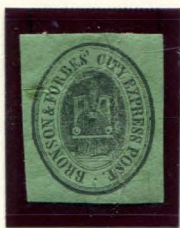
27L1 GENUINE BLACK ON GREEN