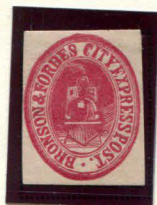
FORGERY B TAYLOR - FORM S17 RED VIOLET ON CREAM (27L1)