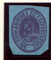
FORGERY B TAYLOR - FORM 21 VIOLET ON BLUE (27L1)