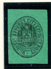
FORGERY A SCOTT BLACK ON GREEN SC (27L1)