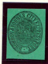
FORGERY B TAYLOR - FORM 19 BLACK ON GREEN SC (27L1)