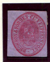
FORGERY B TAYLOR - FORM S17 RED VIOLET ON LIGHT VIOLET (27L1)