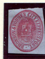
FORGERY B TAYLOR - FORM S17 RED VIOLET ON BLUE GRAY (27L1)