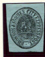
FORGERY B TAYLOR - FORM AB2 BLACK ON GREENISH (27L1)