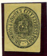
FORGERY B TAYLOR - FORM AB2 BLACK ON YELLOW (27L1)