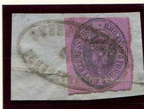
FORGERY C BLACK ON PINK VIOLET SC ON PIECE WITH FAKE HANDSTAMP (27L1)