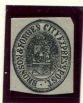
FORGERY B TAYLOR BLACK ON GRAY (27L1)