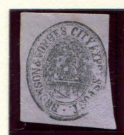
FORGERY B TAYLOR - FORM AB2 BLACK ON LILAC (27L1)