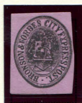
FORGERY B TAYLOR - FORM AB13 BLACK ON PINK VIOLET SC (27L1)