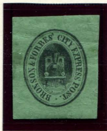
27L1 GENUINE BLACK ON GREEN