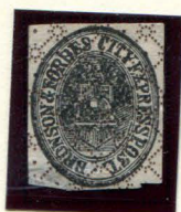
FORGERY B TAYLOR - FORM AA5 BLACK ON WHITE W/ BROWN QUILTED PATTERN OVERPRINT (27L1)