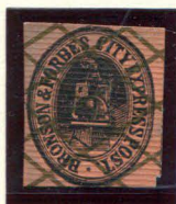
FORGERY B TAYLOR - FORM AA5 BLACK ON SALMON SC H RIBBED W/ GOLD DIAMOND GRID OVERPRINT (27L1)