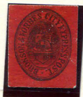
FORGERY B TAYLOR - FORM 13 BLACK ON SCARLET SC (27L1)