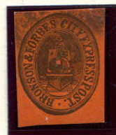
FORGERY B TAYLOR - FORM AA7 BLACK ON VERMILION SC (27L1)