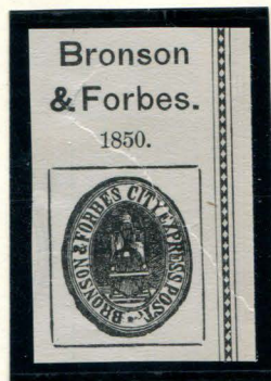
FORGERY A SCOTT - ALBUM CUT (1888) BLACK ON WHITE (27L1)