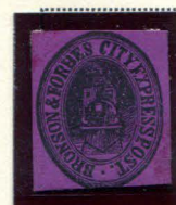
FORGERY B TAYLOR - FORM AA5 BLACK ON PURPLE SC (27L1)