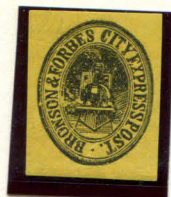
FORGERY B TAYLOR - FORM 13 BLACK ON YELLOW SC (27L1)