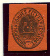
FORGERY B TAYLOR BLACK ON VERMILION SC (BUFF BACK) (27L1)

It is unknown who made the following forgery, which sometimes appear on envelopes or letters, tied with fake handstamps.