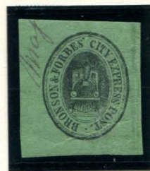
27L1 GENUINE BLACK ON GREEN WITH MS DOCKETING PF CERT #536832