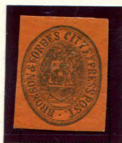
FORGERY B TAYLOR - FORM AB13 BLACK ON DULL ORANGE SC (27L1)