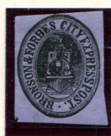
FORGERY B TAYLOR - FORM AA5 BLACK ON LAVENDER SC (27L1)