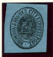
FORGERY B TAYLOR - FORM AB2 BLACK ON BLUE (27L1)