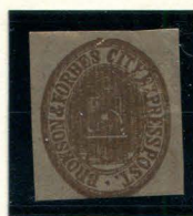
FORGERY B TAYLOR - FORM 7 BROWN ON GRAY BROWN SC (27L1)