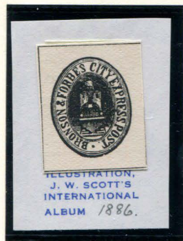
FORGERY A SCOTT - ALBUM CUT (1886) BLACK ON WHITE (27L1)