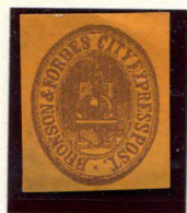
FORGERY B TAYLOR - FORM 7 BROWN ON ORANGE SC (27L1)