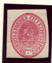
FORGERY B TAYLOR - FORM S17 LIGHT RED VIOLET ON CREAM (27L1)