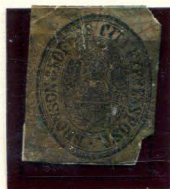
FORGERY B TAYLOR - FORM AA7 BLACK ON BRONZE SC (27L1)