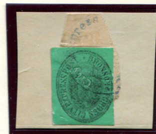
FORGERY C BLACK ON GREEN SC ON PIECE WITH FAKE HANDSTAMP (27L1)