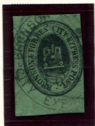
27L1 GENUINE BLACK ON GREEN WITH HANDSTAMP

The example at left is cancelled with a "Bronson & Forbes' City Express" handstamp. It is one of only three or four examples of this stamp with a cancellation, as most covers were mailed uncanceled.