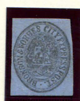
FORGERY B TAYLOR - FORM AB13 BLACK ON PALE BLUE SC (27L1)