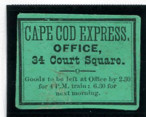
CODX-L3 BLACK ON GREEN SC