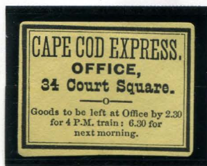
CODX-L3 BLACK ON YELLOW SC