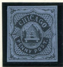
FORGERY D TAYLOR - FORM 15 1¢ BLACK ON VIOLET BLUE (38L1)