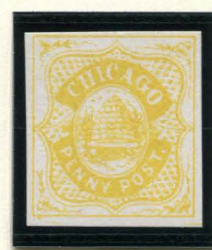
FORGERY A MOENS 1¢ BRIGHT YELLOW ON WHITE (38L1)