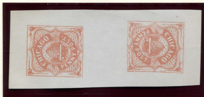
FORGERY C 1¢ PINKISH ORANGE ON WHITE TÊTE-BÊCHE PAIR (38L1)