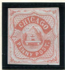
FORGERY D TAYLOR - FORM AA11 1¢ RED ORANGE ON WHITE (38L1)