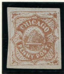
38L1 GENUINE 1¢ ORANGE BROWN ON WHITE POSITION 10