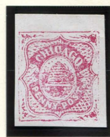
REPRINT MODERN 1¢ PINK ON WHITE ( 38L1 )