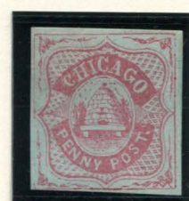
FORGERY D TAYLOR 1c PINK ON LIGHT BLUE GREEN (38L1)