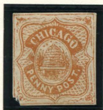
REPRINT HUSSEY 1¢ ORANGE ON BUFF (38L1)