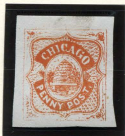
REPRINT HUSSEY 1¢ ORANGE RED ON WHITE (38L1)

This post's stamp was reprinted by George Hussey. According to the records of Thomas Wood, Hussey's engraver, seven thousand "Chicago Penny Post" reprints were produced by June, 1866. These reprints come in many shades, in attempts to get close to the orange-brown color of the original.