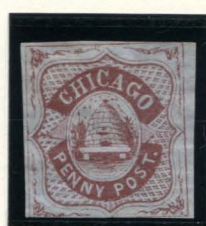
FORGERY D TAYLOR 1c RED BROWN ON GRAY BLUE H LAID (38L1)