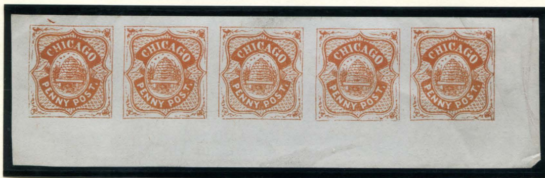
REPRINT HUSSEY 1¢ ORANGE BROWN ( SHADE ) ON WHITE STRIP OF FIVE ( 38L1 )