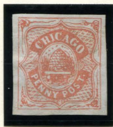
FORGERY C 1¢ ORANGE ON WHITE (38L1)