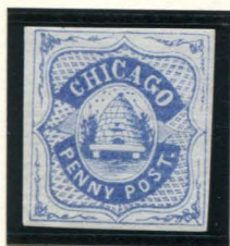
FORGERY D TAYLOR - FORM 15 1¢ ULTRAMARINE ON WHITE H LAID (38L1)