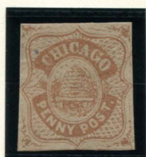
REPRINT HUSSEY 1¢ BROWN ORANGE ON BUFF (38L1)