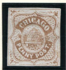
REPRINT HUSSEY 1¢ BROWN ON WHITE (38L1)