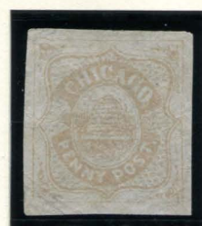
REPRINT HUSSEY 1¢ BROWN GRAY ON WHITE (38L1)