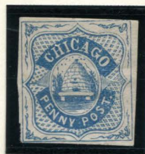
FORGERY D TAYLOR 1¢ DARK BLUE ON WHITE (38L1)