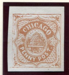
REPRINT HUSSEY 1¢ BROWN ORANGE ON BUFF (38L1)