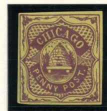
FORGERY D TAYLOR - FORM 6 1¢ PURPLE ON YELLOW (38L1)