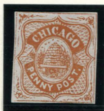
REPRINT HUSSEY 1¢ RED ORANGE ON WHITE (38L1)