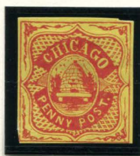
FORGERY D TAYLOR - FORM 5 1¢ RED ON YELLOW SC (38L1)