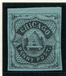
FORGERY D TAYLOR - FORM 15 1¢ BLACK ON GRAY GREEN (38L1)