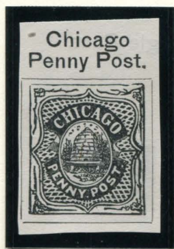
FORGERY B SCOTT - ALBUM CUT 1¢ BLACK ON WHITE (38L1)