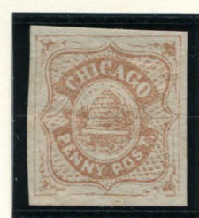
REPRINT HUSSEY 1¢ BROWN ORANGE ON OFF-WHITE (38L1)