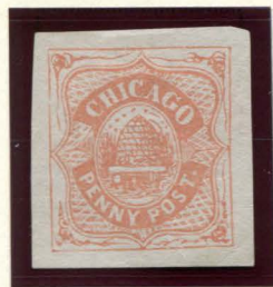
FORGERY C 1¢ PINKISH ORANGE ON WHITE (38L1)