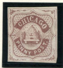
FORGERY D TAYLOR - FORM S16 1¢ ORANGE BROWN ON WHITE (38L1)