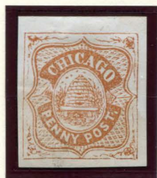
REPRINT HUSSEY 1¢ YELLOW ORANGE ON WHITE (38L1)