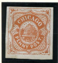
REPRINT HUSSEY 1¢ ORANGE ON WHITE (38L1)