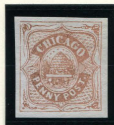
FORGERY C 1¢ ORANGE BROWN ON WHITE (38L1)