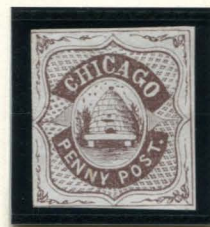
FORGERY D TAYLOR - FORM AA11 1¢ CHOCOLATE ON WHITE (38L1)