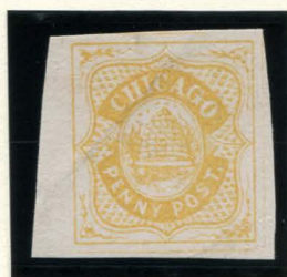
FORGERY A MOENS 1¢ ORANGE YELLOW ON WHITE (38L1)