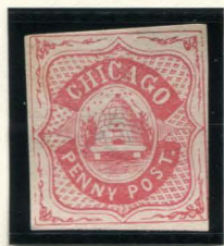
FORGERY D TAYLOR 1c PINK ON WHITE (38L1)