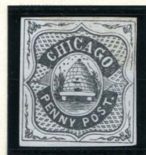
FORGERY D TAYLOR - FORM 15 1¢ BLACK ON WHITE V LAID (38L1)