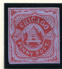
FORGERY D TAYLOR - FORM 5 1¢ RED ON GRAY VIOLET SC (38L1)