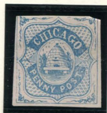
FORGERY D TAYLOR 1¢ LIGHT BLUE ON PINKISH (38L1)