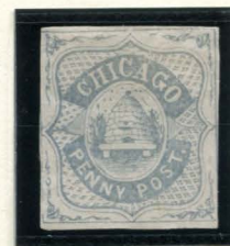
FORGERY D TAYLOR 1¢ GRAY BLUE ON WHITE (38L1)