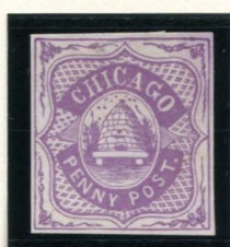
FORGERY D TAYLOR 1c VIOLET ON WHITE (38L1)