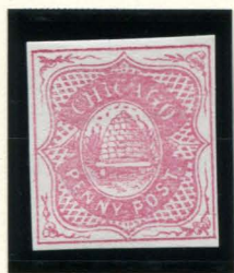
FORGERY A MOENS 1¢ PINK ON WHITE (38L1)

All the forgeries can be told apart by the bees above the beehive. They all have different amounts and positions than the original stamps. The corner ornaments vary greatly as well amongst the forgeries.