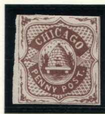
FORGERY D TAYLOR - FORM S16 1¢ VIOLET BROWN ON WHITE (38L1)