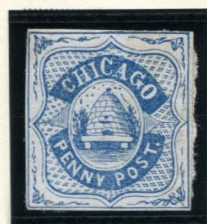
FORGERY D TAYLOR 1¢ BLUE ON WHITE (38L1)