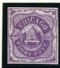
FORGERY D TAYLOR - FORM 6 1¢ PURPLE ON WHITE (38L1)