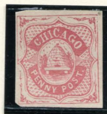
FORGERY D TAYLOR 1c LIGHT PINK ON WHITE (38L1)