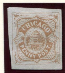
REPRINT HUSSEY 1¢ ORANGE BROWN ON WHITE (38L1)