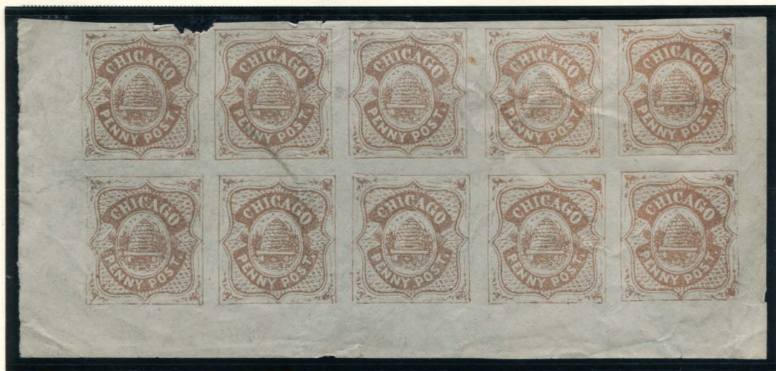
REPRINT HUSSEY 1¢ ORANGE BROWN ( SHADE ) ON WHITE BLOCK OF TEN ( 38L1 )