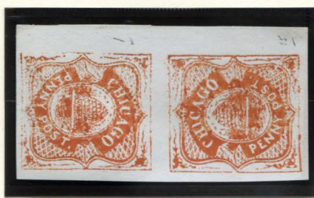
REPRINT MODERN 1¢ RED ORANGE ON WHITE TÊTE-BÊCHE ( 38L1 )