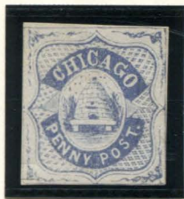
FORGERY D TAYLOR 1¢ BLUE VIOLET ON WHITE (38L1)