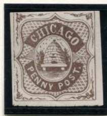
FORGERY D TAYLOR - FORM AA11 1¢ BROWN ON WHITE (38L1)