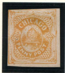
FORGERY B SCOTT 1¢ YELLOW ORANGE ON WHITE (38L1)