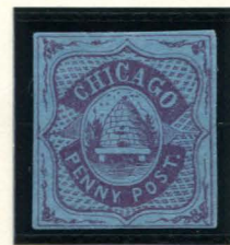
FORGERY D TAYLOR - FORM 21 1¢ VIOLET ON BLUE (38L1)