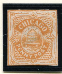
FORGERY B SCOTT 1¢ ORANGE ON WHITE (38L1)