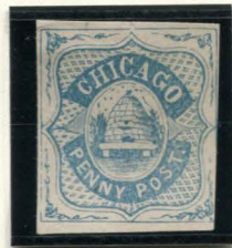
FORGERY D TAYLOR 1¢ GREENISH BLUE ON WHITE (38L1)