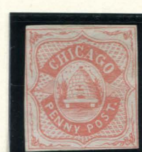
FORGERY D TAYLOR 1¢ PINKISH ORANGE ON WHITE (38L1)