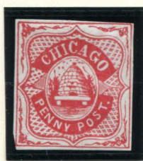
FORGERY D TAYLOR - FORM 5 1¢ RED ON WHITE (38L1)