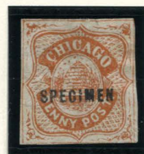
REPRINT HUSSEY 1¢ RED ORANGE ON WHITE "SPECIMEN" OVERPRINT (38L1)