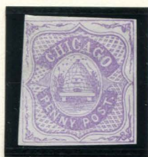
FORGERY D TAYLOR 1c LIGHT VIOLET ON WHITE (38L1)