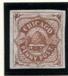
FORGERY C 1¢ BROWN ON WHITE (38L1)