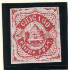
FORGERY D TAYLOR 1c RED ON WHITE V LAID (38L1)