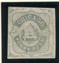
FORGERY D TAYLOR 1¢ GRAY GREEN ON WHITE (38L1)