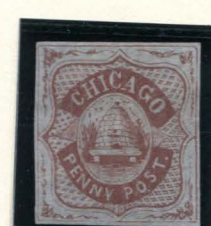
FORGERY D TAYLOR 1c RED BROWN ON GRAY BLUE V LAID (38L1)