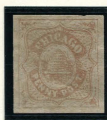
REPRINT HUSSEY 1¢ ORANGE BROWN ON BUFF (38L1)