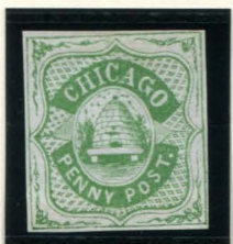
FORGERY D TAYLOR 1¢ GREEN ON WHITE (38L1)