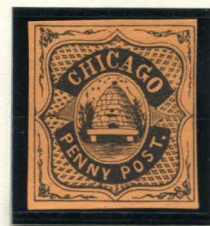
FORGERY D TAYLOR - FORM 15 1¢ BLACK ON ORANGE BUFF (38L1)