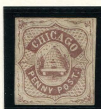
FORGERY D TAYLOR 1¢ ORANGE BROWN ON CREAM (38L1)