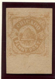
REPRINT MODERN 1¢ BROWN ON BUFF ( 38L1 )