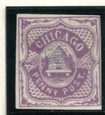
FORGERY D TAYLOR 1c DARK VIOLET ON WHITE (38L1)