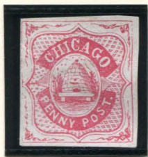
FORGERY D TAYLOR 1c HOT PINK ON WHITE (38L1)