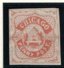
FORGERY D TAYLOR 1¢ ORANGE ON WHITE (38L1)