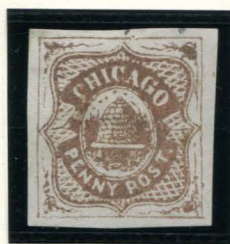
REPRINT HUSSEY 1¢ BISTRE BROWN ON WHITE (38L1)