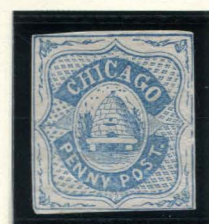
FORGERY D TAYLOR 1¢ LIGHT BLUE ON WHITE (38L1)