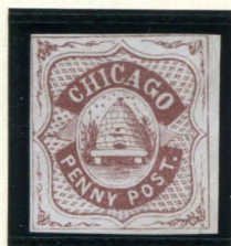
FORGERY D TAYLOR 1¢ RED BROWN ON WHITE (38L1)