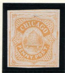
FORGERY B SCOTT 1¢ LIGHT ORANGE ON WHITE (38L1)