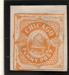
FORGERY B SCOTT 1¢ RED ORANGE ON WHITE (38L1)