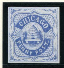
FORGERY D TAYLOR - FORM 15 1¢ ULTRAMARINE ON WHITE V LAID (38L1)