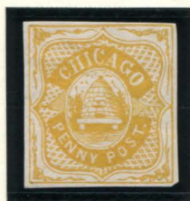
FORGERY D TAYLOR - FORM 6 1¢ YELLOW ON WHITE (38L1)