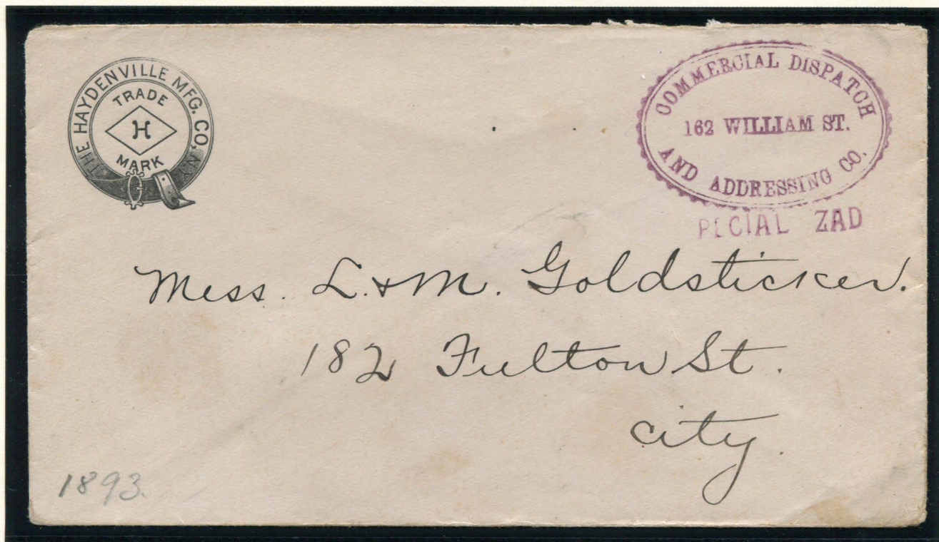
COMMERCIAL DISPATCH HANDSTAMP - PURPLE COGWHEEL "COMMERCIAL DISPATCH / 162 WILLIAM ST. / AND ADDRESSING CO." WITH "SPECIAL ZAD" HANDSTAMP

The Commercial Dispatch & Addressing Co. handstamp addressed for 162 William St. is known on covers in purple or red ink. An additional handstamp, reading "SPECIAL" and followed by a series of three letters, was also used.