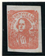
FORGERY B SCOTT 1¢ ORANGE RED ON WHITE (52L2)