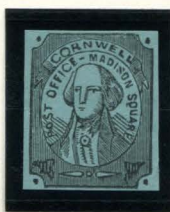
FORGERY C TAYLOR - FORM 4 1¢ BLACK ON GRAY GREEN (52L1)