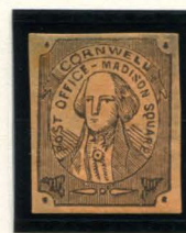
FORGERY C TAYLOR - FORM 4 1¢ BLACK ON ORANGE BUFF (52L1)