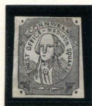
FORGERY C TAYLOR - FORM 4 1¢ BLACKISH BROWN ON WHITE V LAID (52L2)