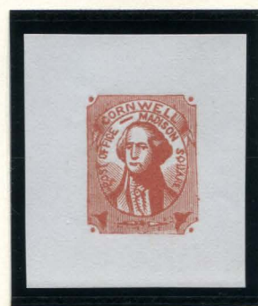
FORGERY A HUSSEY / WOOD 1¢ RED ON WHITE (52L2)