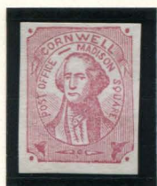
FORGERY A HUSSEY / WOOD 1¢ ROSE ON WHITE (52L2)

At least two different settings were used to print these stamps. The "rose" printings are known in blocks of ten, and in tête-bêche pairs. The "red" printing is known in strips of three with much larger margins between the stamps. This was probably the later setting, as various flaws appeared, creating identifiable position variations.