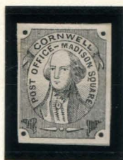
FORGERY E DERAEDEMAEKER / MOENS 1¢ BLACK ON WHITE (52L2)