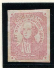
FORGERY E DERAEDEMAEKER / MOENS 1¢ ROSE ON WHITE (52L2)