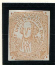
FORGERY C TAYLOR 1¢ YELLOW ORANGE ON WHITE (52L2)