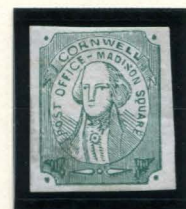
FORGERY C TAYLOR - FORM 4 1¢ GREEN ON WHITE H LAID (52L2)