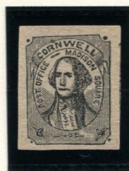
FORGERY B SCOTT - ALBUM CUT 1¢ BLACK ON CREAM (52L2)