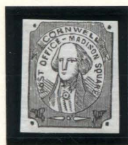
FORGERY C TAYLOR - FORM 4 1¢ BLACKISH BROWN ON WHITE H LAID (52L2)