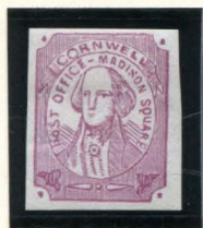
FORGERY C TAYLOR - FORM 4 1¢ PALE PURPLE ON WHITE (52L2)