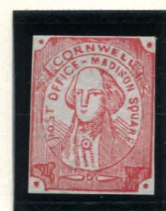
FORGERY C TAYLOR - FORM 12 1¢ RED ON WHITE (52L2)