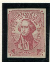
FORGERY A HUSSEY / WOOD 1¢ ROSE ON CREAM (52L2)