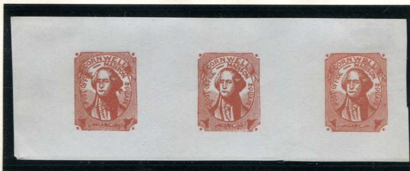
FORGERY A - A2 - A1 HUSSEY / WOOD 1¢ RED ON WHITE STRIP OF THREE (52L2)