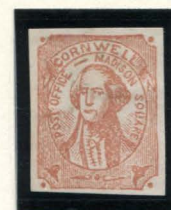
FORGERY A HUSSEY / WOOD 1¢ PALE RED ON CREAM (52L2)