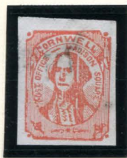
FORGERY B SCOTT 1¢ RED ON WHITE (52L2)