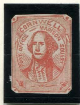
FORGERY B SCOTT 1¢ RED (SHADE) ON CREAM (52L2)