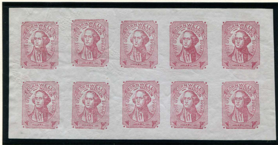
FORGERY A HUSSEY / WOOD 1¢ ROSE ON WHITE BLOCK OF TEN (52L2)