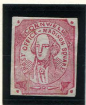
FORGERY C TAYLOR 1¢ VIOLET RED ON WHITE (52L2)