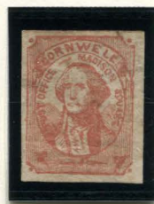
52L2 GENUINE 1¢ BROWNISH RED ON WHITE PF# 545961