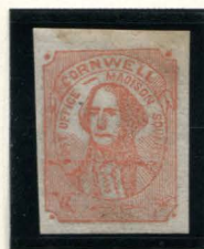
FORGERY B SCOTT 1¢ RED (SHADE) ON CREAM (52L2)