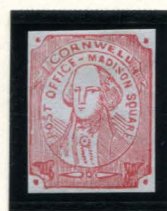
FORGERY C TAYLOR - FORM 12 1¢ RED ON GRAY (52L1)