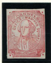
FORGERY C TAYLOR 1¢ RED ON WHITE (52L2)