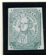
FORGERY C TAYLOR - FORM 4 1¢ GREEN ON WHITE (52L2)