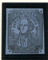
FORGERY C TAYLOR - FORM 4 1¢ BLACK ON VIOLET BLUE (52L1)

Both designs depict Washington with a small mouth, and his forehead has no shading lines at all. The main difference between the two designs are the corner circles, which are irregularly shaped in Taylor's stamps, while fully round in the other forgery.