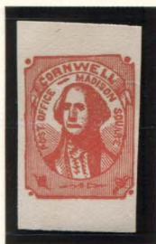
FORGERY B SCOTT 1¢ DEEP RED ON CREAM (52L2)