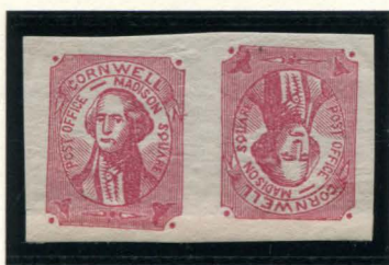
FORGERY A HUSSEY / WOOD 1¢ ROSE ON CREAM TÊTE-BÊCHE PAIR (52L2)