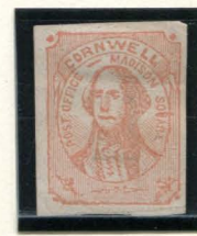
FORGERY B SCOTT 1¢ PALE RED ON CREAM (52L2)