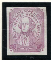
FORGERY C TAYLOR - FORM 4 1¢ PALE PURPLE ON WHITE H LAID (52L2)