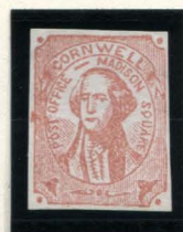
FORGERY A HUSSEY / WOOD 1¢ PALE RED ON WHITE (52L2)