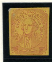
FORGERY C TAYLOR 1¢ RED ON YELLOW SC (52L2)