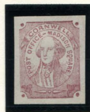
FORGERY E DERAEDEMAEKER / MOENS 1¢ VIOLET ON WHITE (52L2)