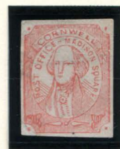
FORGERY C TAYLOR 1¢ ROSE RED ON WHITE (52L2)