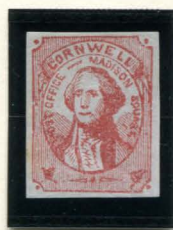
52L1 GENUINE 1¢ RED ON BLUISH PF# 536834

The post issued two stamps of the same design. The first was printed in red ink on a bluish paper. The second was printed in red-brown shades of ink on white paper.