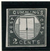
TYPE I FORGERY B TAYLOR - FORM AB18 2¢ BLACK ON WHITE (55L1 - L3)