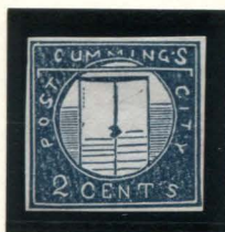
TYPE I FORGERY C TAYLOR - FORM AA15 2¢ DARK NAVY BLUE ON WHITE (55L1 - L3)