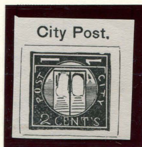
TYPE IV FORGERY G SCOTT - ALBUM CUT 2¢ BLACK ON CREAM (55L8)

No forgeries are known of the "Type II" and "Type III" stamps, which weren't illustrated in any catalogue until the early 1900's. Scott did have an illustrated stamp for a "City Post" in his catalogues, which appears to be the "Type IV" stamp for "Cumming's City Post".