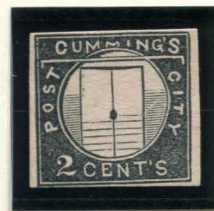
TYPE I FORGERY B TAYLOR - FORM AB14 2¢ BLACK ON CREAM (55L1 - L3)