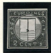
TYPE I FORGERY C TAYLOR 2¢ BLACK ON WHITE (55L1 - L3)

The next forgery was made with the engraving used for the "Type 1" illustration in C. H. Coster's 1882 edition of The United States Locals and Their History , which was published by J.-B. Moens. The same illustration was used by Moens the year after for his own catalogue.