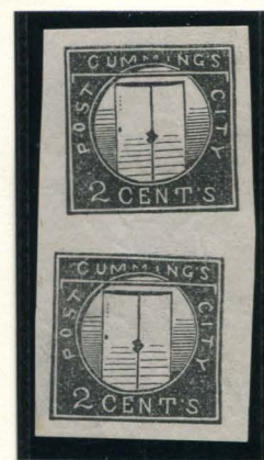
TYPE I FORGERY A SCOTT 2¢ BLACK ON WHITE VERTICAL PAIR (55L1)