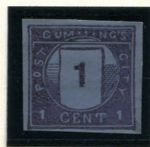
FORGERY F STIRLING 2¢ BLUE ON GRAY BLUE SC