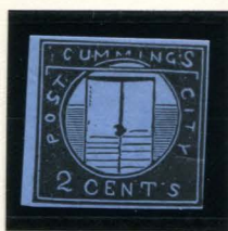
TYPE I FORGERY C TAYLOR - FORM 3 2¢ BLACK ON LIGHT BLUE SC (55L1 - L3)