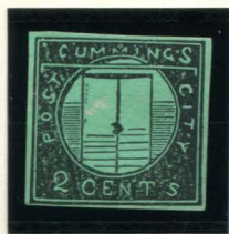
TYPE I FORGERY C TAYLOR - FORM AA24 2¢ BLACK ON GREEN SC (55L1 - L3)