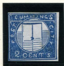
TYPE I FORGERY C TAYLOR - FORM AA15 2¢ BLUE ON WHITE (55L1 - L3)