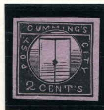
TYPE I FORGERY E SCOTT 2¢ BLACK ON PINK VIOLET (55L1)