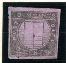
TYPE I FORGERY B TAYLOR - FORM BB8 2¢ BLACK ON LILAC SC (55L1 - L3)