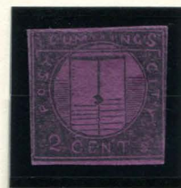
TYPE I FORGERY C TAYLOR - FORM AA21 2¢ BLACK ON PURPLE (55L1 - L3)