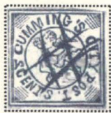
PHOTOCOPY EXAMPLE OF 55L5 FROM SIEGEL AUCTION SALE 817 LOT 1011

The third design is a simple oval design with the numeral "2" in a diamond at the center. It is known in black on vermillion.