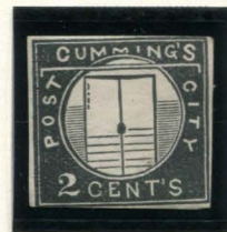
TYPE I FORGERY B TAYLOR - FORM AB18 2¢ BLACK ON OFF-WHITE (55L1 - L3)