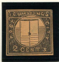
TYPE I FORGERY C TAYLOR - FORM AA21 2¢ BLACK ON PALE ORANGE (55L1 - L3)