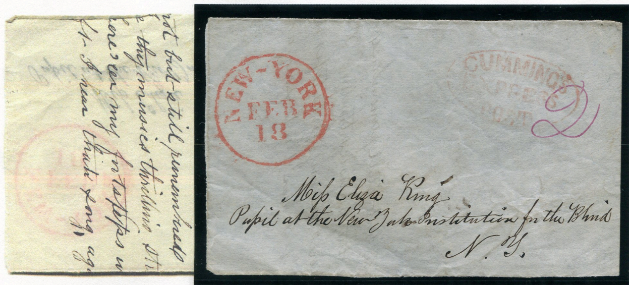
CUMMING'S EXPRESS POST RED OVAL HANDSTAMP ON PARTIAL COVER WITH MANUSCRIPT "2" RED NEW-YORK CDS - FEBRUARY 18 PHOTOCOPY OF REVERSE

The cover below was carried by Cumming's, marked with the red oval handstamp and a red manuscript "2".