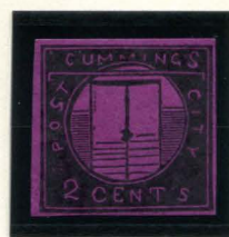
TYPE I FORGERY C TAYLOR - FORM 3 2¢ BLACK ON MAGENTA SC (55L1 - L3)