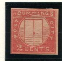
TYPE I FORGERY B TAYLOR 2¢ RED ON PEACH (55L1 - L3)