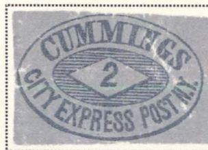
PHOTOCOPY EXAMPLE OF 55L7 FROM SIEGEL AUCTION SALE 830 LOT 600

A fourth design is listed, described as the same image as the first stamps, but with the name "Cumming's" erased. This stamp is believed to be unique and even photographs of the design are difficult to find.