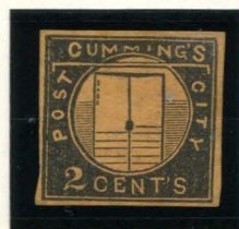
TYPE I FORGERY B TAYLOR - FORM AB18 2¢ BLACK ON LIGHT ORANGE (55L1 - L3)