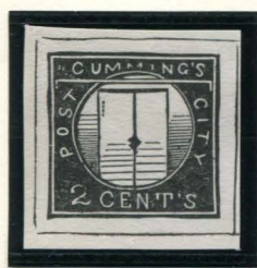
TYPE I FORGERY E SCOTT - ALBUM CUT 2¢ BLACK ON CREAM (55L1)

Of the "Type I" stamps, there are two very similar forgeries that are attributed to J. W. Scott. The first one is identical to the illustration in his catalogues. Two quick identifiers are in "CUMMING'S": The right leg of the "N" is shorter than the left, and the top curve of the "S" is bigger than the bottom curve.