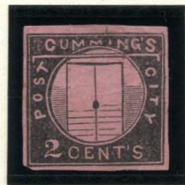
TYPE I FORGERY B TAYLOR - FORM AB14 2¢ BLACK ON PINK (55L1 - L3)