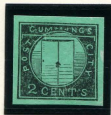
TYPE I FORGERY A SCOTT 2¢ BLACK ON LIGHT GREEN SC (55L2)