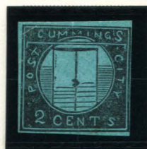
TYPE I FORGERY C TAYLOR 2¢ BLACK ON TEAL SC (55L1 - L3)