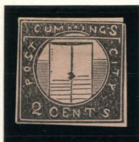
TYPE I FORGERY C TAYLOR - FORM AA20 2¢ BLACK ON PEACH (55L1 - L3)