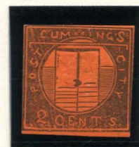
TYPE I FORGERY C TAYLOR - FORM 19 2¢ BLACK ON VERMILION SC (55L1 - L3)