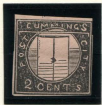
TYPE I FORGERY C TAYLOR - FORM AA21 2¢ BLACK ON PEACH (55L1 - L3)