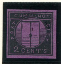
TYPE I FORGERY E SCOTT 2¢ BLACK ON VIOLET (55L1)