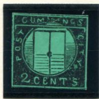
TYPE I FORGERY D MOENS 2¢ BLACK ON GREEN SC (55L2)

On this design the heart-shaped wax seal on the letter has a more rounded point, and the heart is mirrored, with the point towards the left.