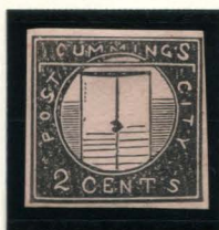
TYPE I FORGERY C TAYLOR - FORM AA20 2¢ BLACK ON PEACH V LAID (55L1 - L3)