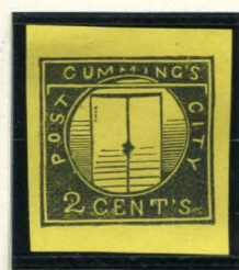
TYPE I FORGERY E SCOTT 2¢ BLACK ON YELLOW SC (55L3)