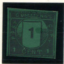
FORGERY F STIRLING 2¢ BLACK ON DARK GREEN SC

The next stamps are of a modern bogus design, attributed to David M. Stirling. On them, the value has been changed to 1 cent, and the letter is completely empty except for a large 1 in the center.