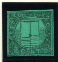
TYPE I FORGERY C TAYLOR - FORM 19 2¢ BLACK ON GREEN SC (55L1 - L3)