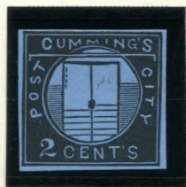
TYPE I FORGERY B TAYLOR - FORM B2 2¢ BLACK ON LIGHT BLUE SC (55L1 - L3)