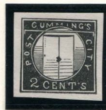
TYPE I FORGERY A SCOTT 2¢ BLACK ON WHITE (55L1)