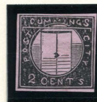
TYPE I FORGERY C TAYLOR - FORM AA20 2¢ BLACK ON PALE PINK V LAID (55L1 - L3)