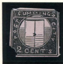
TYPE I FORGERY C TAYLOR - FORM AA20 2¢ BLACK ON PINKISH (55L1 - L3)