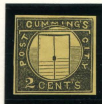
TYPE I FORGERY B TAYLOR 2¢ BLACK ON YELLOW (55L1 - L3)