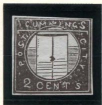
TYPE I FORGERY C TAYLOR - FORM 14 2¢ BLACKISH BROWN ON WHITE (55L1 - L3)