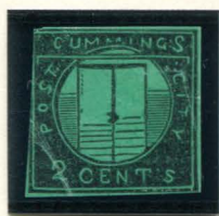
TYPE I FORGERY C TAYLOR - FORM 3 2¢ BLACK ON BRIGHT GREEN SC (55L1 - L3)

Taylor's other forgery has a very large "S" in "CUMMING'S", and there are six lines on each side of the letter. This design also has an extra dot on the left side of the letter, near the middle of the outline.