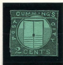
TYPE I FORGERY B TAYLOR - FORM AB18 2¢ BLACK ON GREEN SC (55L1 - L3)