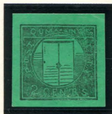
TYPE I FORGERY A SCOTT 2¢ BLACK ON GREEN SC (55L2)

This other forgery copies the design, but adds a large dot on the left side of the letter. There are a few other minor differences, such as the loop of the "P" in "POST" being more rectangular.