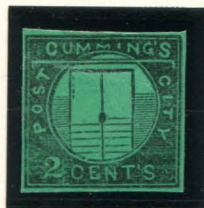
TYPE I FORGERY B TAYLOR - FORM BB8 2¢ BLACK ON BRIGHT GREEN SC (55L1 - L3)