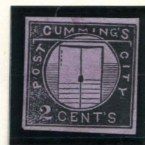
TYPE I FORGERY B TAYLOR - FORM BB5 2¢ BLACK ON LIGHT VIOLET SC (55L1 - L3)