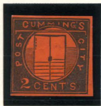
TYPE I FORGERY B TAYLOR - FORM B2 2¢ BLACK ON RED ORANGE SC (55L1 - L3)

S. A. Taylor made two forgeries of the "Type I" stamps. The first one of his two designs is easy to recognize, as it has a very thick loop on the "2". There are also only five lines on the left side of the letter.