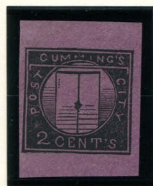
TYPE I FORGERY E SCOTT 2¢ BLACK ON DULL VIOLET (55L1)