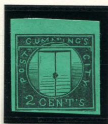
TYPE I FORGERY E SCOTT 2¢ BLACK ON GREEN SC (55L2)