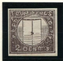
TYPE I FORGERY C TAYLOR - FORM 14 2¢ BROWN ON CREAM V LAID (55L1 - L3)