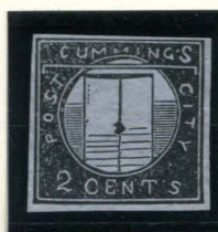
TYPE I FORGERY C TAYLOR - FORM AA20 2¢ BLACK ON BLUE GRAY (55L1 - L3)