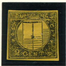
TYPE I FORGERY C TAYLOR - FORM AA24 2¢ BLACK ON GOLD YELLOW SC (55L1 - L3)