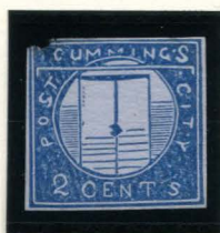
TYPE I FORGERY C TAYLOR - FORM AA15 2¢ BLUE ON BLUISH (55L1 - L3)