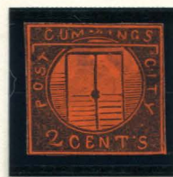
TYPE I FORGERY D MOENS 2¢ BLACK ON VERMILION SC (55L3)