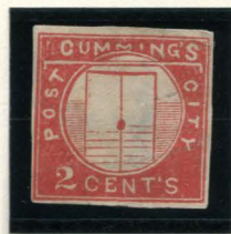
TYPE I FORGERY B TAYLOR - FORM AB14 2¢ RED ON CREAM (55L1 - L3)