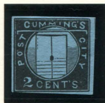
TYPE I FORGERY B TAYLOR - FORM AB18 2¢ BLACK ON LIGHT BLUE (55L1 - L3)