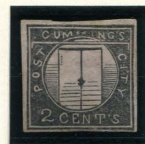
TYPE I FORGERY E SCOTT 2¢ BLACK ON GRAY BROWN (55L1)

This other forgery copies the design, but adds a large dot on the left side of the letter. There are a few other minor differences, such as the loop of the "P" in "POST" being more rectangular.