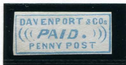
BOGUS 1¢ BLUE (SHADE) ON WHITE