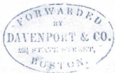
EXAMPLE DAVENPORT & CO. HANDSTAMP (FROM 1845 COVER)