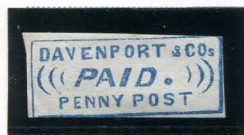
BOGUS 1¢ BLUE (SHADE) ON WHITE