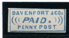
BOGUS 1¢ BLUE (SHADE) ON WHITE