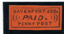
BOGUS 1¢ BLACK ON ORANGE SC