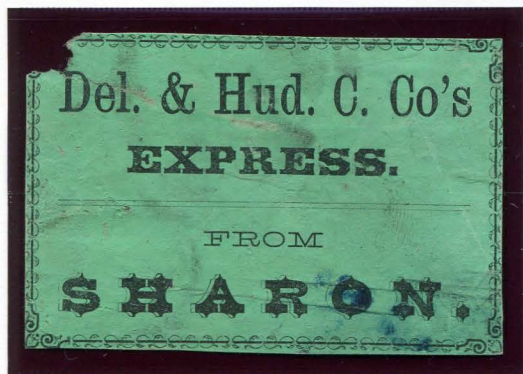
DHCX-L5 BLACK ON GREEN IMPERFORATE SHARON