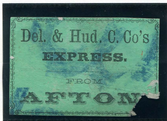
DHCX-L5 BLACK ON GREEN IMPERFORATE AFTON