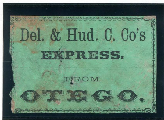
DHCX-L5 BLACK ON GREEN IMPERFORATE OTEGO