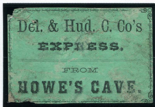
DHCX-L6A BLACK ON GREEN IMPERFORATE HOWE'S CAVE