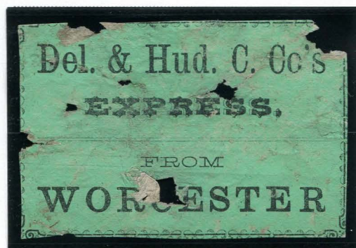
DHCX-L6A BLACK ON GREEN IMPERFORATE WORCESTER