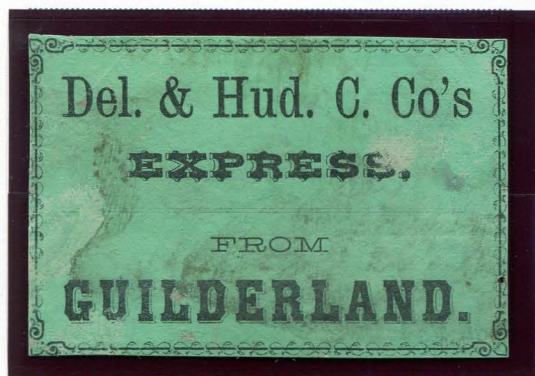
DHCX-L6A BLACK ON GREEN IMPERFORATE GUILDERLAND