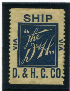
UNLISTED BLUE ON YELLOW V. PERF 12

The label below is unlisted. It's design features a central square reading "the D&H" in the same style as the Delaware & Hudson Railway company's logo, and is printed in the logo's colors.