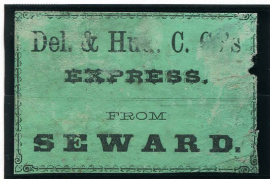
DHCX-L6A BLACK ON GREEN IMPERFORATE SEWARD