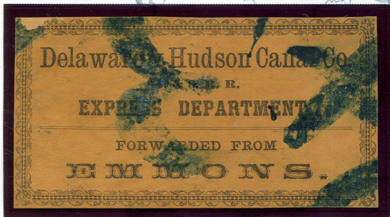
DHCX-L1 - DELAWARE & HUDSON CANAL CO. LABEL DARK BROWN ON GOLD - EMMONS

MAP OF THE DELAWARE AND HUDSON CANAL COMPANY'S RAILROADS PUBLISHED 1886