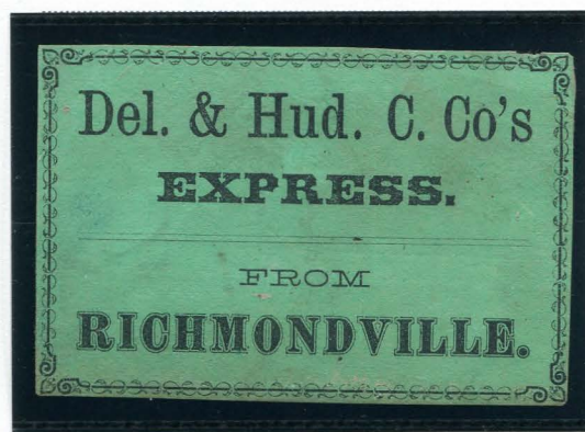
DHCX-L5 BLACK ON GREEN IMPERFORATE RICHMONDVILLE