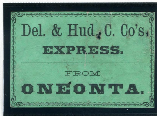
DHCX-L5 BLACK ON GREEN IMPERFORATE ONEONTA