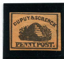
FORGERY C TAYLOR - FORM 4 1¢ BLACKISH BROWN ON BRIGHT ORANGE (60L1)