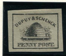
FORGERY B (MODERN?) HUSSEY 1c BLACK ON BROWNISH SC (60L2)