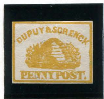
FORGERY C TAYLOR - FORM 8 1¢ YELLOW ON WHITE WOVE (60L1)