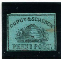
FORGERY E TAYLOR - FORM S13 1c BLACK ON TEAL SC (60L1)