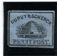
FORGERY E TAYLOR - FORM S13 1c BLACK ON LIGHT BLUE SC (60L1)