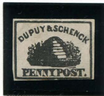
FORGERY C TAYLOR 1c BLACK ON WHITE (60L1)