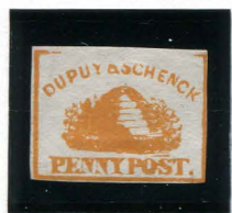
FORGERY C TAYLOR 1c ORANGE ON WHITE (60L1)