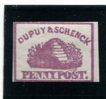
FORGERY C TAYLOR - FORM 4 1¢ PALE PURPLE ON WHITE LAID (60L1)