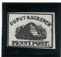
FORGERY C TAYLOR - FORM 4 1¢ BLACKISH BROWN ON WHITE LAID (60L1)