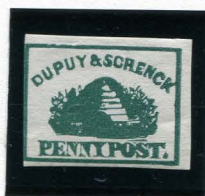
FORGERY C TAYLOR - FORM 4 1¢ GREEN ON WHITE WOVE (60L1)