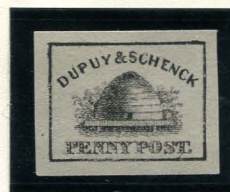
FORGERY B HUSSEY 1c BLACK ON BROWNISH SC (60L2)