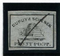
60L2 : GENUINE 1¢ BLACK ON GRAY PF CERT #536825