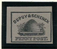
FORGERY A SCOTT 1c BLACK ON GRAY SC (60L2)

Dupuy & Schenck forgeries produced by Scott are known as "forgery A".