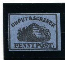
FORGERY C TAYLOR - FORM 4 1c BLACK ON VIOLET BLUE (60L2)