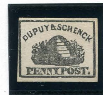
FORGERY C TAYLOR 1c BLACK ON CREAM LAID (60L1)

Moens published two different illustrations in his catalogues. The first illustration, lithographed by F. Deraedemacker, was used to create Forgery D. Moens used different illustrations, by an unlisted artist, for his publications after 1864. There are no recorded forgeries using this second design.