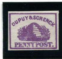
FORGERY C TAYLOR - FORM 8 1¢ PURPLE ON WHITE WOVE (60L1)