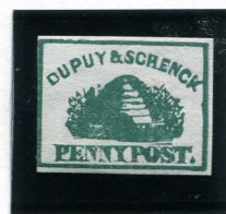
FORGERY C TAYLOR - FORM 4 1¢ GREEN ON WHITE LAID (60L1)