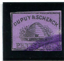
FORGERY E TAYLOR 1c BLACK ON VIOLET SC (60L2)