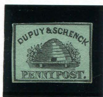
FORGERY E TAYLOR 1c BLACK ON LIGHT GREEN (60L2)