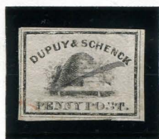
60L1 : GENUINE 1¢ BLACK ON WHITE PF CERT #536824

Dupuy & Schenck Penny Post issued two stamps of the same beehive design: one printed on white, glazed surface paper; and the other printed on grayish wove.