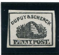
FORGERY C TAYLOR 1c BLACK ON WHITE LAID (60L1)