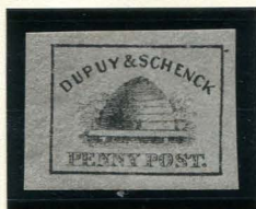
FORGERY B HUSSEY 1c BLACK ON GRAY SC (60L2)

Some sheets of forgery B show the edges of the forgeries were the surface colored area ends. These sheets all contain identical edges to the surface colored area. It is possible that these forgeries are modern copies of forgery B.