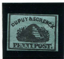
FORGERY C TAYLOR - FORM 4 1c BLACK ON GRAY GREEN (60L2)