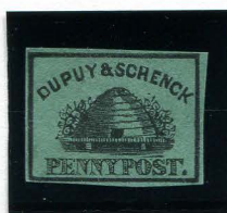
FORGERY E TAYLOR 1c BLACK ON GREEN (60L2)