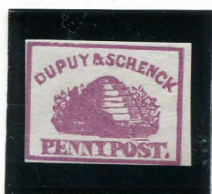
FORGERY C TAYLOR - FORM 4 1¢ PALE PURPLE ON WHITE (60L1)