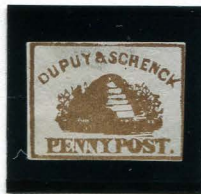
FORGERY C TAYLOR 1c BRONZE ON WHITE (60L1)