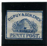
FORGERY E TAYLOR 1c BLUE ON WHITE (60L1)