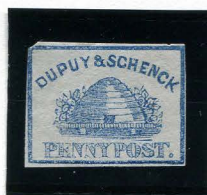
FORGERY E TAYLOR 1c ULTRAMARINE ON WHITE (60L1)