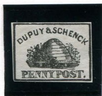
FORGERY C TAYLOR - FORM 16 1¢ BLACK ON WHITE WOVE (60L1)