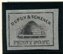
FORGERY B (MODERN?) HUSSEY 1c BLACK ON GRAY SC (60L2)