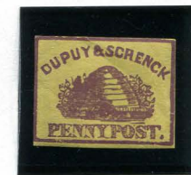
FORGERY C TAYLOR - FORM 8 1¢ PURPLE ON YELLOW (60L2)