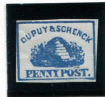
FORGERY C TAYLOR 1c BLUE ON WHITE (60L1)