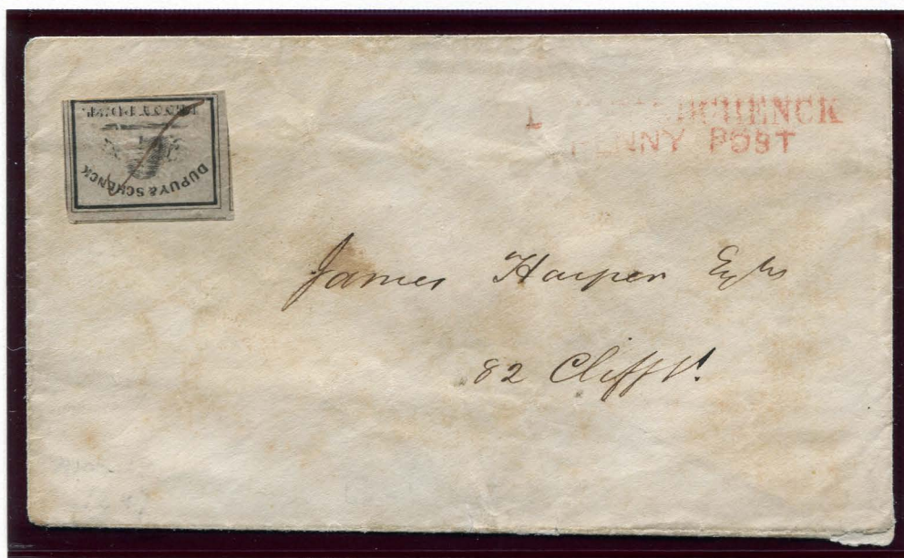
60L2 : 1¢ BLACK ON GRAY GENUINE ON COVER MANUSCRIPT CANCELLATION RED "DUPUY & SCHENCK PENNY POST" HANDSTAMP

The cover above was delivered locally by Dupuy & Schenck, prepaid with a genuine black on grayish type stamp. The cover is also marked with a red "Dupuy & Schenck Penny Post" handstamp.