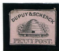
FORGERY D DERAEDEMACKER 1c BLACK ON LIGHT PINK (60L1)