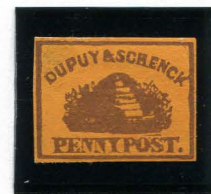
FORGERY C TAYLOR - FORM 7 1¢ BROWN ON BRIGHT ORANGE SC (60L2)