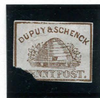
FORGERY E TAYLOR 1c BRONZE ON WHITE (60L1)