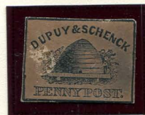
FORGERY A SCOTT 1c BLACK ON BROWN SC (60L2)

Forgeries engraved by Thomas Wood and offered for sale by George Hussey are known as "forgery B". Wood printed 6,000 Dupuy & Schenck forgeries according to his records as published in Byways of Philately . These forgeries were printed on surface colored paper.