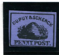
FORGERY C TAYLOR - FORM 16 1¢ BLACK ON LIGHT BLUE VIOLET SC (60L2)