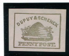
FORGERY G MODERN 1c OLIVE ON OFF-WHITE (60L1)