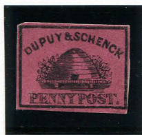
FORGERY E TAYLOR - FORM S13 1c BLACK ON RASPBERRY SC (60L1)

Taylor produced two Dupuy & Schenck forgeries, although it is most likely that the second is just a later version of the first, after plate wear dulled the image.