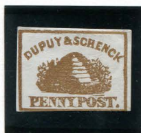
FORGERY C TAYLOR - FORM 7 1¢ BISTRE BROWN ON WHITE WOVE (60L1)