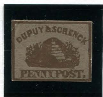
FORGERY C TAYLOR - FORM 7 1¢ BROWN ON GRAY BROWN SC (60L2)