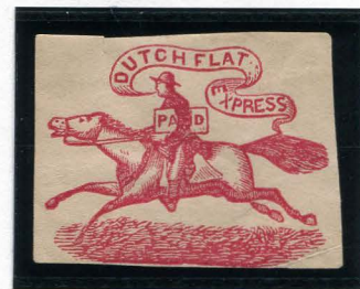
BOGUS 1 MOSHER DFLX-L2 TAYLOR RED VIOLET ON CREAM

The bogus labels below all share the same flaw, a small break in the ribbon outline above the "UT" of "DUTCH".