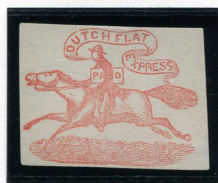
BOGUS 1VAR MOSHER DFLX-L2 TAYLOR RED (SHADE) ON GRAYISH CREAM BREAK OVER "U T"