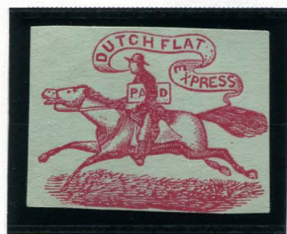
BOGUS 1 MOSHER DFLX-L2 TAYLOR - FORM AB11 RED VIOLET ON LIGHT GREENISH