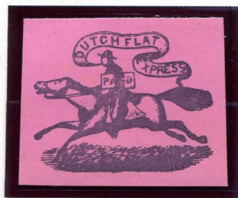
BOGUS 2 MOSHER DFLX-L1 MODERN DULL PURPLE ON BRIGHT PINK SC