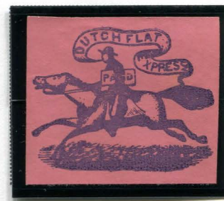
BOGUS 2 MOSHER DFLX-L1 MODERN DULL PURPLE ON SALMON SC