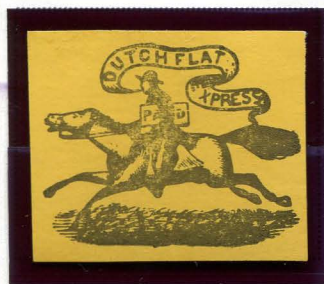
BOGUS 2 MOSHER DFLX-L1 MODERN DULL BLACK ON GOLDEN YELLOW SC

The following modern fakes are attributed to David Stirling.