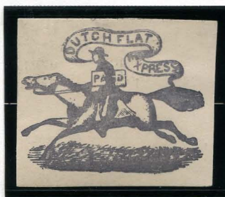
BOGUS 2 MOSHER DFLX-L1 MODERN BLUE BLACK ON CREAM