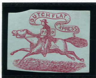
BOGUS 1 MOSHER DFLX-L2 TAYLOR - FORM AB11 RED VIOLET ON LIGHT BLUE GREEN LAID