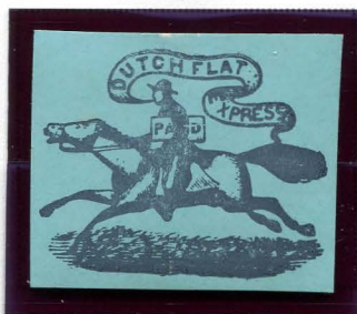
BOGUS 2 MOSHER DFLX-L1 MODERN DULL BLUE ON BRIGHT LIGHT BLUE SC