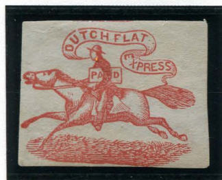
BOGUS 1VAR MOSHER DFLX-L2 TAYLOR RED (SHADE) ON GRAY BREAK OVER "U T"