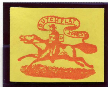
BOGUS 2 MOSHER DFLX-L1 MODERN RED ON YELLOW SC