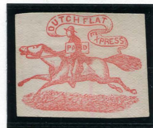
BOGUS 1VAR MOSHER DFLX-L2 TAYLOR RED (SHADE) ON DULL WHITE BREAK OVER "U T"