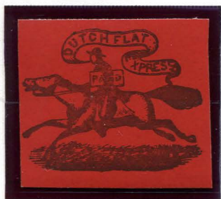
BOGUS 2 MOSHER DFLX-L1 MODERN DULL BLACK ON RED SC