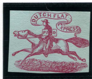
BOGUS 1 MOSHER DFLX-L2 TAYLOR - FORM AB11 RED VIOLET ON LIGHT BLUE GREEN