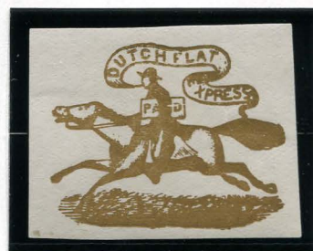
BOGUS 2 MOSHER DFLX-L1 MODERN BRASSY BROWN ON WHITE