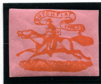
BOGUS 2 MOSHER DFLX-L1 MODERN RED ON PINK