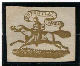
BOGUS 2 MOSHER DFLX-L1 MODERN BRASSY BROWN ON CREAM