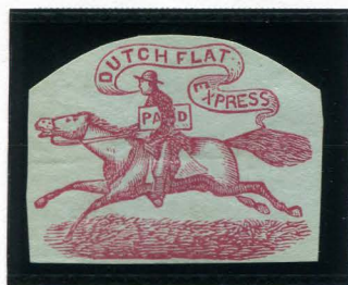
BOGUS 1 MOSHER DFLX-L2 TAYLOR - FORM AB11 RED VIOLET ON LIGHT GREENISH LAID