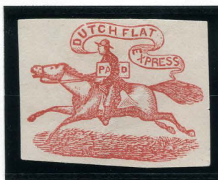
BOGUS 1VAR MOSHER DFLX-L2 TAYLOR RED (SHADE) ON WHITE BREAK OVER "U T"