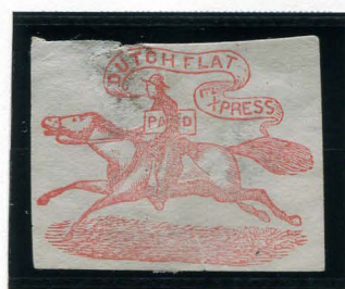
BOGUS 1VAR MOSHER DFLX-L2 TAYLOR RED (SHADE) ON BLUISH GRAY BREAK OVER "U T"

The bogus labels below all share the same flaw, a small break in the ribbon outline above the "UT" of "DUTCH".