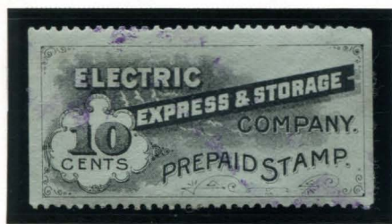
ELCX-S1 BLACK ON GREEN H. PERF 12

Electric Express & Storage Co. issued stamps to prepay the delivery of packages on their line. These 10¢ stamps are known in several colors including green, blue, pink, and yellow.