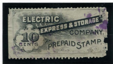
ELCX-S1 BLACK ON GRAY H. PERF 12