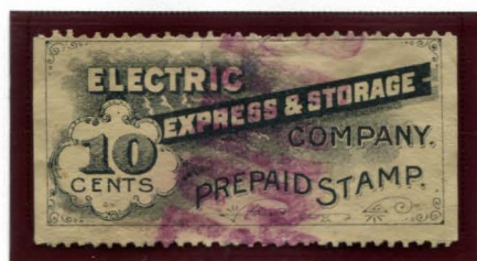
ELCX-S1 BLACK ON YELLOW H. PERF 12