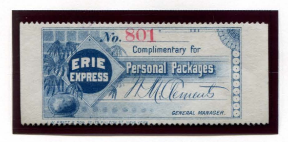
ERIX-F1 BLUE ON WHITE WITH RED CONTROL H. PERF 14 - V. IMPERF