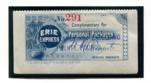
ERIX-F2 BLUE ON WHITE WITH RED CONTROL FOR PACKAGES NOT EXCEEDING TWENTY POUNDS, BLUE OVERPRINT H. PERF 14 - V. IMPERF

The United States Express Company, having withdrawn from the N. Y., P. & O. R. R., the latter company will, on and after Mond ay, 17th inst., operate its own express, to be known as the