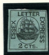
FORGERY B TAYLOR - FORM AB1 2¢ BLACK ON GREEN (65L1)