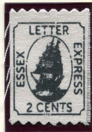
MODERN FORGERY 2¢ BLACK ON CANVAS CRAFTING ELEMENT

An image using the name and design elements of the "Essex Letter Express" stamps has found use within the modern textile industry. This new "forgery" can be found on fabrics and crafting accessories. Although the layout of this forgery is similar to the real stamp, it is easily identifiable. The center ship is entirely different, and "CENTS" is written out fully at the bottom rather than the original "CTS."