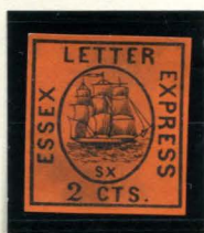
FORGERY C1 2¢ BLACK ON VERMILION SC (65L1)