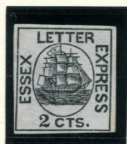
FORGERY B VAR TAYLOR - FORM AB18 2¢ BLACK ON WHITE (65L1)