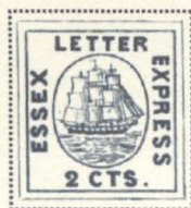
FORGERY H MOENS / SCHMITZ PHOTOCOPY FROM 1864 CATALOGUE (65L1)

Two more forgeries based on Hussey's design are showcased here, but it is unknown who made these. The first one is known both with and without the "SX" under the waterlines, and has the flag's point almost touching the oval. The other forgery has a wider "SX" under the waterlines.