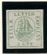
FORGERY E TAYLOR - FORM AA1 2c DULL GREEN ON WHITE (65L1)