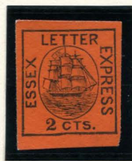
FORGERY A SCOTT 2¢ BLACK ON VERMILION SC (65L1)

While there are several different types of forgeries of the "Essex Letter Express" stamps, there are only two designs that have the "SX" in the flag, as it appears on the original. One of these designs was used by J. W. Scott for his catalogues and his forgeries, and is the design closest resembling the original stamps, as it also still has a full body of water in the bottom half of the oval. The water is not as wavy though, and the "2" below it is rounder, with a smooth foot stroke.