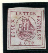
FORGERY E TAYLOR - FORM AA1 2c MAROON ON WHITE (65L1)