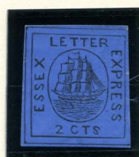
FORGERY E TAYLOR - FORM AA1 2¢ BLACK ON ROYAL BLUE SC (65L1)