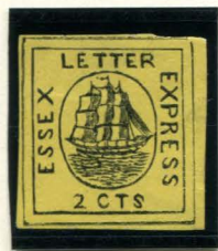
FORGERY E TAYLOR - FORM AA6 2¢ BLACK ON LIGHT YELLOW SC (65L1)