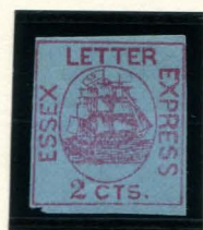
FORGERY B TAYLOR - FORM BB2 2¢ VIOLET ON LIGHT BLUE (65L1)