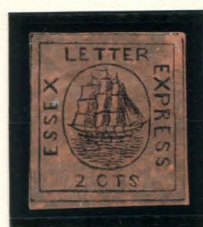
FORGERY E TAYLOR - FORM AA6 2¢ BLACK ON PEACH SC (65L1)