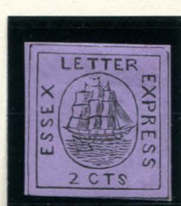
FORGERY E TAYLOR - FORM AA4 2¢ BLACK ON LAVENDER SC (65L1)