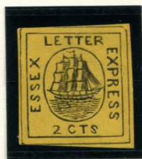
FORGERY E TAYLOR - FORM AA24 2¢ BLACK ON GOLD YELLOW SC (65L1)