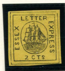
FORGERY E TAYLOR - FORM 13 2c BLACK ON YELLOW SC (65L1)