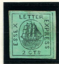
FORGERY E TAYLOR - FORM AA24 2¢ BLACK ON GREEN SC (65L1)