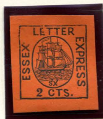
FORGERY F POSITION 3 HUSSEY 2¢ BLACK ON VERMILION SC (65L1)