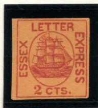
FORGERY B VAR TAYLOR - FORM B3 2¢ RED ON BRIGHT ORANGE (65L1)