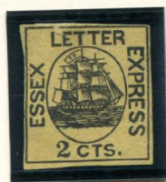
FORGERY B TAYLOR - FORM AB1 2¢ BLACK ON YELLOW (65L1)

A variation exists, probably due to plate wear, in which two small breaks appeared in the left border, right above the "X" of "ESSEX". This variation can be found on forms "B3" and "AB18".