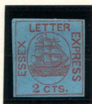
FORGERY B VAR TAYLOR - FORM B3 2¢ RED ON BRIGHT BLUE (65L1)