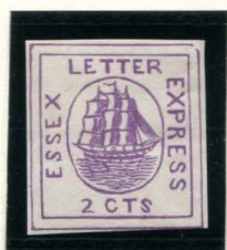
FORGERY E TAYLOR - FORM 8 2c PURPLE ON WHITE (65L1)