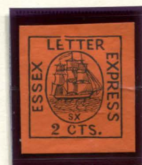
FORGERY F POSITION 4 HUSSEY 2¢ BLACK ON VERMILION SC (65L1)