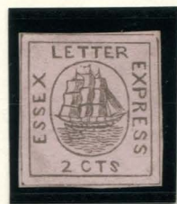
FORGERY E TAYLOR - FORM AA1 2¢ DULL BROWN ON PINKISH H LAID (65L1)