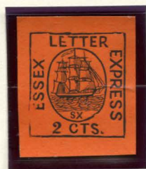
FORGERY F POSITION 2 HUSSEY 2¢ BLACK ON VERMILION SC (65L1)