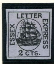
FORGERY B TAYLOR - FORM AB1 2¢ BLACK ON GRAY (65L1)