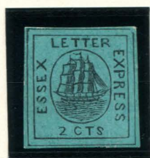
FORGERY E TAYLOR - FORM AA7 2¢ BLACK ON TEAL SC (65L1)