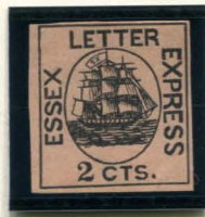
FORGERY B TAYLOR - FORM AB1 2¢ BLACK ON PEACH (65L1)