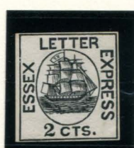
FORGERY B VAR TAYLOR - FORM AB18 2¢ BLACK ON OFF-WHITE (65L1)