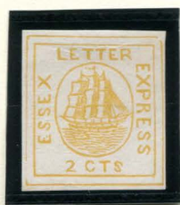
FORGERY E TAYLOR - FORM 8 2c YELLOW ON WHITE (65L1)