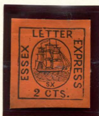
FORGERY F POSITION 1 HUSSEY 2¢ BLACK ON VERMILION SC (65L1)