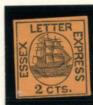
FORGERY B VAR TAYLOR - FORM AB18 2¢ BLACK ON LIGHT ORANGE (65L1)