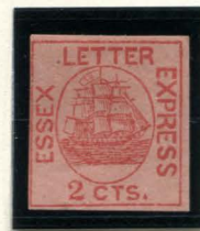
FORGERY B VAR TAYLOR - FORM B3 2¢ RED ON SALMON (65L1)