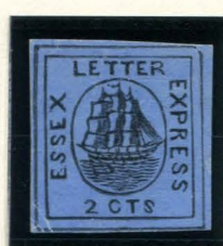
FORGERY E TAYLOR - FORM AA4 2¢ BLACK ON LIGHT BLUE SC (65L1)