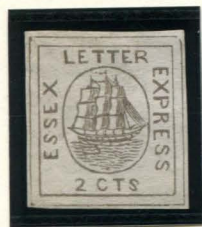
FORGERY E TAYLOR - FORM AA1 2¢ DULL BROWN ON WHITE (65L1)