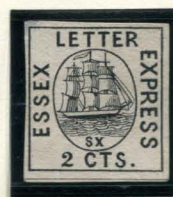
FORGERY G MOENS / DERAEDEMAER 2¢ BLACK ON WHITE (65L1)