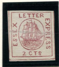
FORGERY E TAYLOR - FORM AA1 2c DULL RED ON WHITE (65L1)