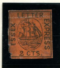
65L1 2¢ BLACK ON VERMILION SC GENUINE

Although this old story has never been proven as fact, no other history is known for the post. It is true that the genuine stamps likely never saw use outside of philatelic collections.