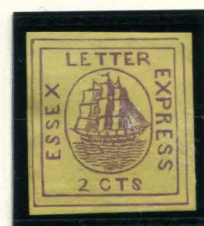
FORGERY E TAYLOR - FORM 8 2c PURPLE ON YELLOW (65L1)