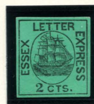
FORGERY B VAR TAYLOR - FORM AB18 2¢ BLACK ON BRIGHT GREEN SC (65L1)