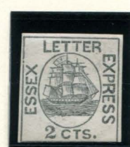
FORGERY B VAR TAYLOR - (FORM AB18) 2¢ GRAYISH BLACK ON WHITE (65L1)