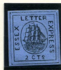
FORGERY E TAYLOR - FORM AA6 2¢ BLACK ON LIGHT BLUE SC (65L1)