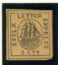
FORGERY E TAYLOR - FORM AA4 2¢ BLACK ON ORANGE BUFF (65L1)