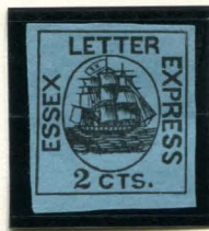
FORGERY B TAYLOR - FORM AB1 2¢ BLACK ON BLUE (65L1)