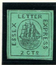
FORGERY E TAYLOR - FORM AA6 2¢ BLACK ON GREEN SC (65L1)