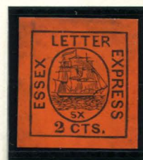
FORGERY D 2¢ BLACK ON VERMILION SC (65L1)

An image using the name and design elements of the "Essex Letter Express" stamps has found use within the modern textile industry. This new "forgery" can be found on fabrics and crafting accessories. Although the layout of this forgery is similar to the real stamp, it is easily identifiable. The center ship is entirely different, and "CENTS" is written out fully at the bottom rather than the original "CTS."