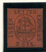
FORGERY F HUSSEY - EARLY 2¢ BLACK ON VERMILION SC (65L1)

On Hussey's forgery, the second "S" in "EXPRESS" is smaller than the first. On later printings, which were in horizontal strips of four, the first "E" in "LETTER" has a short top bar. Due to various flaws, each stamp in the strip is distinguishable, resulting in four plateable positions of the forgery.