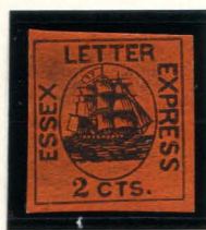
FORGERY B TAYLOR 2¢ BLACK ON VERMILION SC (65L1)