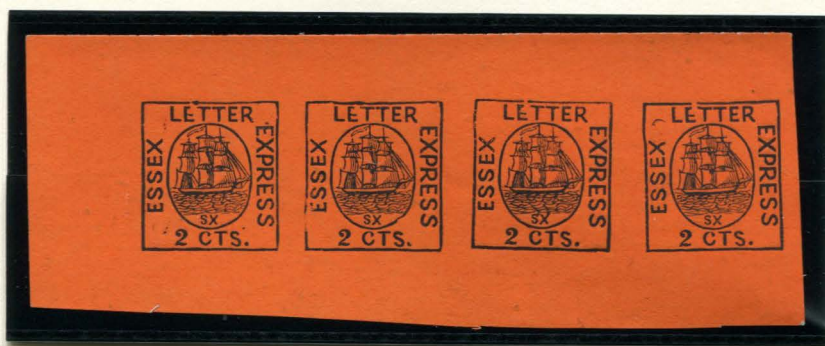
FORGERY F HUSSEY 2¢ BLACK ON VERMILION SC STRIP OF FOUR (65L1)