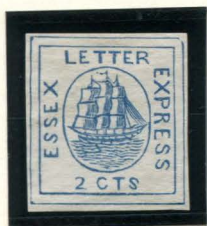
FORGERY E TAYLOR - FORM AA1 2c DULL BLUE ON WHITE (65L1)