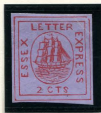
FORGERY E TAYLOR - FORM 5 2c RED ON GRAY VIOLET SC (65L1)