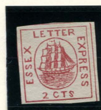
FORGERY E TAYLOR - FORM AA1 2c RED ON WHITE (65L1)