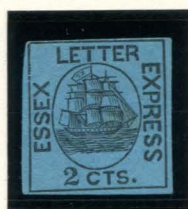
FORGERY B VAR TAYLOR - FORM AB18 2¢ BLACK ON LIGHT BLUE (65L1)