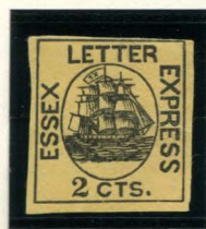
FORGERY B TAYLOR - FORM AB1 2¢ BLACK ON GOLD YELLOW (65L1)