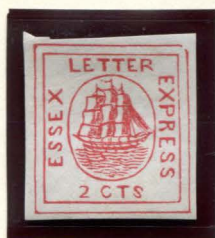
FORGERY E TAYLOR - FORM 5 2c RED ON WHITE (65L1)

Taylor had made a different forgery before the other one, based on the illustration in J.-B. Moens' early catalogues, and as such it does not have the "SX" in the flag. He even had copied the extra border as part of the stamp, but he forgot to add a period after "CTS", and this is the only forgery that lacks that period, making it the easiest way to tell it apart.