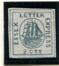
FORGERY E TAYLOR - FORM AA1 2c PINE GREEN ON WHITE (65L1)