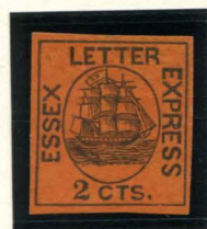
FORGERY B TAYLOR - FORM AB19 2¢ BLACK ON ORANGE SC (65L1)