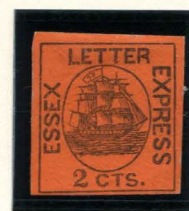
FORGERY B TAYLOR 2¢ GRAYISH BLACK ON VERMILION SC (65L1)