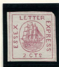
FORGERY E TAYLOR - FORM AA1 2¢ RED VIOLET ON WHITE V LAID (65L1)