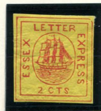
FORGERY E TAYLOR - FORM 5 2c RED ON YELLOW SC (65L1)