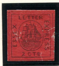
FORGERY E TAYLOR - FORM 13 2c BLACK ON SCARLET SC (65L1)