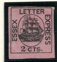
FORGERY B TAYLOR - FORM AB1 2¢ BLACK ON PINK (65L1)