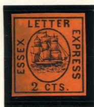
FORGERY C 2¢ BLACK ON VERMILION SC (65L1)