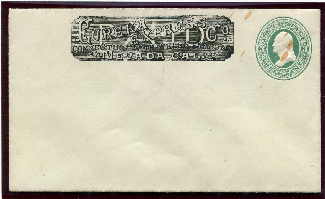
EUR-001 - EUREKA EXPRESS CO. FRANK TYPE I PRINTED ON U83 : 3¢ GREEN ON AMBER | UPSS 186-2

Eureka Express issued franks printed on US stamped envelopes. These franks were similar in design to the Wells, Fargo & Co. franks used at the time.