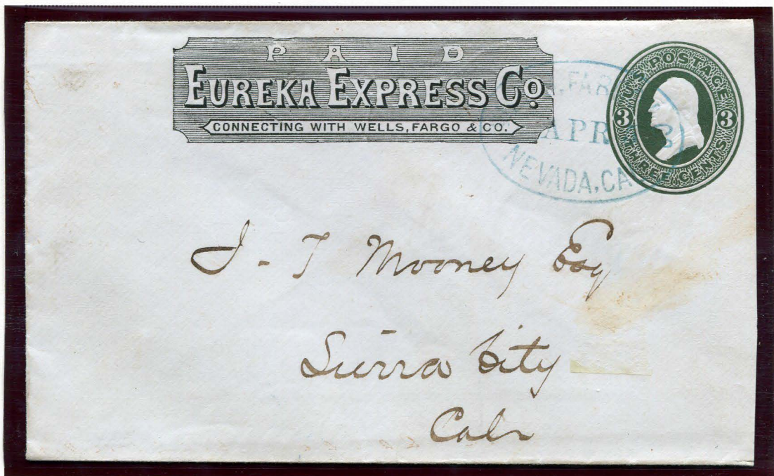
EUR-002 - EUREKA EXPRESS CO. FRANK TYPE 2 PRINTED ON U82 : 3¢ GREEN ON WHITE | UPSS 172-2 WELLS, FARGO & CO. CANCEL 12-3 (WO 1687)