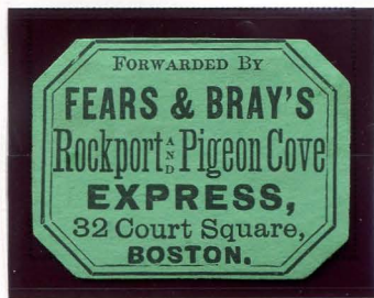
F&BX-L3 BLACK ON GREEN SC IMPERFORATE

The third type of label uses an octagonal frame design and is known in four colors. These labels are known used in 1884.