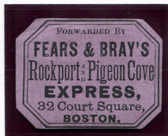
F&BX-L3 BLACK ON LAVENDER IMPERFORATE

From at least 1887 on, three other label types were used. These labels had simple rectangular designs similar to the earlier labels, but larger. They were all printed in black on orange, but differed in their text font and address.