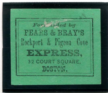
F&BX-L1 BLACK ON GREEN SC IMPERFORATE

Six different types of Fears & Bray's Express labels are recorded. The first two types are similar in design, with a rectangular, double line border around the same text. The first, used around 1879, was known used on merchandise orders. It is imperforate. The second type is rouletted horizontally in black.