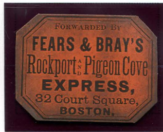
F&BX-L4 BLACK ON ORANGE SC IMPERFORATE