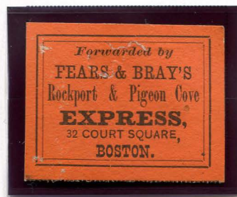
F&BX-L2 BLACK ON ORANGE SC H ROULETTE 25

The third type of label uses an octagonal frame design and is known in four colors. These labels are known used in 1884.