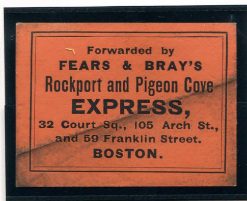
F&BX-L12 BLACK ON ORANGE SC IMPERFORATE

From at least 1887 on, three other label types were used. These labels had simple rectangular designs similar to the earlier labels, but larger. They were all printed in black on orange, but differed in their text font and address.