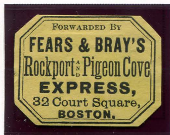
F&BX-L3 BLACK ON YELLOW IMPERFORATE

The third type of label uses an octagonal frame design and is known in four colors. These labels are known used in 1884.