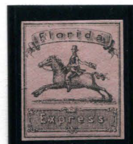
BOGUS 1 BLACK ON PINK