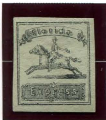
BOGUS 4 BLACK ON PALE GREEN