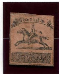
BOGUS 4 BLACK ON LIGHT RED