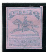
BOGUS 3 TAYLOR - FORM S15 PALE BLUE ON LIGHT PINK LAID STATE 3