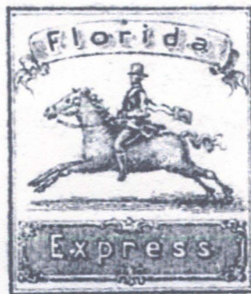
BOGUS 1 PHOTOCOPY, 250%

On the bogus 1 stamps, the scrollwork ornament above the "pre" of "Express" is small and very fine. It is similar in shape to a fleur-de-lis that has been stretched wide and is sometimes described as a "jester's hat" shape - in this design, the center point is separated from the rest of the ornament with a thin outline. Although both the left and right of the horse's reigns are technically visible, they are so close together that they appear as only one curved line. The toe of the rider's boot points slightly toward the ground.