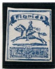
BOGUS 3 TAYLOR BLUE ON WHITE LAID STATE 4