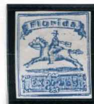
BOGUS 3 TAYLOR DEEP BLUE ON WHITE STATE 6