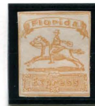
BOGUS 3 TAYLOR BROWN YELLOW ON WHITE STATE 3