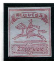
BOGUS 3 TAYLOR RED ON PALE VIOLET BLUE STATE 1