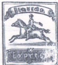
BOGUS 5 - MOENS ALBUM AS COPIED FROM LE TIMBRE-POSTE , 1883

At some point, Moens changed the illustrations in his publications to more closely resemble the Bogus 4 design. In the 1883 edition of Le Timbre-Poste , the illustration used is the same design as the fake known as "Bogus 5".