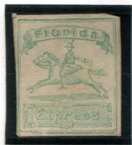
BOGUS 3 TAYLOR GREEN ON BUFF STATE 3