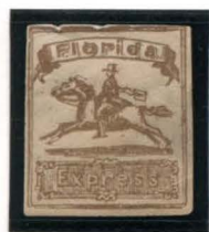
BOGUS 3 TAYLOR BROWN (SHADE) ON GRAYISH WHITE STATE 6