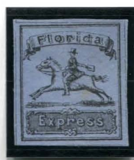
BOGUS 2 AFTER MOENS (1864) BLACK ON LIGHT BLUE