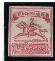
BOGUS 3 TAYLOR DEEP RED ON WHITE STATE 2