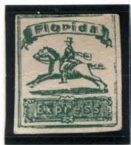
BOGUS 3 TAYLOR DARK GREEN ON CREAM STATE 5