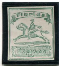
BOGUS 3 TAYLOR GREEN ON PALE BUFF STATE 2