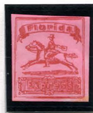
BOGUS 3 TAYLOR RED ON PINK SC STATE 4