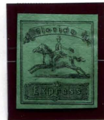
BOGUS 4 BLACK ON DEEP GREEN