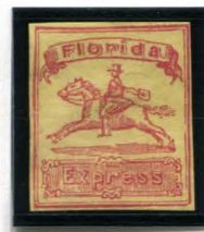
BOGUS 3 TAYLOR BRIGHT RED ON YELLOW H. LAID STATE 2