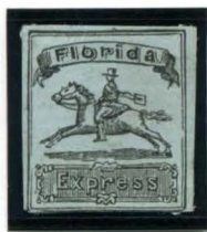
BOGUS 3 TAYLOR - FORM 1 BLACK ON GREENISH H LAID STATE 3