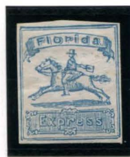
BOGUS 3 TAYLOR BLUE ON WHITE STATE 6