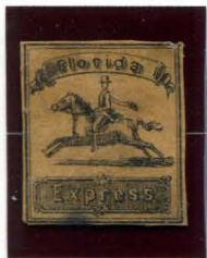
BOGUS 4 BLACK ON ORANGE BUFF