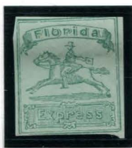
BOGUS 3 TAYLOR - FORM 20 GREEN ON PALE GREEN STATE 3