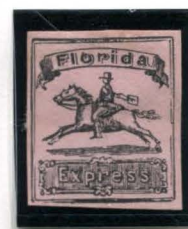
BOGUS 3 TAYLOR BLACK ON PALE PINK STATE 5