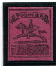
BOGUS 3 TAYLOR - (FORM 1) BLACK ON RASPBERRY SC WMK STATE 3