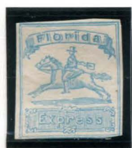
BOGUS 3 TAYLOR - FORM S15 PALE BLUE ON CREAM STATE 3