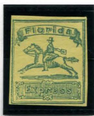
BOGUS 3 TAYLOR GREEN ON YELLOW STATE 1