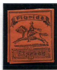
BOGUS 3 TAYLOR BLACK ON VERMILION SC STATE 3