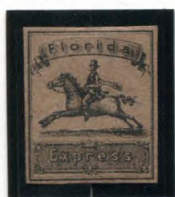
BOGUS 1 BLACK ON BROWN