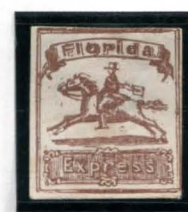
BOGUS 3 TAYLOR - FORM S16 ORANGE BROWN ON WHITE STATE 6