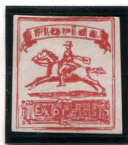
BOGUS 3 TAYLOR DEEP BRIGHT RED ON WHITE STATE 4