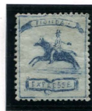
FLAX - L8 HAND DRAWN BLUE-BLACK ON WHITE

The bogus at right is currently listed in Mosher's Catalog of Private Express Covers, Labels and Stamps . It appears to be a hand-drawn fake, with only a minimal resemblance to the "original" design. This example is ungummed and perforated.