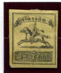
BOGUS 4 BLACK ON YELLOW