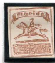
BOGUS 3 TAYLOR RED BROWN ON WHITE STATE 5