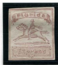
BOGUS 3 TAYLOR BROWN ON GRAYISH STATE 2