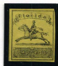
BOGUS 1 BLACK ON DEEP YELLOW