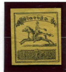
BOGUS 4 BLACK ON DEEP YELLOW