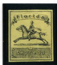
BOGUS 1 BLACK ON YELLOW