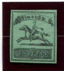
BOGUS 4 BLACK ON GREEN