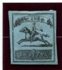
BOGUS 4 BLACK ON LIGHT BLUE