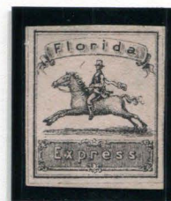
BOGUS 1 BLACK ON PINKISH