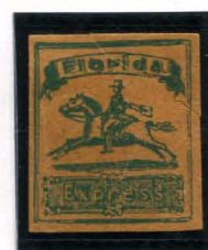
BOGUS 3 TAYLOR DARK GREEN ON ORANGE BROWN STATE 5