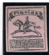
BOGUS 3 TAYLOR BLACK ON PINK LAID STATE 5