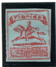
BOGUS 3 TAYLOR RED ON LIGHT BLUE STATE 5