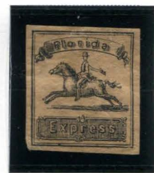
BOGUS 4 BLACK ON BUFF