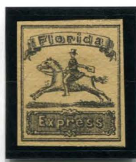
BOGUS 2 AFTER MOENS (1864) BLACK ON GOLDEN YELLOW