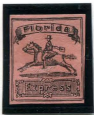
BOGUS 3 TAYLOR - FORM 1 BLACK ON SALMON STATE 3