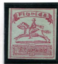
BOGUS 3 TAYLOR - FORM AB11 RED VIOLET ON LT. GREENISH LAID STATE 4