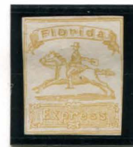
BOGUS 3 TAYLOR DEEP YELLOW ON WHITE STATE 3