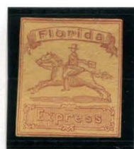
BOGUS 3 TAYLOR RED BROWN ON ORANGE STATE 1