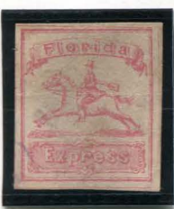
BOGUS 2 AFTER MOENS (1864) LIGHT RED ON WHITE