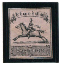
BOGUS 1 BLACK ON PALE PINK