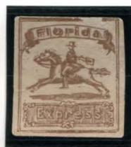
BOGUS 3 TAYLOR BROWN (SHADE) ON GRAYISH WHITE STATE 6