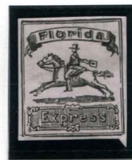
BOGUS 3 TAYLOR - FORM 1 BLACK ON PALE PINK V LAID STATE 3