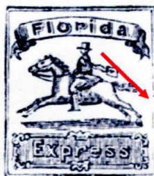
BOGUS 3 - STATE 5 PHOTOCOPY, 150% REENTERED BORDER BREAK AT RIGHT BREAK AT LOWER LEFT