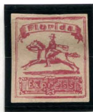
BOGUS 3 TAYLOR RED ON PALE TAN STATE 4