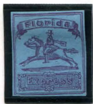
BOGUS 3 TAYLOR - FORM 21 VIOLET ON BLUE STATE 1