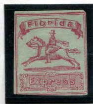
BOGUS 3 TAYLOR - FORM AB11 RED VIOLET ON YELLOW GREENISH STATE 4