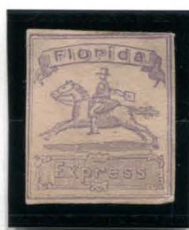
BOGUS 3 TAYLOR LAVENDER ON PINKISH BUFF STATE 1