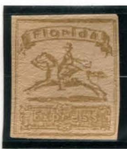
BOGUS 3 TAYLOR BROWN ON TAN STATE 4