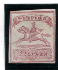
BOGUS 3 TAYLOR RED VIOLET ON WHITE STATE 1