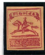
BOGUS 3 TAYLOR RED ON ORANGE BUFF STATE 4