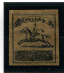
BOGUS 4 BLACK ON BROWN