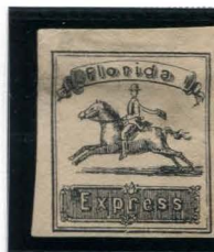
BOGUS 4 BLACK ON CREAM