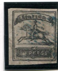
BOGUS 5 AFTER MOENS (1883) BLACK ON WHITE - CANCELLED

The bogus at right is currently listed in Mosher's Catalog of Private Express Covers, Labels and Stamps . It appears to be a hand-drawn fake, with only a minimal resemblance to the "original" design. This example is ungummed and perforated.