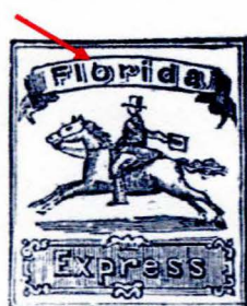
BOGUS 3 - STATE 1 PHOTOCOPY, 150% BUMP ON "O" NO SIGNIFICANT FLAWS

Taylor's stamps were printed many times, which resulted in wear to some areas of the die. Some of these flaws appear consistently - they are referred to in this collection as "states", although the exact order in which these flaws developed is not certain.