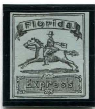
BOGUS 3 TAYLOR - FORM 1 BLACK ON BLUISH STATE 3