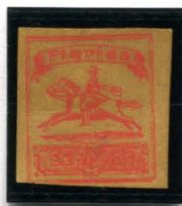
BOGUS 3 TAYLOR RED ON ROUGH OCHRE STATE 4