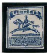
BOGUS 3 TAYLOR DARK BLUE ON WHITE STATE 3