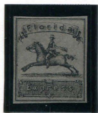
BOGUS 1 BLACK ON GRAY BROWN