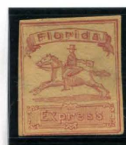
BOGUS 3 TAYLOR RED ON ORANGE LAID STATE 1