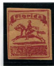
BOGUS 3 TAYLOR RED ON BUFF STATE 4