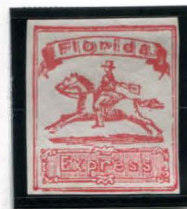
BOGUS 3 TAYLOR - FORM 12 RED ON WHITE STATE 3