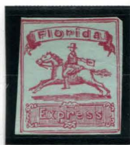
BOGUS 3 TAYLOR - FORM AB11 RED VIOLET ON LIGHT BLUE GREEN STATE 4