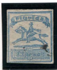
BOGUS 3 TAYLOR BLUE ON WHITE STATE 1