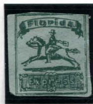
BOGUS 3 TAYLOR DARK GREEN ON BLUE GREEN STATE 5