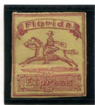
BOGUS 3 TAYLOR DEEP RED ON YELLOW H. LAID STATE 2