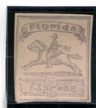
BOGUS 3 TAYLOR LAVENDER GRAY ON PINKISH BUFF STATE 1