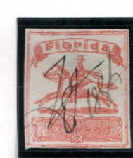
BOGUS 3 TAYLOR LIGHT RED ON WHITE - CANCELLED STATE 4