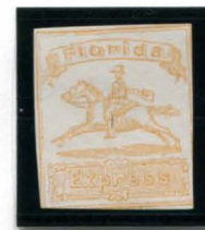
BOGUS 3 TAYLOR YELLOW ON WHITE STATE 3