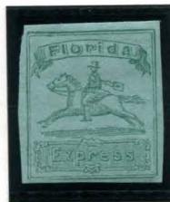
BOGUS 3 TAYLOR - FORM 20 GREEN ON GREEN STATE 3