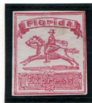
BOGUS 3 TAYLOR RED ON WHITE STATE 2