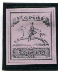
BOGUS 2 AFTER MOENS (1864) BLACK ON PASTEL PINK