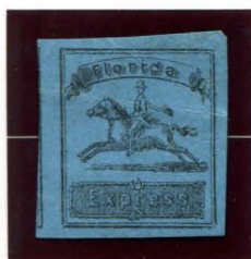
BOGUS 4 BLACK ON BLUE