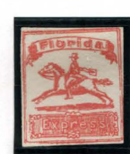
BOGUS 3 TAYLOR RED (SHADE) ON WHITE STATE 4