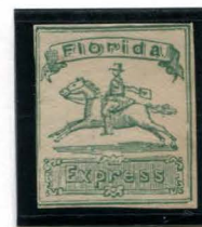
BOGUS 3 TAYLOR - FORM 20 DARK GREEN ON PALE GRAY BROWN STATE 2