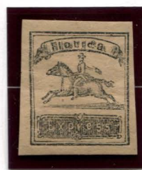
BOGUS 5 AFTER MOENS (1883) GRAY BLACK ON CREAM