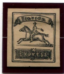
BOGUS 5 AFTER MOENS (1883) INTENSE BLACK ON CREAM