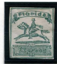
BOGUS 3 TAYLOR DEEP GREEN ON WHITE STATE 3