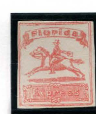
BOGUS 3 TAYLOR LIGHT RED ON WHITE STATE 4