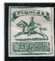
BOGUS 3 TAYLOR DARK GREEN ON WHITE STATE 5