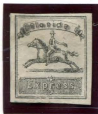
BOGUS 4 BLACK ON WHITE

Aside from the rougher printing, there are other key differences between bogus 4 and bogus 1. The ornament above "Express" is changed to a smaller "shield" or "tulip" like shape. The straps of the rider's bag are also changed from wavy lines to smooth arcs.