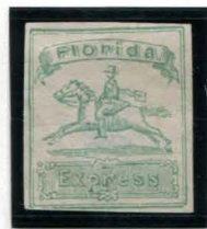
BOGUS 3 TAYLOR GREEN ON WHITE STATE 3