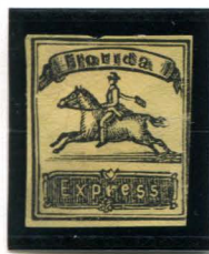
BOGUS 5 AFTER MOENS (1883) BLACK ON LIGHT YELLOW

Like bogus 4, bogus 5 has only one visible rein, a downward pointed boot, arced bag straps, and small, tulip-shaped ornament. However, this version is much rougher and less detailed than bogus 4, and the front legs of the horse are slightly curved.