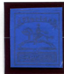
BOGUS 2 AFTER MOENS (1864) DULL GOLD ON BLUE SC