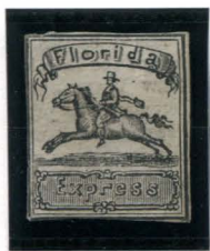
UNLISTED ILLUSTRATION BLACK ON WHITE

The bogus at left is another unlisted variety. It is printed on paper with text printed on the reverse - likely from some philatelic journal. This illustration is very well done, and appears to mostly copy the characteristics of bogus 1.