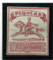
BOGUS 3 TAYLOR DEEP RED ON BLUE GREEN H. LAID STATE 2