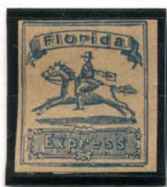
BOGUS 3 TAYLOR BLUE ON TAN STATE 4