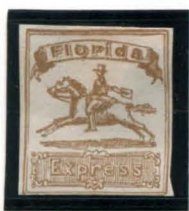
BOGUS 3 TAYLOR BROWN ON WHITE STATE 1