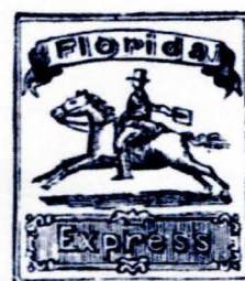
BOGUS 3 - STATE 3 PHOTOCOPY, 150% BREAKS AT RIGHT & LOWER LEFT

The border of the die first wears down on the right side. As this flaw progresses, the die also wears heavily on the lower left border.