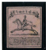
BOGUS 1 BLACK ON PALE SALMON