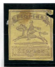
BOGUS 3 TAYLOR LAVENDER ON YELLOW STATE 1