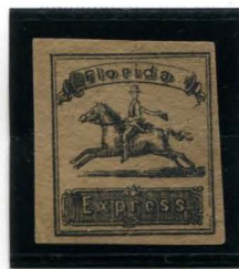
BOGUS 4 BLACK ON TAN