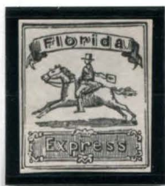
BOGUS 3 TAYLOR - FORM 1 BLACK ON WHITE WMK STATE 3