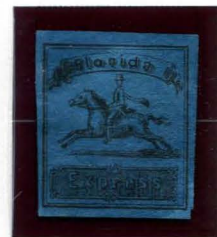
BOGUS 4 BLACK ON DEEP BLUE