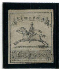
BOGUS 1 BLACK ON BUFF