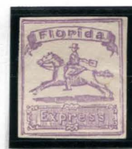
BOGUS 3 TAYLOR VIOLET ON WHITE STATE 3