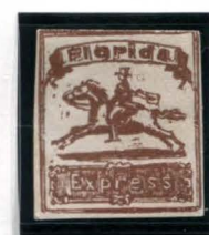
BOGUS 3 TAYLOR - FORM S16 VIOLET BROWN ON WHITE STATE 6