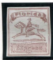
BOGUS 3 TAYLOR BROWN ON WHITE STATE 2