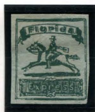
BOGUS 3 TAYLOR DARK GREEN ON LIGHT GREEN STATE 5