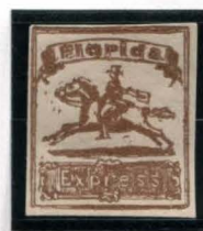
BOGUS 3 TAYLOR BROWN (SHADE) ON WHITE STATE 6