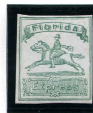
BOGUS 3 TAYLOR GREEN ON WHITE STATE 2