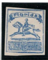
BOGUS 3 TAYLOR BLUE ON WHITE STATE 5