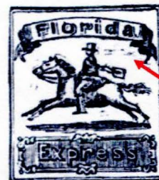
BOGUS 3 - STATE 6 PHOTOCOPY, 150% REENTERED BORDER FAST HORSE MESSY IMPRESSION

At some point, the border was re-entered, and the lower border line is strengthened. This often causes the lower border lines to touch, resulting in a single thick line. Although the right border is initially corrected, the lower left corner is still broken. In the fifth state, the right border is broken again.