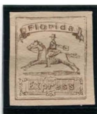
BOGUS 3 TAYLOR BROWN ON CREAM STATE 2