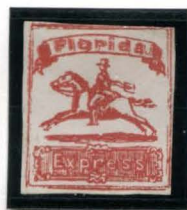
BOGUS 3 TAYLOR RED ON WHITE STATE 5