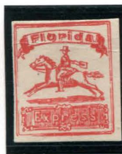
BOGUS 3 TAYLOR RED (SHADE) ON WHITE STATE 4