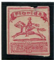
BOGUS 3 TAYLOR RED ON CREAM STATE 1