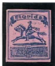
BOGUS 3 TAYLOR BLUE ON PINK STATE 6