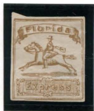
BOGUS 3 TAYLOR BROWN ON WHITE STATE 5