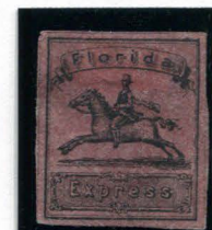
BOGUS 1 BLACK ON RED VIOLET