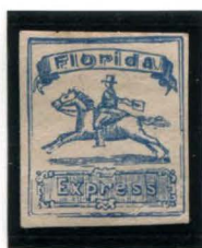
BOGUS 3 TAYLOR BLUE ON CREAM STATE 5