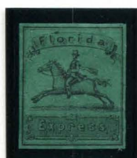
BOGUS 1 BLACK ON GREEN