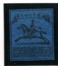
BOGUS 1 BLACK ON DARK BLUE

The printer of the design known as "Bogus 4" is unknown. These stamps are printed on similar papers to those used for the bogus 1 design, indicating that they may have been printed by the same person or company. The bogus 4 design shares many of the same characteristics as bogus 1 - It shows only one rein and the boot of the rider is pointed downward.