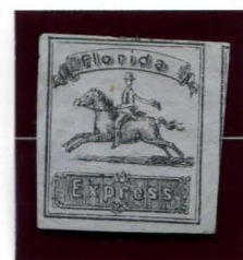
BOGUS 4 BLACK ON PALE BLUE