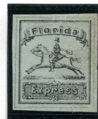
BOGUS 2 AFTER MOENS (1864) BLACK ON PASTEL GREEN