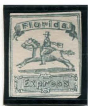
BOGUS 3 TAYLOR GREENISH GRAY ON WHITE STATE 3