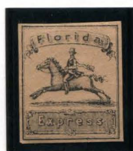
BOGUS 1 BLACK ON ORANGE