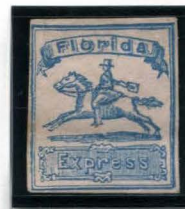
BOGUS 3 TAYLOR BLUE ON PINK STATE 1