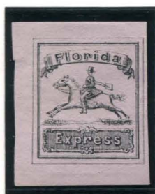
BOGUS 2 AFTER MOENS (1864) BLACK ON PALE PINK