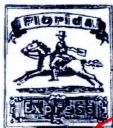
BOGUS 3 - STATE 4 PHOTOCOPY, 150% REENTERED BORDER w/ DARK BOTTOM BREAK AT LOWER LEFT

The border of the die first wears down on the right side. As this flaw progresses, the die also wears heavily on the lower left border.