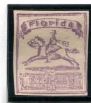
BOGUS 3 TAYLOR VIOLET ON CREAM STATE 3