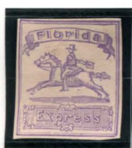
BOGUS 3 TAYLOR PURPLE ON PALE PINK STATE 1