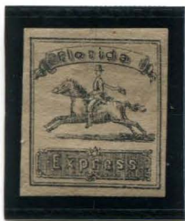
BOGUS 4 BLACK ON GRAY BUFF