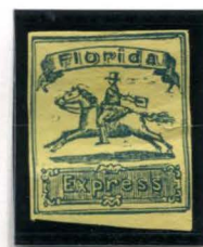
BOGUS 3 TAYLOR BLUE ON YELLOW STATE 6