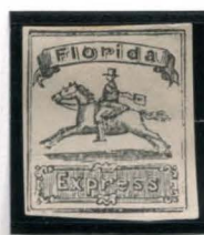
BOGUS 3 TAYLOR BLACK ON WHITE STATE 5