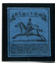
BOGUS 1 BLACK ON BLUE