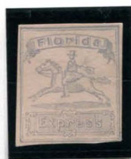
BOGUS 3 TAYLOR GRAY ON BUFF STATE 1