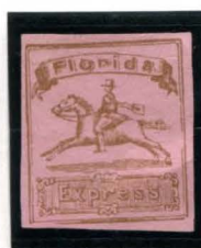
BOGUS 3 TAYLOR BROWN ON PINK STATE 5