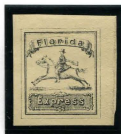
BOGUS 2 AFTER MOENS (1864) BLACK ON PASTEL YELLOW