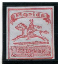
BOGUS 3 TAYLOR - FORM 12 RED ON GRAY STATE 3