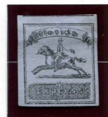
BOGUS 4 BLACK ON PALE BLUE VIOLET