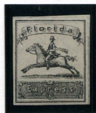
BOGUS 1 BLACK ON GRAY BUFF