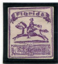
BOGUS 3 TAYLOR PURPLE ON WHITE STATE 3