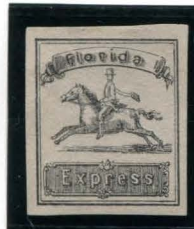
BOGUS 4 BLACK ON PINKISH