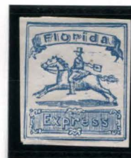
BOGUS 3 TAYLOR BLUE ON CREAM STATE 6