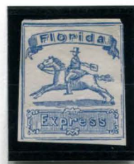
BOGUS 3 TAYLOR BLUE ON WHITE STATE 3