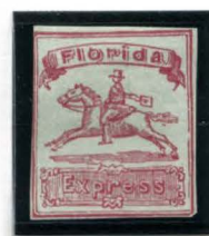
BOGUS 3 TAYLOR DEEP RED BLuish H. LAID STATE 2