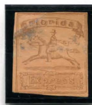
BOGUS 3 TAYLOR BROWN ON LIGHT ORANGE STATE 5