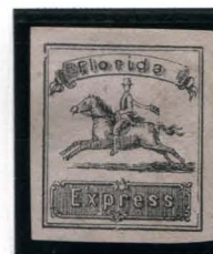
BOGUS 4 BLACK ON PINKISH GRAY