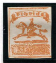
BOGUS 3 TAYLOR ORANGE ON WHITE STATE 5