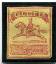
BOGUS 3 TAYLOR RED YELLOW H. LAID STATE 2