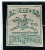
BOGUS 3 TAYLOR DEEP GREEN ON CREAM STATE 3