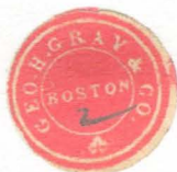
PHOTOCOPY EXAMPLE GEO. H. GRAY STAMP TYPE I WITH MANUSCRIPT "2" FROM SIEGEL, 2005 SALE 896, LOT 552

The first type of stamp, a red circular cut stamp reading "Geo. H. Gray & Co. Boston" is decorated with an ivy leaf ornament at the bottom, is recorded on five covers dated between 1847 and 1848. Two of those stamps are marked with a manuscript "2" directly below "Boston", implying a 2¢ delivery rate.