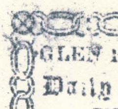
ENLARGED PHOTOCOPY OF TYPE IIIb CORNER ORNAMENTS

The cover above was mailed with a Type IIIb Glen Haven stamp. The Type IIIb stamp is identified by a circular ornament in the top left corner, and diamond-shaped ornaments in the other three corners.