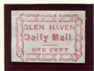
TYPE IV - FORGERY A TAYLOR - FORM C 1¢ DULL RED ON WHITE (71L3)

S. A. Taylor only produced forgeries of the "Type IV" stamp. There are various ways to tell this forgery apart, such as the typefaces being completely different for both "GLEN HAVEN" and "Daily Mail", and the colons in the chain links at the top and bottom are missing.