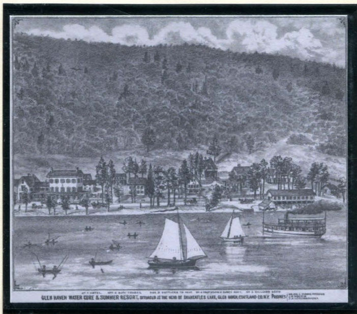
AT RIGHT: ENGRAVING OF GLEN HAVEN PUBLISHED IN STORKE'S HISTORY OF CAYUGA COUNTY, 1879.

The post ran until around 1858. Many years later, in 1910, the whole of Glen Haven would shut down as well. The city of Syracuse purchased the land and destroyed its buildings to develop a reservoir.