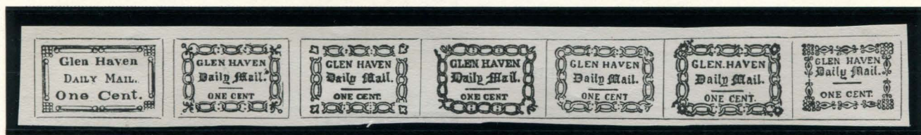
TYPES I - IIb - IIc - IIg - IV - IIIa - II FORGERY A (TYPES I, II, III) & FORGERY B (TYPE IV) SCOTT - ALBUM CUT 1¢ BLACK ON CREAM (71L1 - 71L4 - 74L4 - 71L4 - 71L3 - 71L4 - 71L2)

J. W. Scott illustrated all four main types of the "Glen Haven Daily Mail" stamps in his albums, including four varieties of the "Type III" stamp. These varieties all have different corner ornaments than any of the real stamps. The "Type I" design is missing the period after "Mail", and both the "Type II" and "Type IV" designs use a mostly unsersified typeface for "GLEN HAVEN" and "ONE CENT".