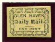
TYPE IV - FORGERY A TAYLOR - FORM C 1¢ BLACK ON YELLOW (71L3)