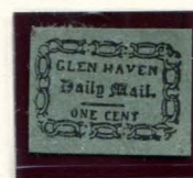
TYPE IV - FORGERY B SCOTT 1¢ BLACK ON DARK GREEN (71L3)

S. A. Taylor only produced forgeries of the "Type IV" stamp. There are various ways to tell this forgery apart, such as the typefaces being completely different for both "GLEN HAVEN" and "Daily Mail", and the colons in the chain links at the top and bottom are missing.