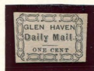
TYPE IV - FORGERY A TAYLOR - FORM CC4 1¢ BLACK ON WHITE (71L3)