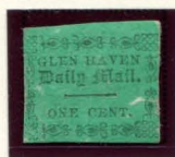
71L2 - TYPE II GENUINE 1¢ BLACK ON GREEN SC

The second Glen Haven Daily Mail stamp was printed on green surface colored paper. It featured more decorative fonts, and a border of eight decorative ornaments.