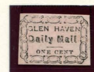
TYPE IV - FORGERY A TAYLOR - FORM CC4 1¢ BLACK ON PEACH H LAID (71L3)