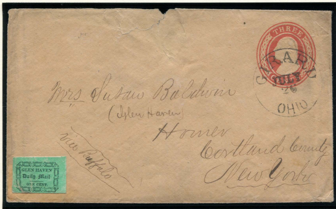
71L3 - TYPE IVb DROPPED "T" IN "CENT" | RAISED PERIOD AFTER "MAIL" 1¢ BLACK ON GREEN GLAZED SURFACE PAPER GENUINE ON COVER U9 : 3¢ RED - NESBITT ENVELOPE BLACK GIRARD, OHIO CDS - JULY 26

The cover above represents a usage of the stamp to deliver mail into Glen Haven. The 3¢ stamped envelope was cancelled in Girard, Ohio, and directed via Buffalo through the mail to Homer, New York. From there the uncanceled Glen Haven Daily Mail stamp paid for the letter's delivery into the town (noted in parenthesis under the recipient's name.)