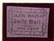
TYPE IV - FORGERY A TAYLOR - FORM CC4 1¢ BLACK ON VIOLET (71L3)