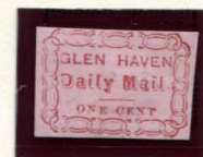
TYPE IV - FORGERY A TAYLOR - FORM C 1¢ RED ON PALE PINK H LAID (71L3)