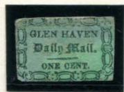
71L3 - TYPE IVc DROPPED "C" & "T" IN "CENT" GENUINE 1¢ BLACK ON GREEN SC

The fourth type of Glen Haven Daily Mail stamp has a chain-link border with no corner ornaments. There are several known variations on stamps, four of which are recorded and listed as Type IVa - Type IVd.