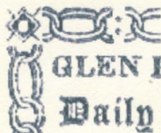
ENLARGED PHOTOCOPY OF TYPE IIIA CORNER ORNAMENTS

The cover above was sent to the Scott post office with a Type IIIa Glen Haven stamp. The Type IIIa stamp is identified by diamond-shaped corner ornaments in all four corners.