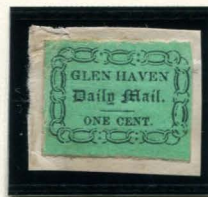
71L3 - TYPE IVvar ONLY ONE DOT IN THIRD CHAIN LINK AT TOP GENUINE 1¢ BLACK ON GREEN SC