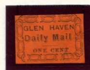
TYPE IV - FORGERY A TAYLOR - FORM CC4 1¢ BLACK ON VERMILION SC (71L3)