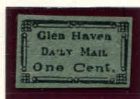
TYPE I - FORGERY A SCOTT 1¢ BLACK ON DARK GREEN (71L1)