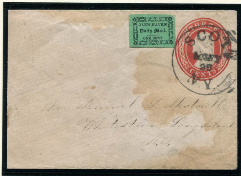
71L4 : 1¢ BLACK ON GREEN GLAZED SURFACE PAPER TYPE IIIA GENUINE ON COVER U9 : 3¢ RED - NESBITT ENVELOPE BLACK SCOTT, NEW YORK CDS - MAY 29

The third type of Glen Haven Daily Mail stamp, is actually a variety of stamps. These stamps share a chain link border, but are known with several different corner ornaments.