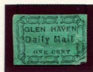
TYPE IV - FORGERY A TAYLOR - FORM C 1¢ BLACK ON GREEN SC (71L3)