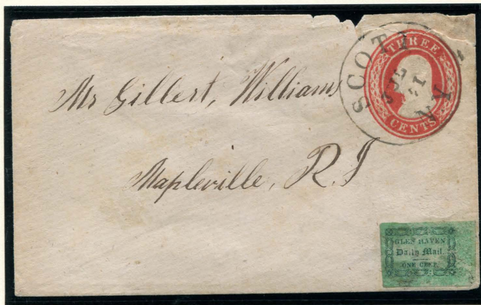
71L4 : 1¢ BLACK ON GREEN GLAZED SURFACE PAPER TYPE IIIb GENUINE ON COVER U9 : 3¢ RED - NESBITT ENVELOPE BLACK SCOTT, NEW YORK CDS - JULY 21

The cover above was mailed with a Type IIIb Glen Haven stamp. The Type IIIb stamp is identified by a circular ornament in the top left corner, and diamond-shaped ornaments in the other three corners.