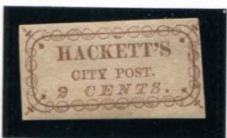
BOGUS 1 SPRINGER'S TYPE IV TAYLOR 2¢ BROWN ON LIGHT BUFF