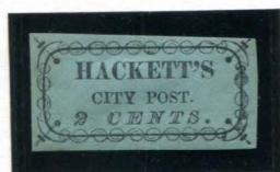
BOGUS 1 SPRINGER'S TYPE IV TAYLOR 2¢ BLACK ON PASTEL GREEN