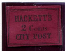
BOGUS 3 SPRINGER'S TYPE I BECKET 2¢ BLACK ON CRIMSON SC