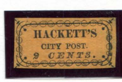
BOGUS 1 SPRINGER'S TYPE IV TAYLOR - FORM AB12 2¢ BLACK ON BRIGHT GREEN SC