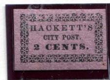
BOGUS 4 SPRINGER'S TYPE III 2¢ BLACK ON PURPLE