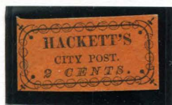
BOGUS 1 SPRINGER'S TYPE IV TAYLOR - FORM AB19 2¢ BLACK ON ORANGE SC