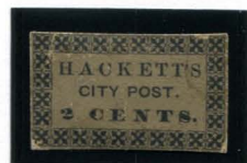
BOGUS 2 SPRINGER'S TYPE II TAYLOR - FORM CCI 2¢ BLACK ON GRAY BROWN SC