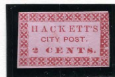
BOGUS 2 SPRINGER'S TYPE II TAYLOR - FORM C 2¢ DULL RED ON PINKISH CREAM LAID