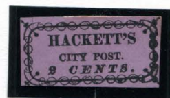
BOGUS 1 SPRINGER'S TYPE IV TAYLOR - FORM BB5 2¢ BLACK ON LIGHT VIOLET SC