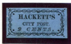
BOGUS 1 SPRINGER'S TYPE IV TAYLOR - FORM B2 2¢ BLACK ON LIGHT BLUE SC