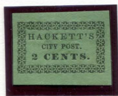
BOGUS 4 SPRINGER'S TYPE III 2¢ BLACK ON GREEN (SHADE)

Another Hackett's bogus is known that is very similar to the "Type II" stamps, but with slightly different border ornaments and "City Post" in a serif font.