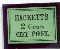
BOGUS 3 SPRINGER'S TYPE I BECKET 2¢ BLACK ON GREEN SC