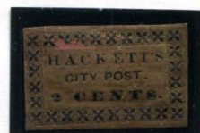
BOGUS 2 SPRINGER'S TYPE II TAYLOR - FORM CCI 2¢ BLACK ON BRONZE SC