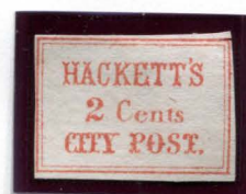
BOGUS 3 SPRINGER'S TYPE I BECKET 2¢ RED ON WHITE