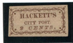
BOGUS 1 SPRINGER'S TYPE IV TAYLOR 2¢ BROWN ON BUFF