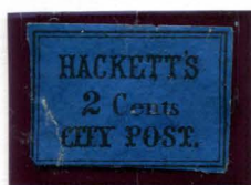
BOGUS 3 SPRINGER'S TYPE I BECKET 2¢ BLACK ON BLUE