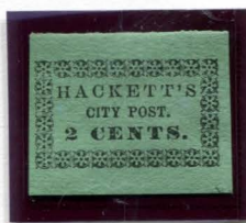
BOGUS 4 SPRINGER'S TYPE III 2¢ BLACK ON GREEN (SHADE)