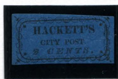
BOGUS 1 SPRINGER'S TYPE IV TAYLOR 2¢ BLACK ON DARK BLUE