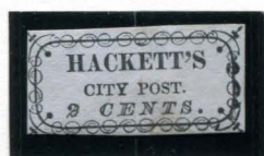
BOGUS 1 SPRINGER'S TYPE IV TAYLOR 2¢ BLACK ON PALE BLUE