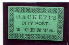
BOGUS 2 SPRINGER'S TYPE II TAYLOR - FORM C 2¢ BLACK ON GREEN SC