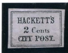
BOGUS 3 SPRINGER'S TYPE I BECKET 2¢ BLACK ON GRAY