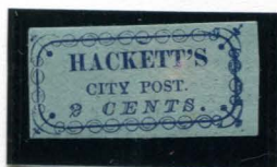
BOGUS 1 SPRINGER'S TYPE IV TAYLOR 2¢ BLUE ON PASTEL GREEN