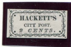
BOGUS 1 SPRINGER'S TYPE IV TAYLOR - FORM AB18 2¢ BLACK ON WHITE