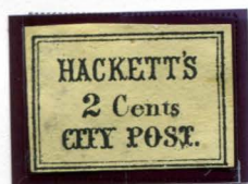
BOGUS 3 SPRINGER'S TYPE I BECKET 2¢ BLACK ON YELLOW SC