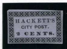
BOGUS 2 SPRINGER'S TYPE II TAYLOR - FORM CCI 2¢ BLACK ON BLUE GRAY

Another Hackett's bogus is known that is very similar to the "Type II" stamps, but with slightly different border ornaments and "City Post" in a serif font.