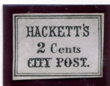
BOGUS 3 SPRINGER'S TYPE I BECKET 2¢ BLACK ON WHITE

The simple bogus featured here is the design attributed to Becket.