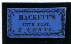
BOGUS 1 SPRINGER'S TYPE IV TAYLOR - FORM BB5 2¢ BLACK ON BRIGHT BLUE SC