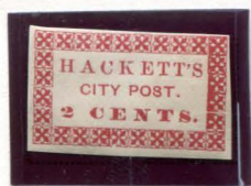
BOGUS 2 SPRINGER'S TYPE II TAYLOR - FORM C 2¢ DULL RED ON WHITE