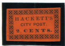
BOGUS 2 SPRINGER'S TYPE II TAYLOR - FORM CCI 2¢ BLACK ON VERMILION SC