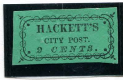
BOGUS 1 SPRINGER'S TYPE IV TAYLOR - FORM AB18 2¢ BLACK ON LIGHT ORANGE