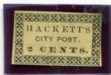
BOGUS 2 SPRINGER'S TYPE II TAYLOR - FORM C 2¢ BLACK ON YELLOW