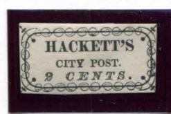
BOGUS 1 SPRINGER'S TYPE IV TAYLOR - FORM AB18 2¢ BLACK ON OFF-WHITE