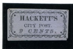
BOGUS 1 SPRINGER'S TYPE IV TAYLOR 2¢ BLACK ON GRAY BLUE