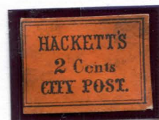
BOGUS 3 SPRINGER'S TYPE I BECKET 2¢ BLACK ON ORANGE SC