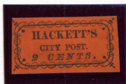
BOGUS 1 SPRINGER'S TYPE IV TAYLOR - FORM B2 2¢ BLACK ON LIGHT BLUE SC