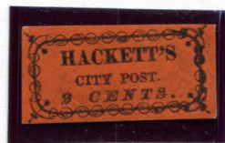
BOGUS 1 SPRINGER'S TYPE IV TAYLOR - FORM AB12 2¢ BLACK ON VERMILION SC