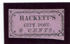
BOGUS 1 SPRINGER'S TYPE IV TAYLOR - FORM AB12 2¢ BLACK ON LILAC SC