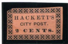
BOGUS 2 SPRINGER'S TYPE II TAYLOR - FORM CCI 2¢ BLACK ON PEACH SC