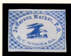
BOGUS 2 TAYLOR - FORM BB6 2c ULTRAMARINE ON WHITE