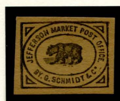
BOGUS 3 STIRLING 2c BLACK ON GOLD BROWN