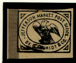
MODERN FORGERY 2¢ BLACK ON BUFF (88L1)