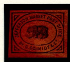
BOGUS 3 STIRLING 2c BLACK ON BROWN RED