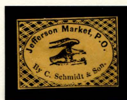
BOGUS 1 TAYLOR - FORM CC2 2c BLACK ON ORANGE BUFF