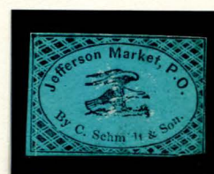
BOGUS 1 TAYLOR - FORM CC2 2c BLACK ON TEAL SC