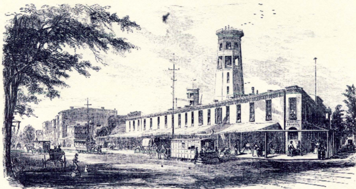
JEFFERSON MARKET, SIXTH AVENUE, NEW YORK CITY.

WOODCUT ENGRAVED IMAGE OF JEFFERSON MARKET AROUND 1857