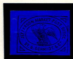
FORGERY A SCOTT 2¢ BLACK ON ROYAL BLUE SC (88L2)

Not many other forgeries are known of the "Jefferson Market Post Office" stamps, but there are a few modern interpretations. This version has a large "O" in "Co.", and a period before "JEFFERSON".