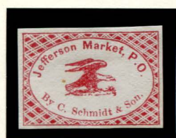
BOGUS 1 TAYLOR - FORM C 2c DULL RED ON WHITE