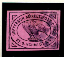
FORGERY A SCOTT 2¢ BLACK ON HOT PINK SC (88L1) WITH CIRCULAR GRID CANCELLATION