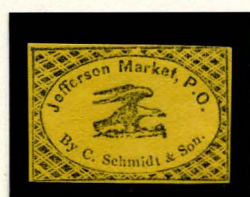
BOGUS 1 TAYLOR - FORM CC2 2c BLACK ON GOLD YELLOW SC