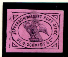
FORGERY A SCOTT 2¢ BLACK ON HOT PINK SC (88L1)