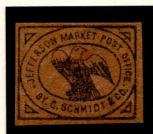
MODERN FORGERY 2¢ BLACK ON BROWN (88L1)

Not many other forgeries are known of the "Jefferson Market Post Office" stamps, but there are a few modern interpretations. This version has a large "O" in "Co.", and a period before "JEFFERSON".