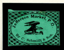
BOGUS 1 TAYLOR - FORM C 2c BLACK ON GREEN SC