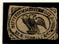
FORGERY A SCOTT - ALBUM CUT 2¢ BLACK ON BUFF (88L1)