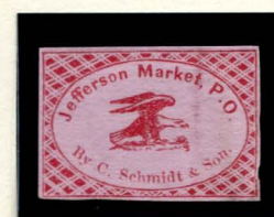
BOGUS 1 TAYLOR - FORM C 2c RED ON PALE PINK V. LAID