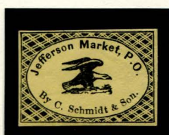
BOGUS 1 TAYLOR - FORM C 2c BLACK ON YELLOW