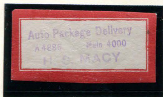
AUTO PACK. DELIVERY 2ND ISSUE STAMP 10¢ PURPLE & RED