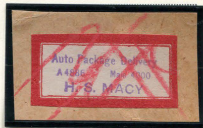
AUTO PACK. DELIVERY 2ND ISSUE STAMP 10¢ PURPLE & RED USED ON PIECE PINK CRAYON CANCEL