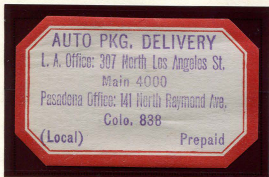
AUTO PACK. DELIVERY 1ST ISSUE STAMP 15¢ PURPLE & RED

At least two types of stamps were used by the company, both made with a purple handstamp on a red bordered adhesive label. Eventually the stamps were discontinued, although the company continued deliveries without them.