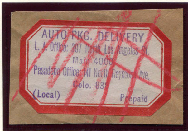
AUTO PACK. DELIVERY 1ST ISSUE STAMP 15¢ PURPLE & RED USED ON PIECE PINK CRAYON CANCEL