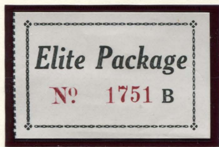
ELITE PACK. DELIVERY TYPE 3 BLACK & RED ON WHITE CONTROL # 1751 B

A new type of stamp, similar to the previous issue, were used around mid-1914. These used red control numbers with additional control letters.