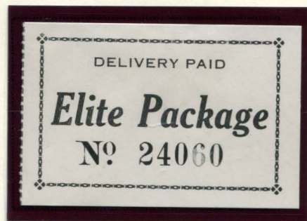
ELITE PACK. DELIVERY TYPE 2 BLACK ON WHITE CONTROL # 24060 (CIRCA 1914)

A new type of stamp, similar to the previous issue, were used around mid-1914. These used red control numbers with additional control letters.