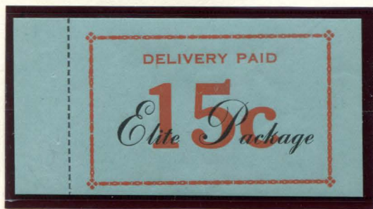
ELITE PACK. DELIVERY 15¢ RED & BLACK ON GREEN

The first stamps were printed in red and black on a bluish-green paper. These stamps were only used for about a year.