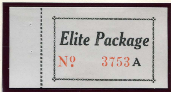
ELITE PACK. DELIVERY TYPE 3 BLACK & RED ON WHITE CONTROL # 3753 A WITH BOOKLET MARGIN AT LEFT