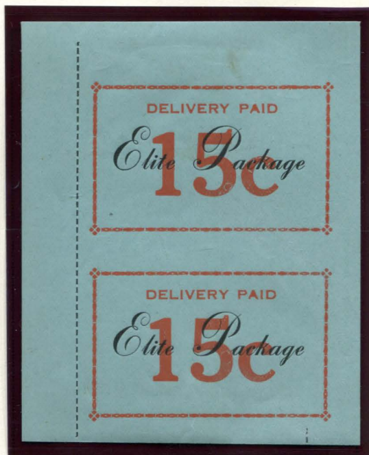
ELITE PACK. DELIVERY 15¢ RED & BLACK ON GREEN VERTICAL PAIR ONLY KNOWN PAIR