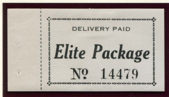
ELITE PACK. DELIVERY TYPE 2 BLACK ON WHITE CONTROL # 14479 (CIRCA 1912) WITH BOOKLET MARGIN AT LEFT

According to an interview with Mr. Hamilton, he changed the style of control numbers and started over at No. 1 several times during the stamps' usage.