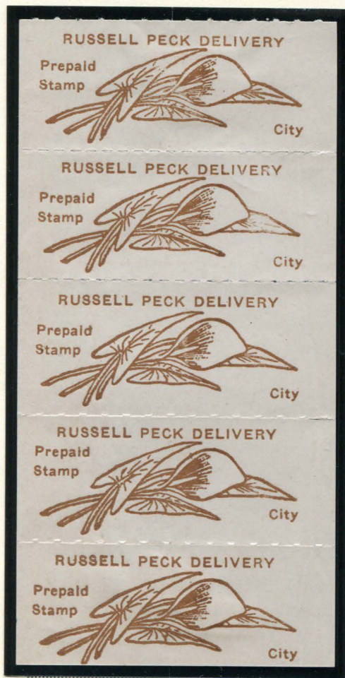
RUSSELL PECK DELIVERY TYPE 1 10¢ BROWN ON WHITE BOOKLET PANE OF FIVE HYPHEN-HOLE & ROULETTE

The first issue of these stamps appear to use two different rouletting styles within the same pane. The upper stamps were cut with short hyphen holes; the lower stamps were cut with longer roulette slits.