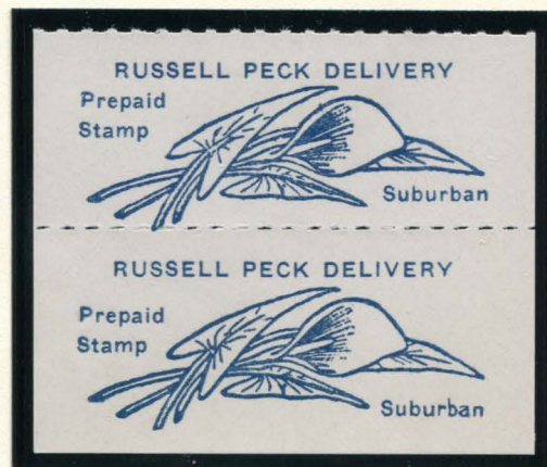
RUSSELL PECK DELIVERY TYPE 2 15¢ BLUE ON WHITE VERTICAL PAIR HYPHEN-HOLE

Stamps were sold in booklets. Each booklet pane contained five stamps of the same type.