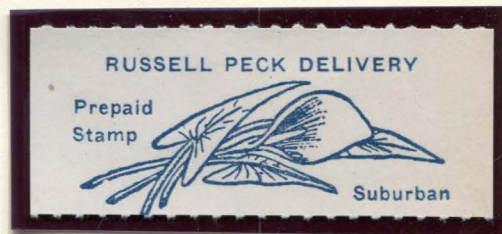
RUSSELL PECK DELIVERY TYPE 2 15¢ BLUE ON WHITE HYPHEN-HOLE