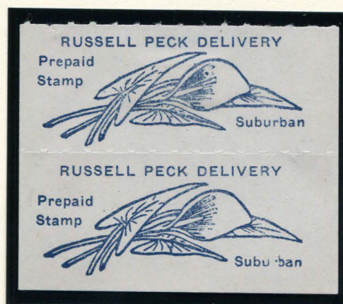
RUSSELL PECK DELIVERY TYPE 1 15¢ BLUE ON WHITE VERTICAL PAIR ROULETTE