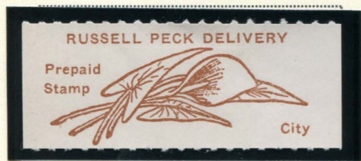
RUSSELL PECK DELIVERY TYPE 2 10¢ BROWN ON WHITE HYPHEN-HOLE

The second issue of Russell Peck Delivery stamps were separated only by hyphen-hole roulette.