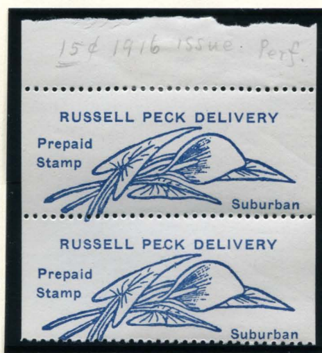
RUSSELL PECK DELIVERY TYPE 3 15¢ BLUE ON WHITE VERTICAL PAIR PERFORATED