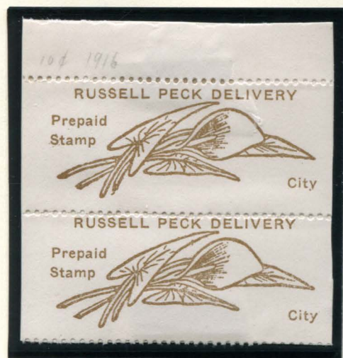
RUSSELL PECK DELIVERY TYPE 3 10¢ LIGHT BROWN ON WHITE VERTICAL PAIR PERFORATED

The third stamps issued by Russell Peck Delivery were perforated at gauge 12 rather than rouletted. Different printings resulted in shade variations.