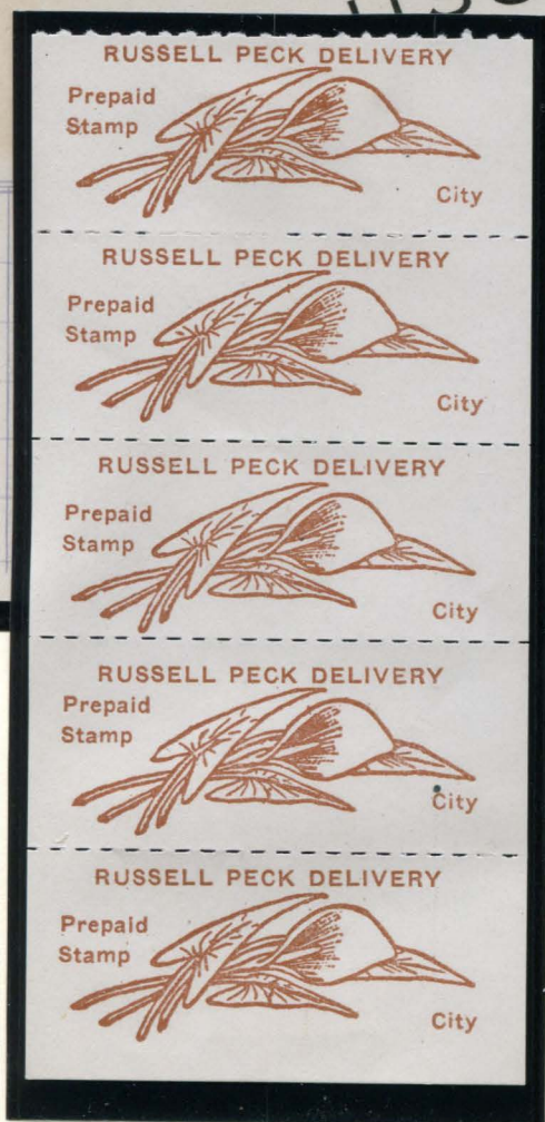
RUSSELL PECK DELIVERY TYPE 2 10¢ BROWN ON WHITE BOOKLET PANE OF FIVE HYPHEN-HOLE

DELIVERY ESTABLISHED 1903 SUBURBAN DELIVERY