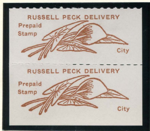
RUSSELL PECK DELIVERY TYPE 2 10¢ BROWN ON WHITE VERTICAL PAIR HYPHEN-HOLE