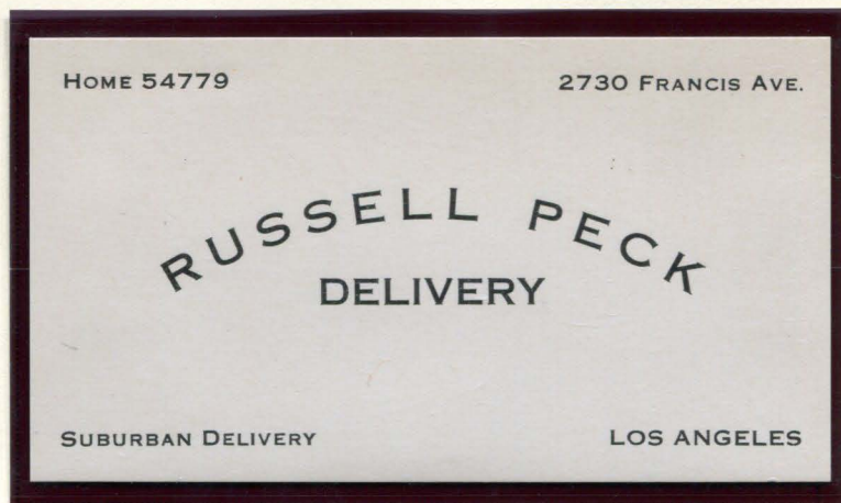
RUSSELL PECK DELIVERY BUSINESS CARD