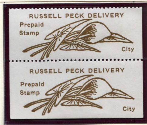
RUSSELL PECK DELIVERY TYPE 3 10¢ DARK BROWN ON WHITE VERTICAL PAIR PERFORATED