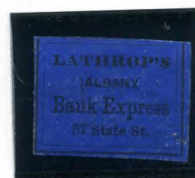
BOGUS BLACK ON DEEP BLUE SC