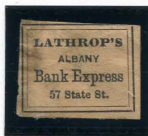
BOGUS BLACK ON BUFF