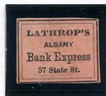
BOGUS BLACK ON PEACH SC