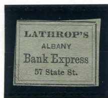
BOGUS BLACK ON TAN

The address listed on these stamps, 57 State Street, is also the location of Gavit & Co., the engraving and printing company that printed the Pomeroy Express stamps.