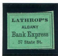
BOGUS BLACK ON GREEN SC