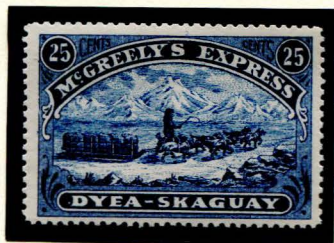
155L1 25¢ BLUE ON WHITE GENUINE