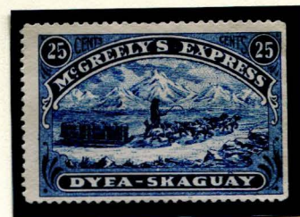
155L1 25¢ BLUE ON WHITE GENUINE RIGHT MARGIN POSITION

A variation in at least one position results in two dots printed in the bottom right corner.