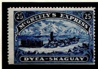
155L1 25¢ BLUE ON WHITE GENUINE BOTTOM MARGIN POSITION