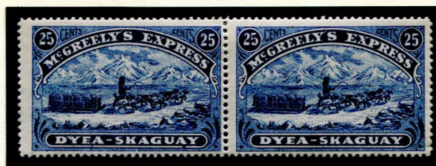
155L1 25¢ BLUE ON WHITE GENUINE - HORIZONTAL PAIR BREAK UNDER "A" IN SKAGUAY & TWO DOTS VARIATION