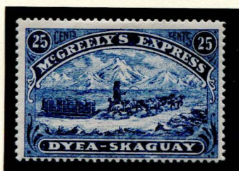
155L1 25¢ BLUE ON WHITE GENUINE TWO DOTS VARIATION

A variation in at least one position results in two dots printed in the bottom right corner.