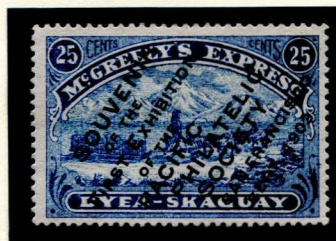
155L1 25¢ BLUE ON WHITE GENUINE PHILATELIC OVERPRINT