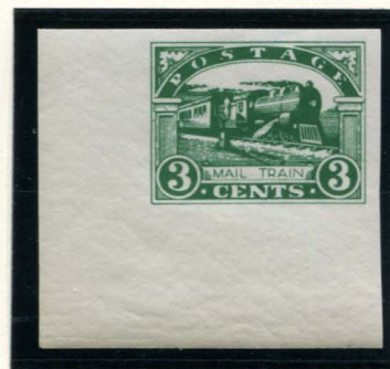
BOGUS 3¢ GREEN ( SHADE ) ON WHITE IMPERFORATE