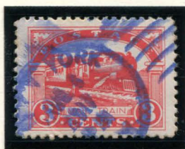
BOGUS 3¢ BRIGHT RED ( SHADE ) ON WHITE IMPERFORATE CANCELLED BLUE NEW YORK CDS