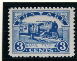
BOGUS 3¢ BLUE ( SHADE ) ON WHITE PERFORATED