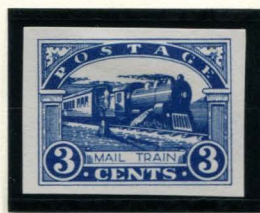
BOGUS 3¢ BLUE ( SHADE ) ON WHITE IMPERFORATE