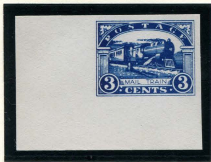
BOGUS 3¢ BLUE ( SHADE ) ON WHITE IMPERFORATE