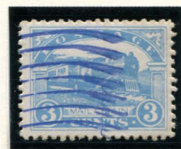
BOGUS 3¢ LIGHT BLUE ( SHADE ) ON WHITE IMPERFORATE CANCELLED BLUE WAVY LINES