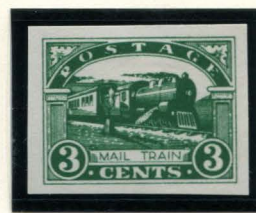
BOGUS 3¢ GREEN ( SHADE ) ON WHITE IMPERFORATE