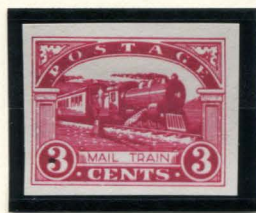
BOGUS 3¢ RED ( SHADE ) ON WHITE IMPERFORATE