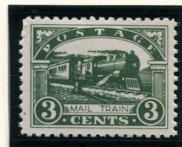
BOGUS 3¢ GREEN ( SHADE ) ON WHITE PERFORATED