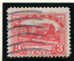
BOGUS 3¢ BRIGHT RED ( SHADE ) ON WHITE IMPERFORATE CANCELLED BLACK WAVY LINES