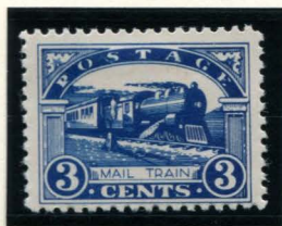
BOGUS 3¢ BLUE ( SHADE ) ON WHITE PERFORATED