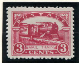
BOGUS 3¢ RED ( SHADE ) ON WHITE PERFORATED