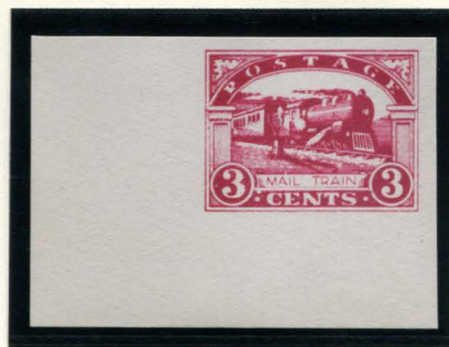
BOGUS 3¢ RED ( SHADE ) ON WHITE IMPERFORATE