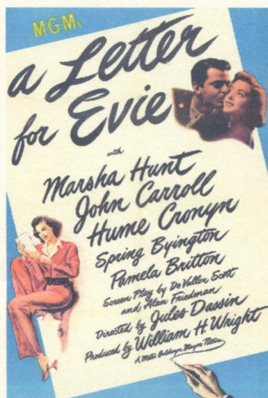
COPY OF FILM POSTER A LETTER FOR EVIE

Remaining copies of the stamp are considered Cinderella items by stamp collectors, and come in both perforated and imperforated varieties.