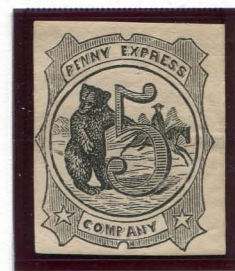
FORGERY A TAYLOR - FORM 17 5c BLACK ON CREAM (114L1)

Forgery B can also be attributed to Taylor. A partial offset print of the design can be found along with other Taylor fakes on the reverse of a Swift & Co. Express forgery.