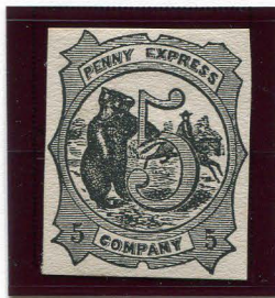
FORGERY D 5¢ INTENSE BLACK ON WHITE (114L1)