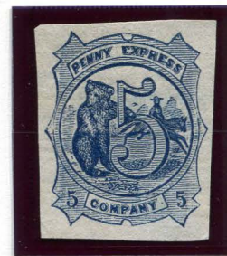
FORGERY B TAYLOR 5c DARK BLUE ON WHITE LAID (114L2)