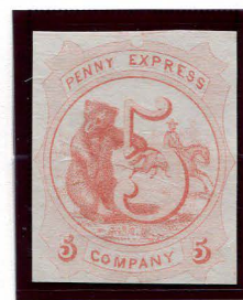
114L3 GENUINE 5¢ RED ON WHITE

These stamps were printed in three colors: black, blue, and red. Of these, the black is the most scarce, and was the only one issued with gum. Stamps were printed in sheets of 32. The following pages feature full sheets of both the blue (114L2) and red (114L3) stamps.