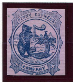
FORGERY A TAYLOR - FORM 11 5c BLUE ON PINK H. LAID (114L2)