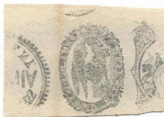
PHOTOCOPY OF SWIFT & CO. EXPRESS FORGERY TAYLOR FORGERY WITH OFFSET FORGERIES ON REVERSE BERFORD & CO. 3c FORGERY B | BROWN & MCGILL FORGERY C PENNY EXPRESS FORGERY B