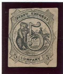
FORGERY B TAYLOR 5c BLACK ON BUFF (114L1)