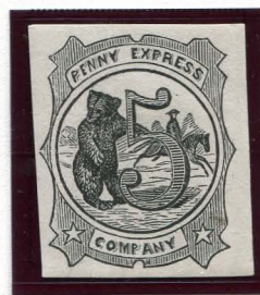
FORGERY A TAYLOR - FORM 17 5c BLACK ON WHITE (114L1)