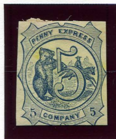
FORGERY B TAYLOR 5c BLUE ON YELLOW (114L2)