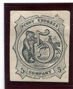
FORGERY B TAYLOR - FORM AB7 5c BLACK ON WHITE (114L1)