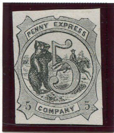
FORGERY D 5¢ BLACK ON WHITE (114L1)

It is unknown who printed the following forgeries.