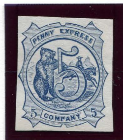
FORGERY B TAYLOR 5c BLUE ON WHITE (114L2)