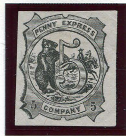
FORGERY D1 5¢ BLACK ON WHITE (114L1)