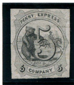
114L1 GENUINE 5¢ BLACK ON WHITE

Stamps for the express were printed, but none are known used. This is probably because only a few months later it was reported that Reed, still entangled in lawsuits from the failed Adam's & Co. California venture, was reported to have fled the city, returning to the East Coast. It is likely the post did not carry mail at all.