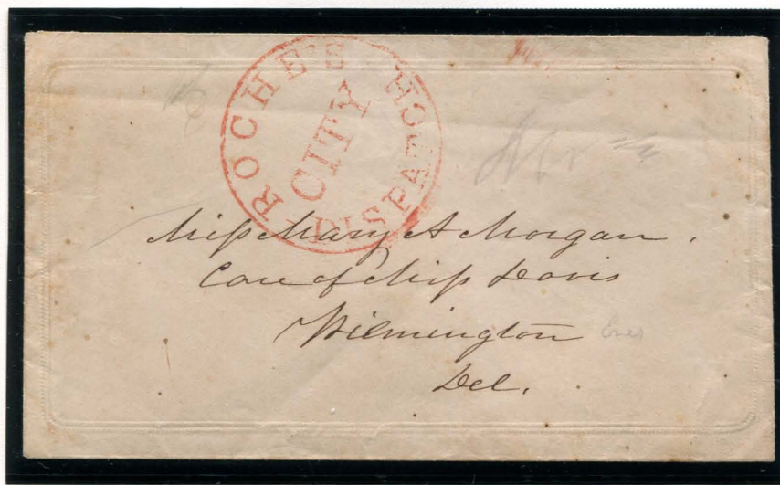
ROCHE'S CITY DISPATCH CIRCULAR HANDSTAMP GENUINE ON COVER