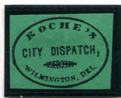
FORGERY MODERN COPY SCOTT 2¢ BLACK ON THICK GREEN (129L1)