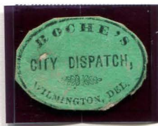
129L1 GENUINE 2c BLACK ON GREEN SC