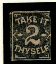
BOGUS TYPE I BLACK ON MANILA

A photocopy of a Weaver & Holh wrapper is featured below as an example.