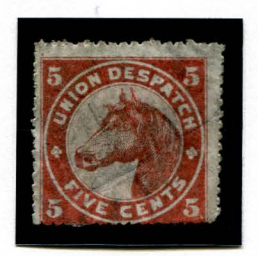
170L1 GENUINE 5¢ BROWNISH RED ON WHITE

These mysterious stamps were long considered bogus. The excess of forgeries and extreme rarity of real stamps made it suspicious to many collectors. Recorded in philatelic journals as early as 1875, the stamps were not listed as genuine in the Scott Specialized Catalogue until 2018. The genuine stamps can be identified by a background of very thin (almost invisible) vertical lines behind the horse head in the center of the design, and irregular perforation.