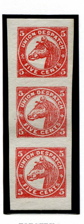
FORGERY A 56 RED (SHADE) ON ROUGH WHITE VERTICAL STRIP OF THREE

The Union Despatch Forgery A stamps are known printed in multiples or on papers with forgeries of other locals, such as Warwick's or Boyd's (below).