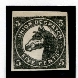
FORGERY A 5¢ BLACK (SHADE) ON STIFF WHITE