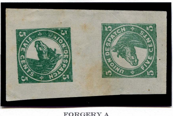
FORGERY A 5¢ GREEN (SHADES) ON THIN WHITE TETE-BECHE PAIR

Union Despatch Forgery A stamps are known printed in multiples or on papers with forgeries of other locals. Impressions were not uniformly arranged, resulting in tête-bêche or turned pairs.