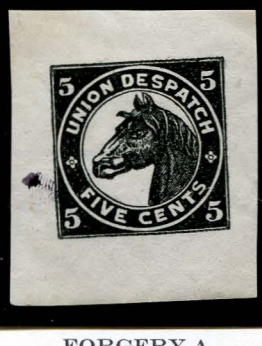
FORGERY A 5¢ BLACK (SHADE) ON WHITE

FORGERY A 5¢ BLACK (SHADE) ON THIN WHITE