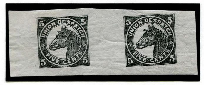
FORGERY A 5¢ BLACK (shades) ON THIN WHITE HORIZONTAL PAIR

FORGERY A 5¢ GREEN (SHADES) ON ROUGH WHITE HORIZONTAL STRIP OF THREE