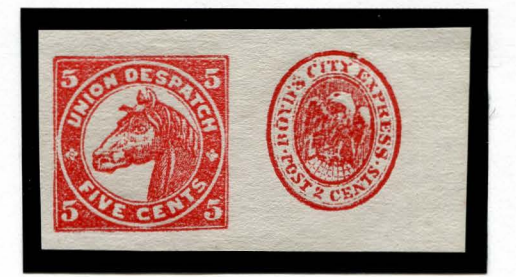
FORGERY A 5¢ RED (SHADE) ON ROUGH WHITE PAIR WITH BOYD'S FORGERY D, TYPE X

The Union Despatch Forgery A stamps are known printed in multiples or on papers with forgeries of other locals, such as Warwick's or Boyd's (below).