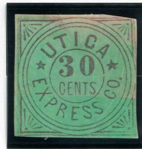
BOGUS MOSHER #UTCX-S1 30¢ RED (SHADE) ON GREEN SC