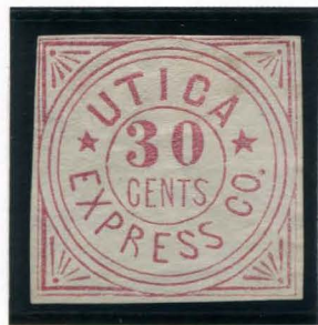
BOGUS MOSHER #UTCX-S1 30¢ RED (SHADE) ON BUFF