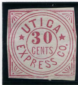
BOGUS MOSHER #UTCX-S1 30¢ RED (SHADE) ON STIFF WHITE