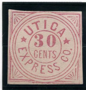
BOGUS MOSHER #UTCX-S1 30¢ RED (SHADE) ON PINKISH BUFF