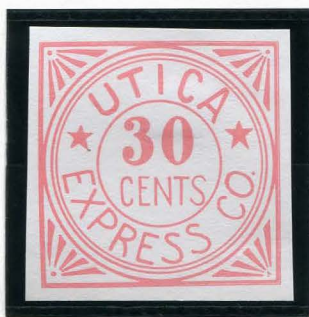
1978 BOGUS MOSHER #UTCX-S2 30¢ PINK ON WHITE

Although the stamp was never proven to be real or even based on a real company, the Utica Stamp Club printed a version of the design in 1978. This version is easily identified by its modern appearance and the small "A" that replaces the dot in the lower right corner.