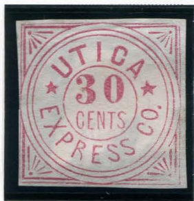
BOGUS MOSHER #UTCX-S1 30¢ RED (SHADE) ON STIFF WHITE

This somewhat scared bogus has been reported created around 1878. There is no evidence that it was ever authentic, and the designer/forgery is currently unknown.